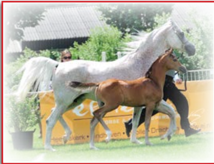
SILVER MEDAL COLTS FOALS ERO'S VYTO T (VITORIO TA X KARONA) O&B: VAN DUIJVENBODE FAMILY