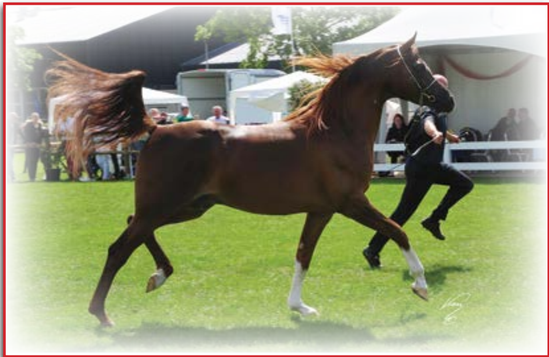
GOLD MEDAL STALLIONS - BB ESCONDHIO (AMALFI X FA JADA)