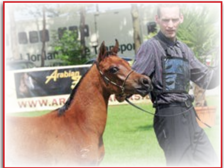
BRONZE MEDAL COLTS FOALS MUCHAQUITO (AF UMOYO X QITA) O&B: S. VOLLENBROEK