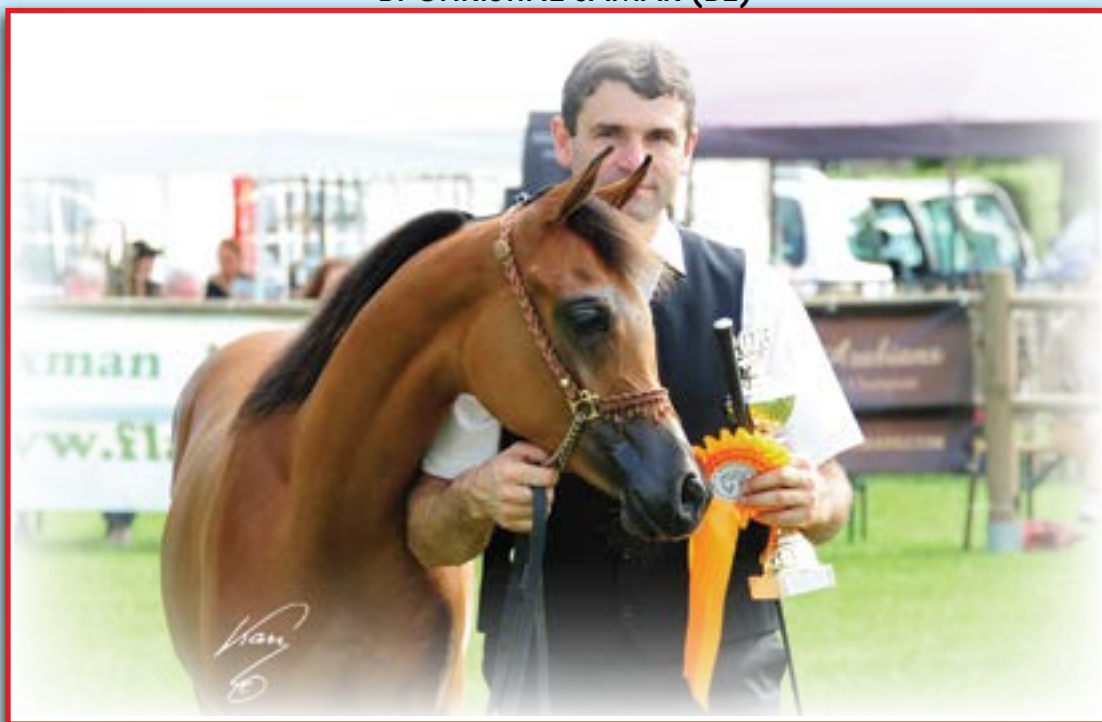
BRONZE MEDAL COLTS - MEDOR MONISCIONE (AJMAN MONISCIONE x MEDEA MONISCIONE) - O&B: AZ. AGR. BUZZI GIANCARLO (IT)