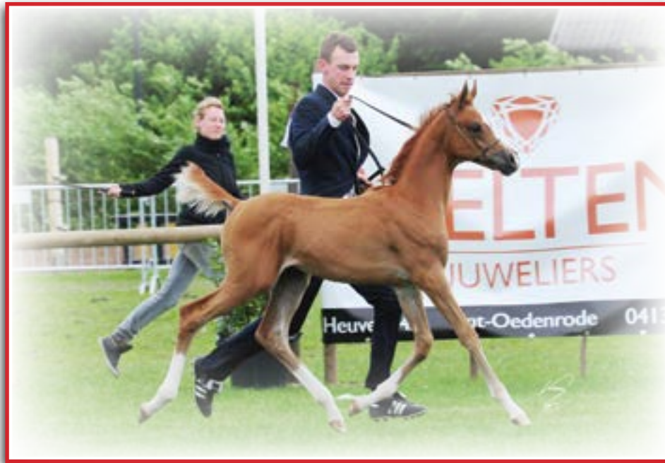
GOLD MEDAL COLTS FOALS & BEST MOVEMENT FORELOCK'S LACOSTE (PSYTADEL X LA BELLE) - O&B: FORELOCKS ARABIANS