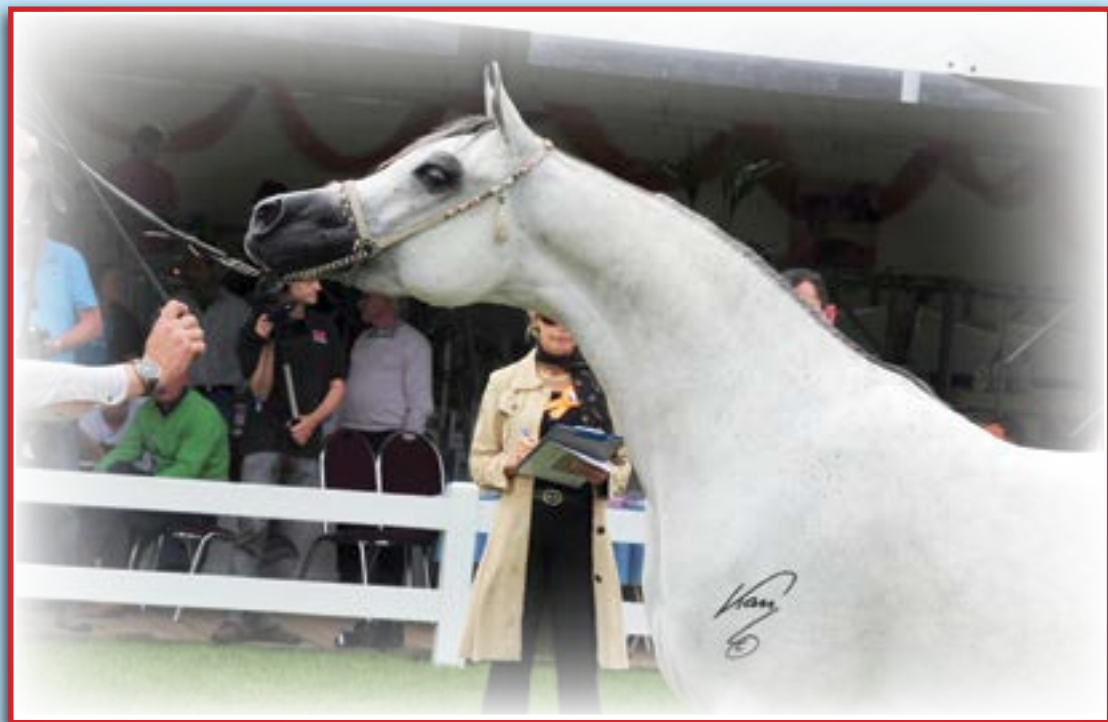
SILVER MEDAL MARES - NOORAN AL KHALEDIAH (PADRONS IMAGE x ROBIN K) - O&B: AL KHALEDIAH STABLES (KSA)