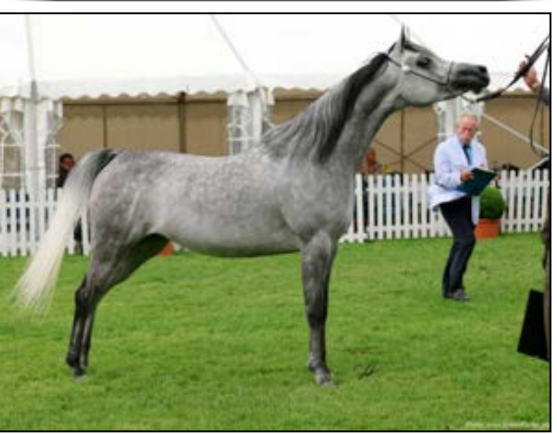
PYRAMID KAHILEH K