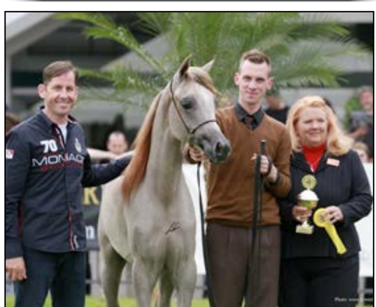
PSE AL RAKHAN

(Royal Colours x PSE Mistrez) B&O: Prestige Straight Egyptians