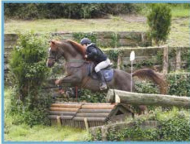
THIRD PLACE GELDINGS - BRONZE MEDAL LAG DAMANHUR CROSS - RIDER JULIAN VINUESA