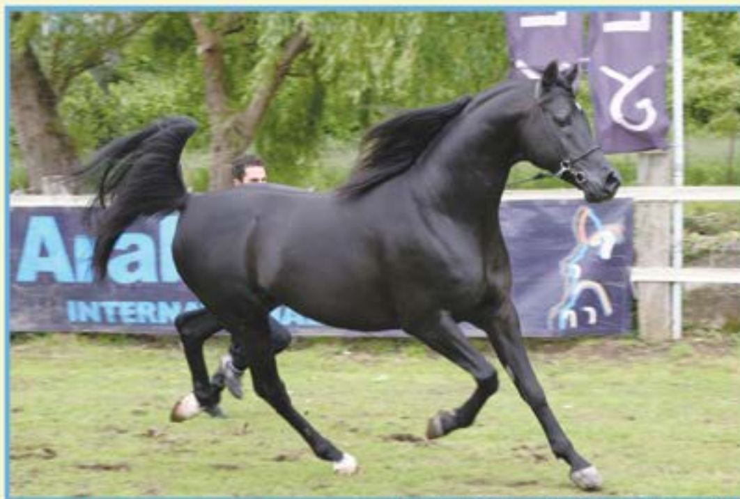
CHAMPION STALLION - GOLD MEDAL MONOGRAMM JM - HIGHEST SCORE STALLION

T he 19th edition of the Arabes&Co show was held on the weekend of May 18th and 19th at the La Gerencia Centro Ecuestre showgrounds in Mioño (Cantabria, Spain). The Arabes&Co show is the most important arabian horse show in Spain, and combines an ECAHO-B halter show with a sport competition, and the Special Arabes&Co Trophy is awarded to that special horse who gets the highest total points for halter and sport. Total entries were 70, and 25 of them also competed in the sport classes. Climatic conditions were not too bad, although some showers interrupted the halter show for a few minutes now and then.