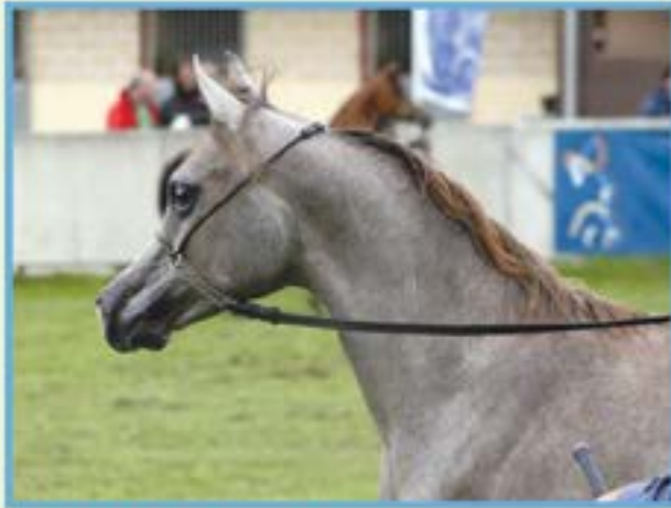
THIRD PLACE COLTS - BRONZE MEDAL DAA SAIGON