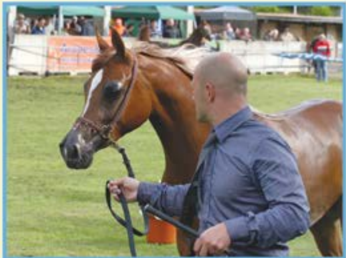
THIRD PLACE FILLIES - BRONZE MEDAL - RIHANNA BV