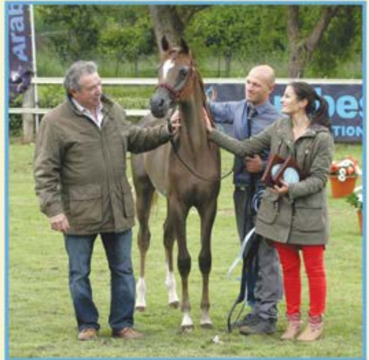
CHAMPION FILLY - GOLD MEDAL - SASKIA BV HIGHEST SCORE FILLY

Several interesting and nice stallions in both stallions classes, most of them in the junior stallion class, four to six