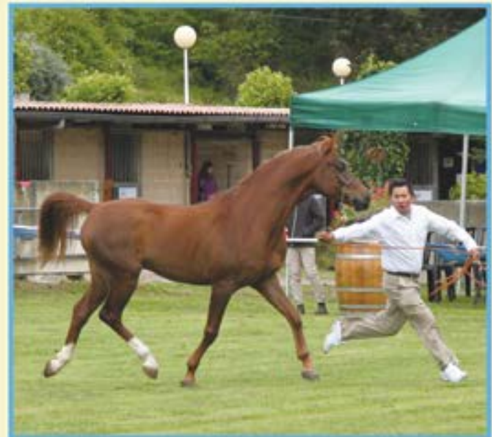
RESERVE CHAMPION GELDINGS SILVER MEDAL FL CUZKO