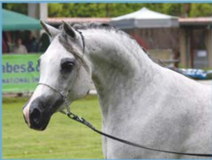
CHAMPION MARE - GOLD MEDAL BORÉALE CATHARE - HIGHEST SCORE MARE