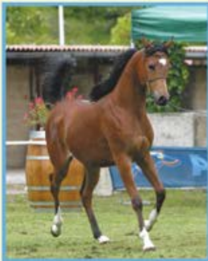
RESERVE CHAMPION COLTS - SILVER MEDAL MARRAKECH HDM HIGHEST SCORE COLT