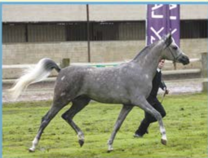
CHAMPION COLT - GOLD MEDAL - MANSOUR AL HAWAJER