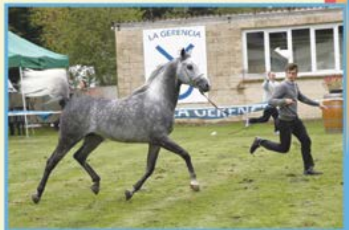
2ND PLACE STALLIONS 7 YEARS AND OLDER - ANWAR IMAN HANDLER: BERNAT TOLRA