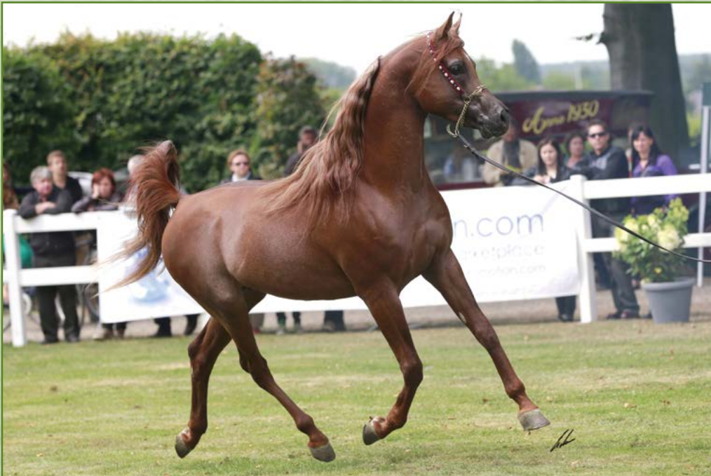
FRASERA DUBAI (PHAAROS x FRASERA MASHARA) B/O: LA FRASERA (IT) SPONSORED BY: BAIT EL ARAB