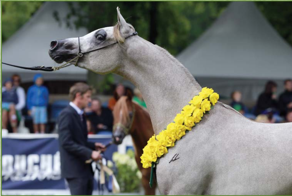
PSE AL RAKHAN SPONSORED BY: SALAYEL ARABIANS