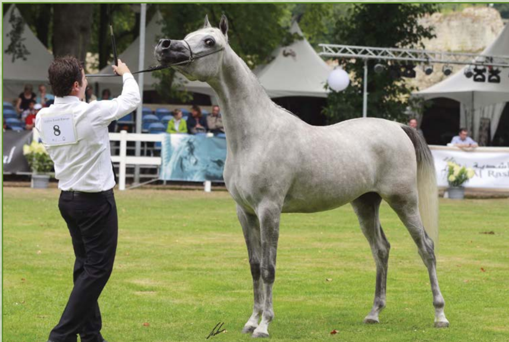
BARIQ AL SHAQAB

(AL ADEED AL SHAQAB x WAHAYEB AL SHAQAB) B/O: AL SHAQAB (QA)