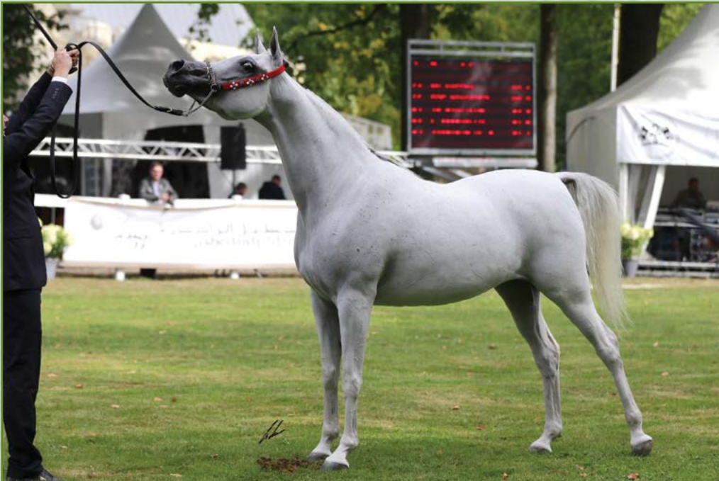
HOORIA AL SHAQAB

(AL ADEED AL SHAQAB x HANOUF AL SHAQAB) B/O: AL SHAQAB STUD (QA) SPONSORED BY: AL KHALED FARM