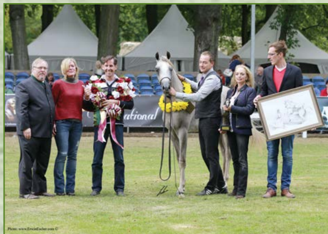
PSE AL RAKHAN (ROYAL COLOURS x PSE MISTREZ) B/O: PRESTIGE STRAIGHT EGYPTIANS SPONSORED BY: AL KHALEDIAH FARM