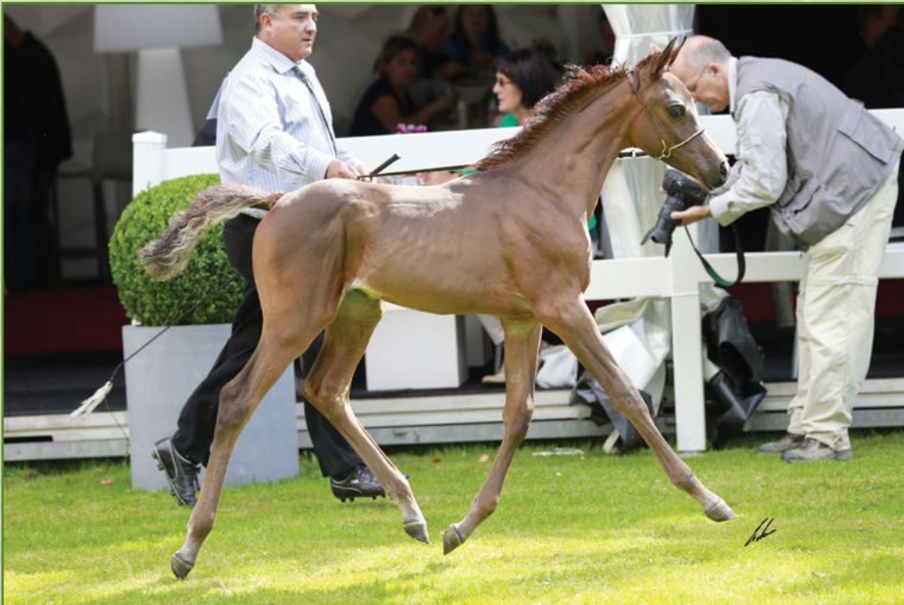
NEITH AL MANZAH