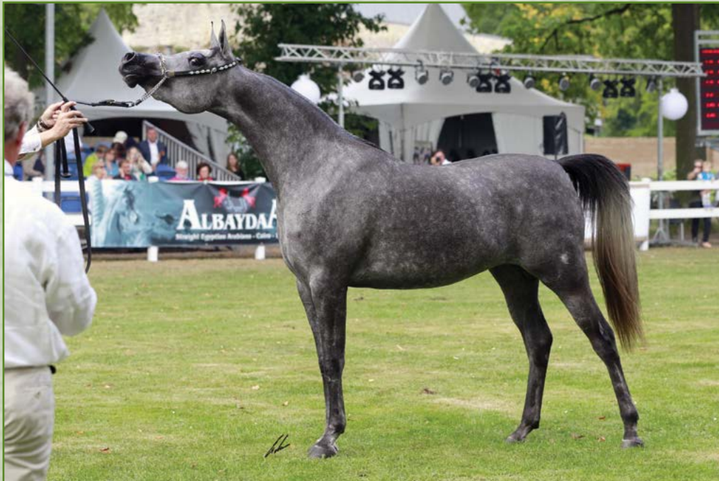
SHAHEDAT AL KHALEDIAH

(ARBAN x THEE EVENING STAR) B/O: HRH PRINCE KHALID BIN SULTAN BIN ABDUL AZIZ AL SAUD (KSA)