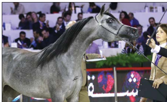
GHALA AL SHAQAB

Kahil Al Shaqab x Aleysha Al Nasser O&B: Al Shaqab Stud