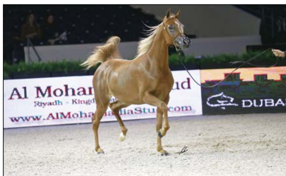
DELIGHT'S DIVAH RB

Ajman Moniscione x Wioletta O&B: Scuderia Groane