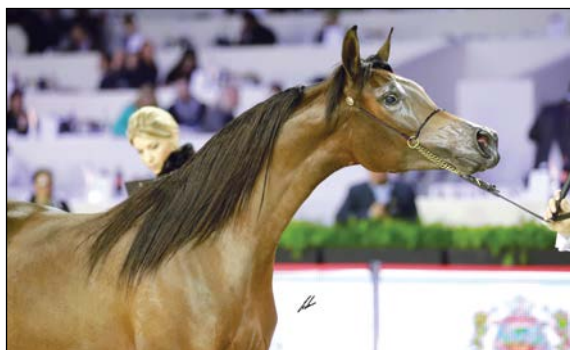
KAHLAH AL SHAQAB

Ajman Moniscione x Mikaela PIN O: Gestüt Osterhof - B: Family Stöckle