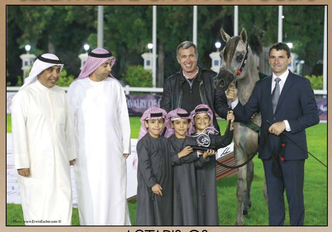
ANTARIS OS RFI FARID x JUSTINA - owner: AJMAN STUD - breeder: STOECKLE, GESTUET OSTERHOF