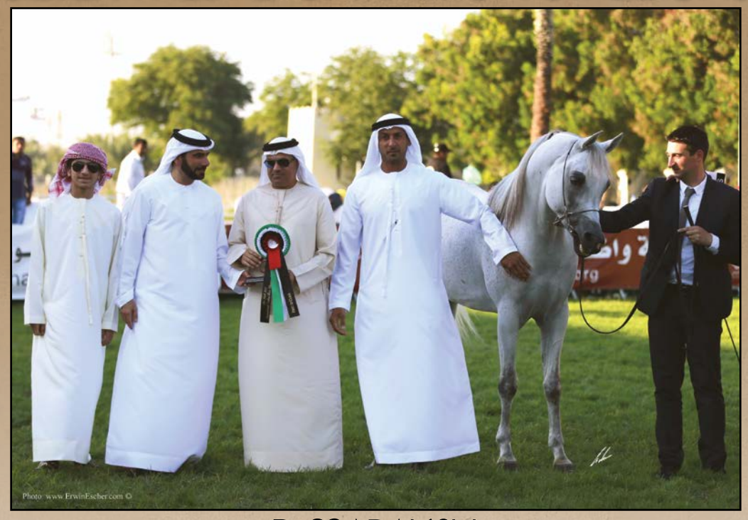
D MARAKSH ROYAL COLOURS x KAR OFELIA - owner/breeder: DUBAI ARABIAN HORSE STUD