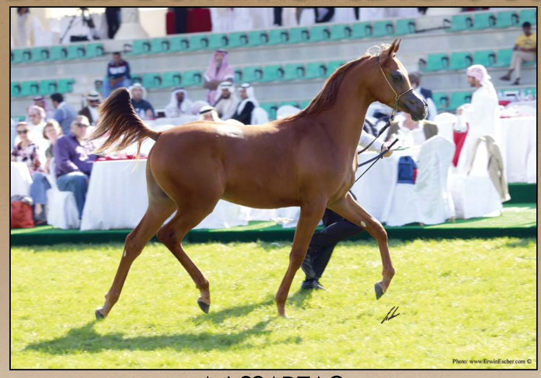
AJ PORTOFINO x HED AB MARIA - owner/breeder: AJMAN STUD