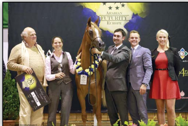
2 nd pl. TOP FIVE Yearlings ATHBAYAT JJ

EMERALD J x MAGNIFICENT LADY J B: JADEM ARABIANS (BE) - O: AL MUAWD STUD (KSA)