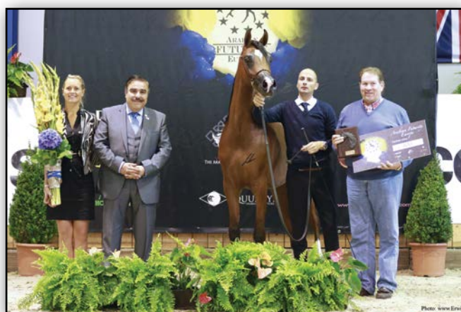
5 th pl. TOP FIVE Yearlings NAJD AM

PSYTADEL x VEKAISA F B: FORELOCK'S ARABIANS (NL) - O: VDV MANAGEMENT (NL)