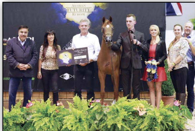
4 th pl. TOP FIVE Yearlings FORELOCK'S VERONIQUE