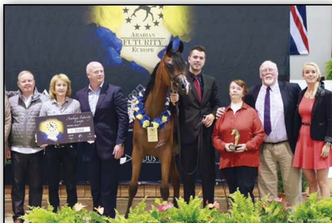
1 st pl. TOP FIVE Yearlings MOUNIRA J

EMERALD J x MAGNIFICENT LADY J B: JADEM ARABIANS (BE) - O: AL MUAWD STUD (KSA)