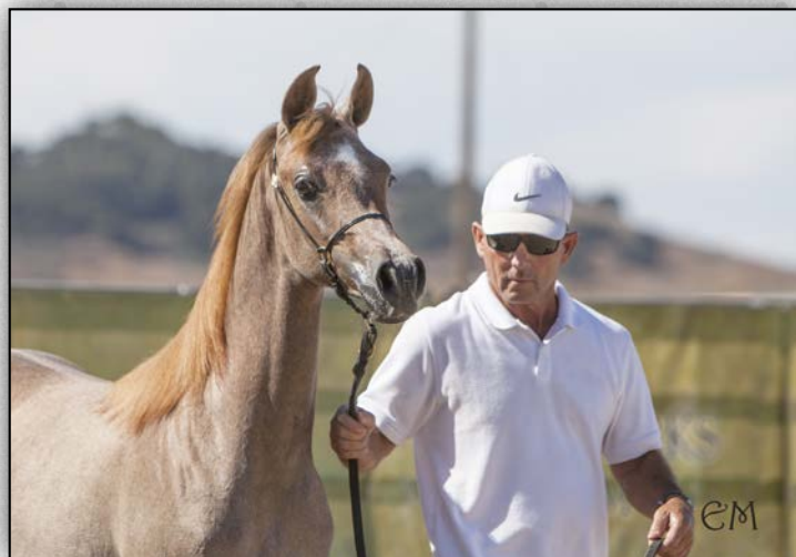
SILVER CHAMPION FOAL FILLY MONYAT ALJASSIMYA (Monther Al Nasser x RP Miss Surprise) - B/O: AlJassimya Farm