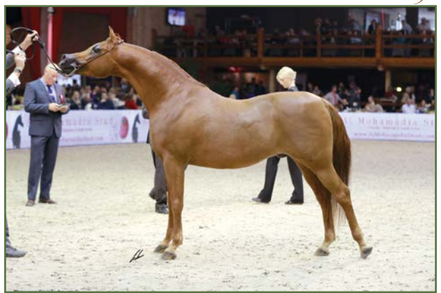
F SHAVAL 11 Years and Older Stallions