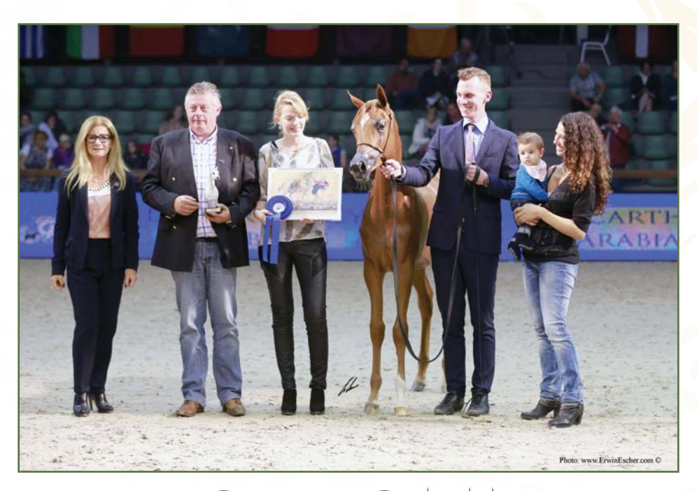
Silver Medal Foal Fillies (AJ MARDAN x FELICJA GALAA) B: GRASSI ELISA (DE) / O: DC INVEST (BE)