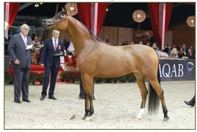
MSSISSIPPI I Three Years Old Fillies A