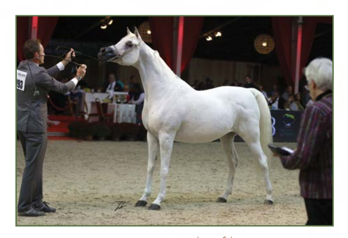
ATHENAA 11 Years and Older Mares