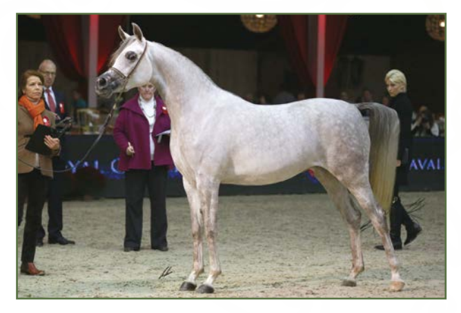
DA MAGIC MOMINI Two Years Old Fillies B