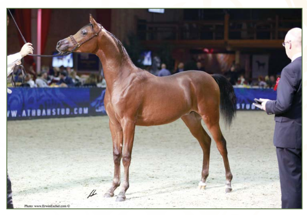
(PSYTADEL x MAHITY EL JAMAAL) B/O: JEAN MATTENS (BE)