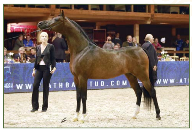
EQUATOR 4-5 Years Old Stallions