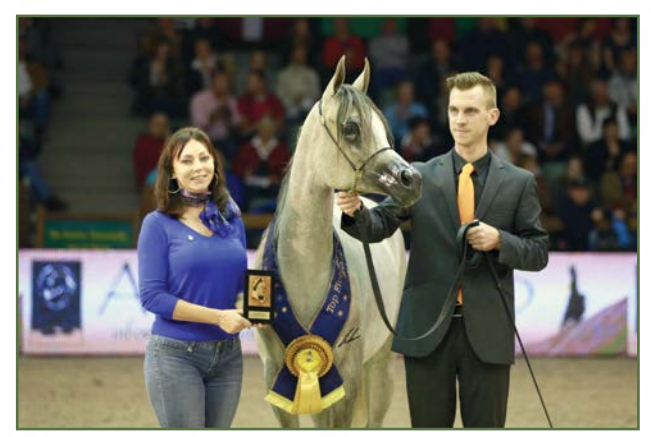
ORIA TURMA Yearling Fillies B