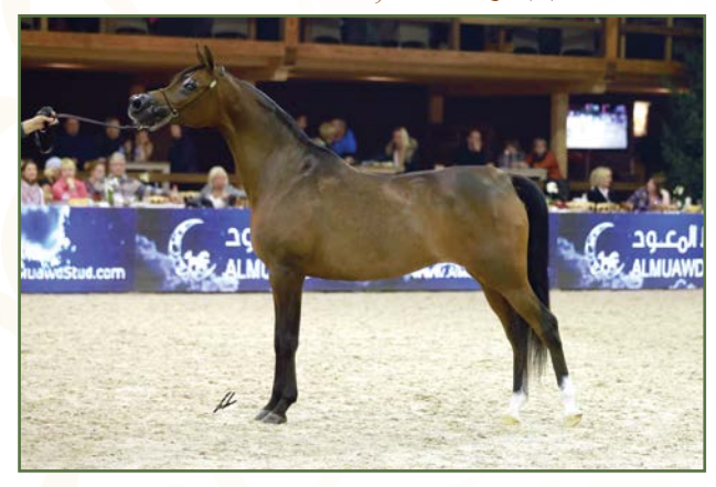
PRMIRA 4-5 Years Old Mares