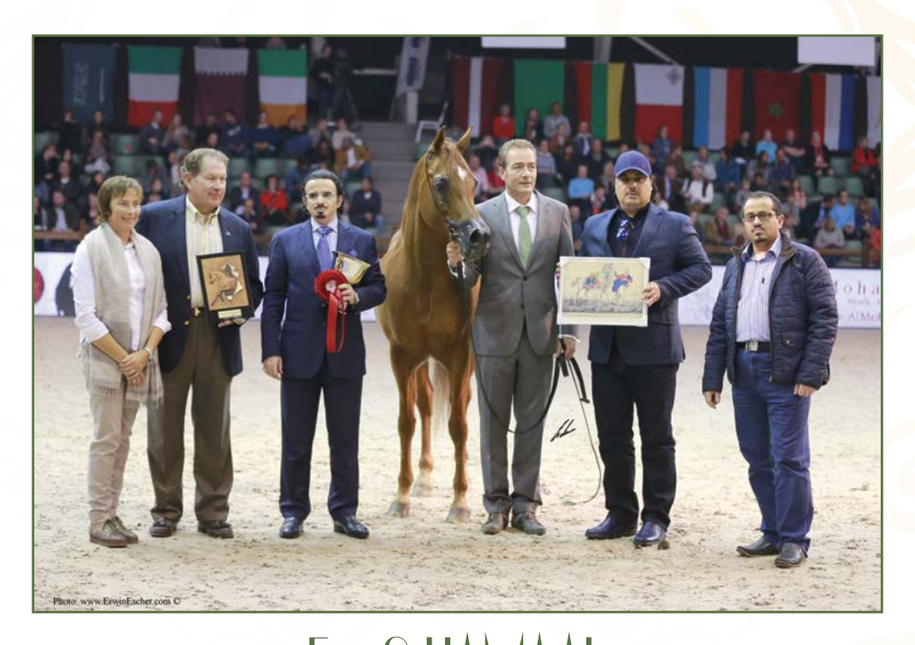
F SHAMAL Silver Medal Stallions (MAYSOUN x SARAMEENA) B: FAM. FRIEDMAN (DE) / O: AL KHALEDIAH STABLES (KSA)