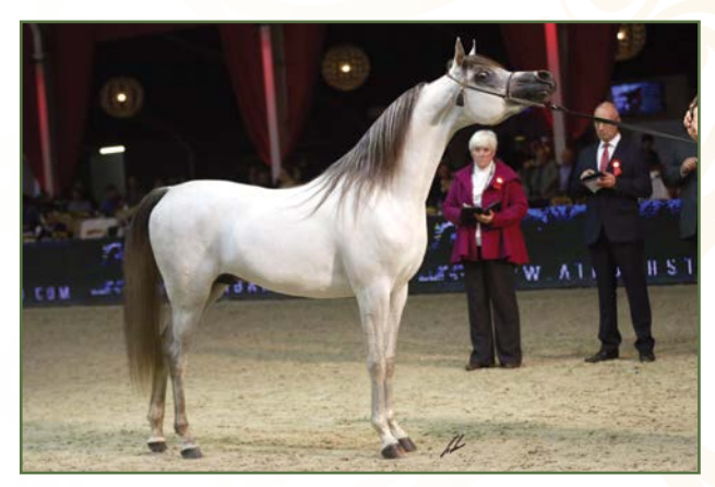
EQUBORN KA Two Years Old Colls