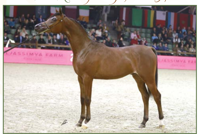
GALLARDO J Yearling Colls A