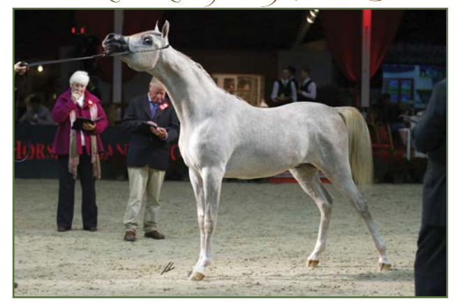
SHRAZ DE LAFON Yearling Colls B