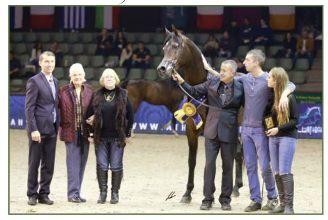
ROE LATES 6-7 Years Old Stallions