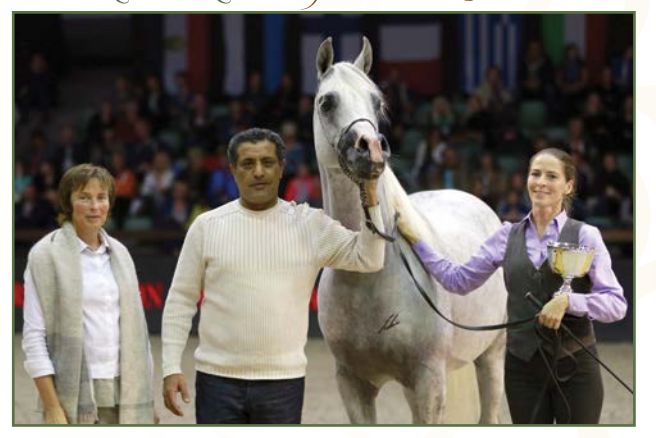
ALTIS 8-10 Years Old Stallions