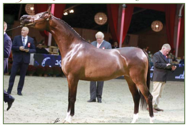
PIACOLLA Two Years Old Fillies A