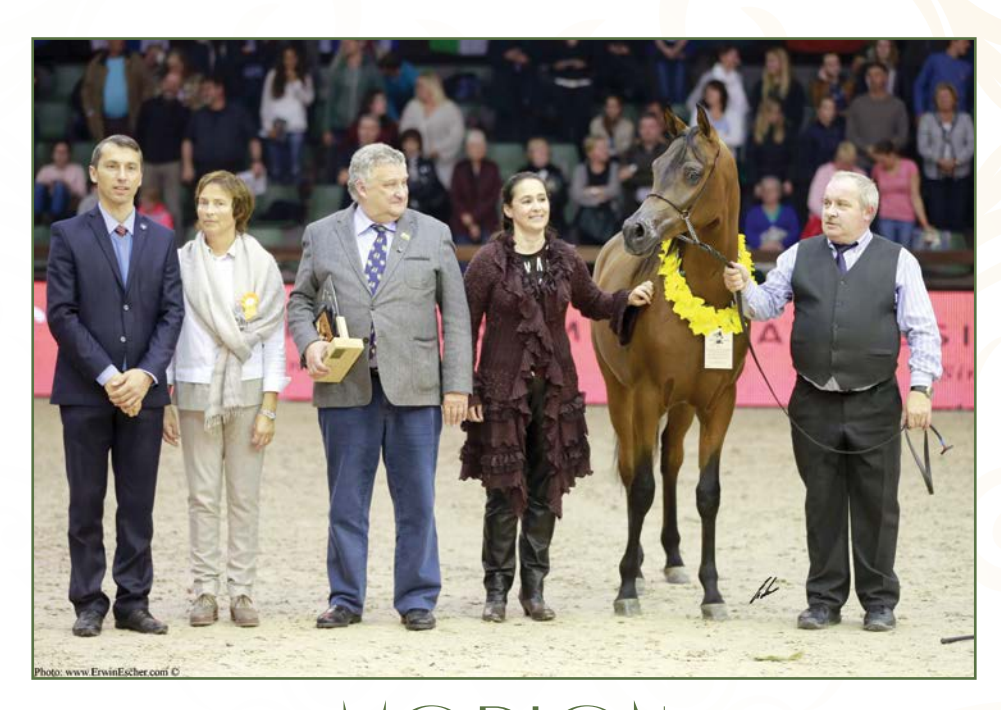
Silver Medal Gearling Colls (KAHIL AL SHAQAB x MESALINA) B/O: MICHALOW STUD (PL)