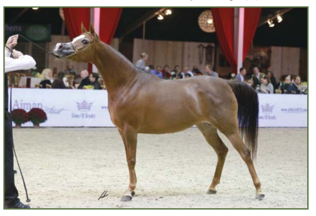
ALMA AL TIGLIO 6-7 Years Old Mares