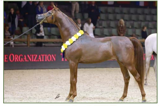
ASCOTT DD Three Years Old Colls