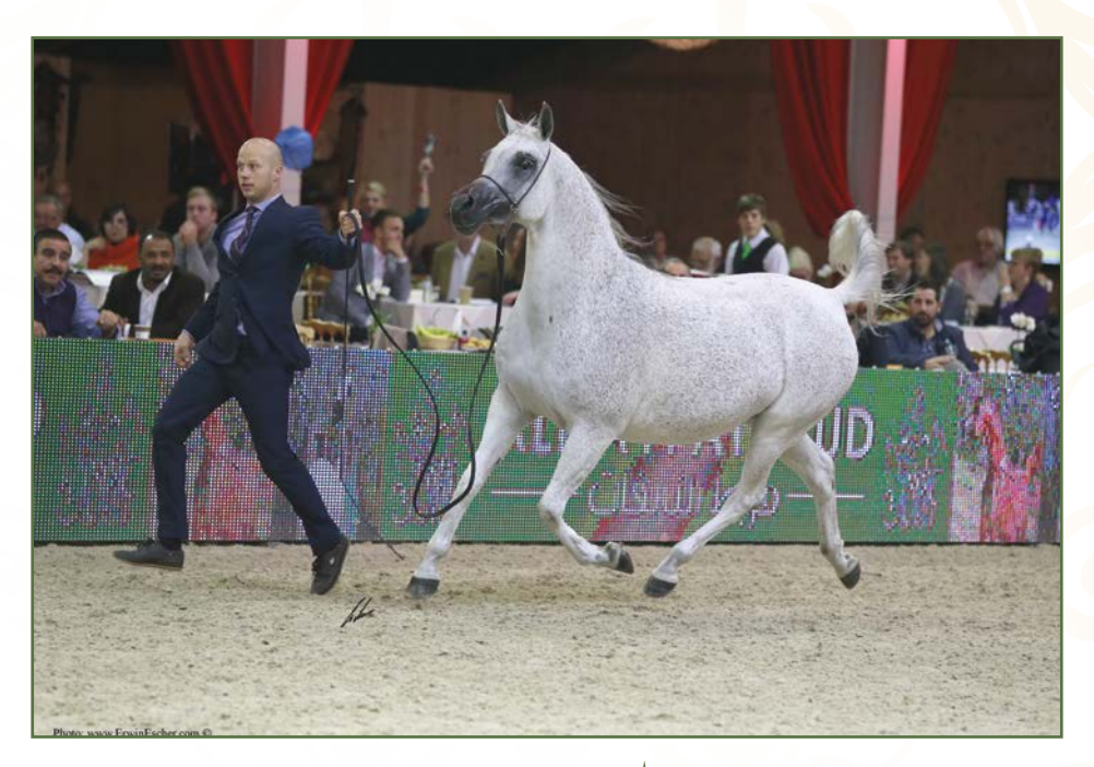
Silver Medal Mares (EKSTERN x PEPESZA) B/O: JANOW PODLASKI STUD (PL)