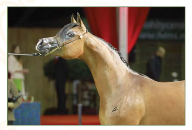
MOUNRA I Yearling Fillies A