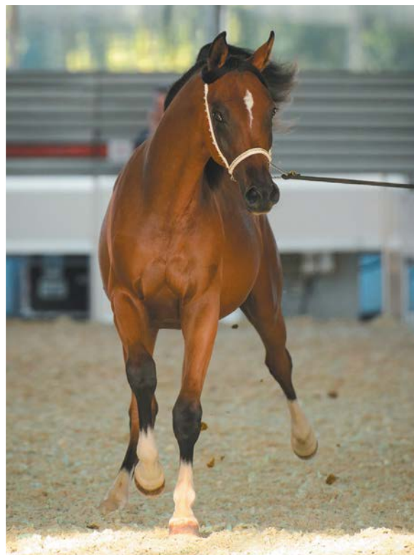
Ecstasy, Gold Champion Filly