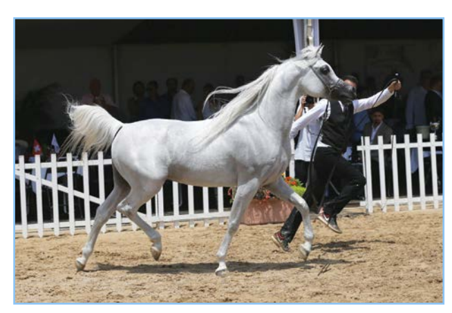
EL PALACIO VO

MARWAN AL SHAQAB x WHITE SILKK BREEDER/OWNER: AL SHAQAB STUD (QAT)