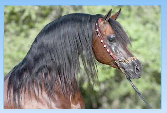
MARWAN AL SHAQAB Best Sire in the Show GAZAL AL SHAQAB x LITTLE LIZA FAME BREEDER/OWNER: AL SHAQAB STUD (QA)