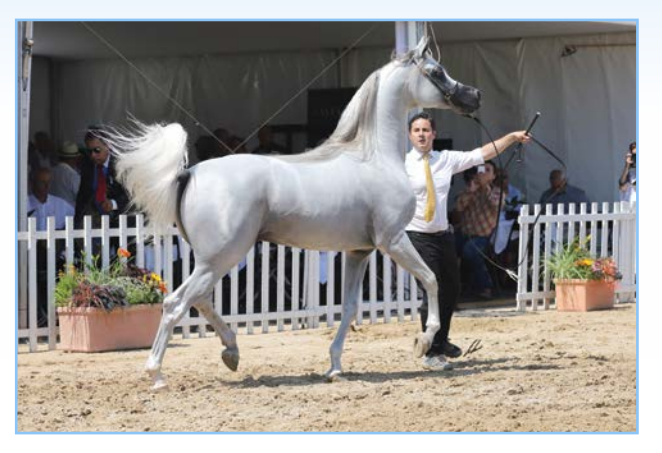
HARIRY AL SHAQAB