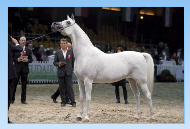
EL DORADA Best Dam in the Show sanadik el shaklan x emigrantka breeder: michałów stud (pl)