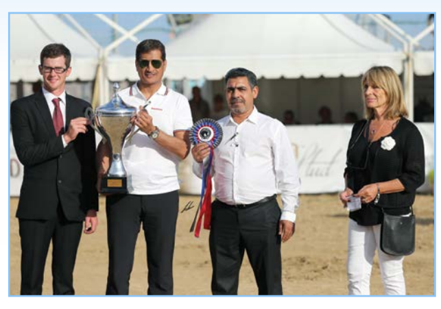
AL SHAQAB Best Breeder/Owner