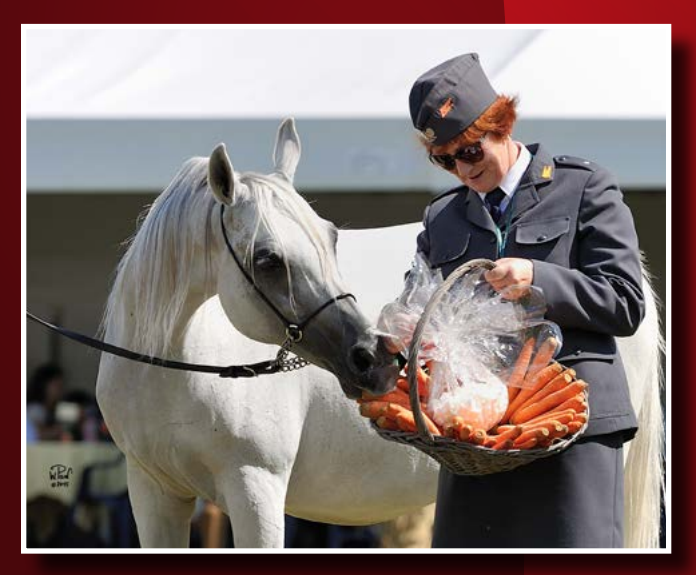
WAHO TROPHY WINNER Palmeta - Janów Podlaski Stud