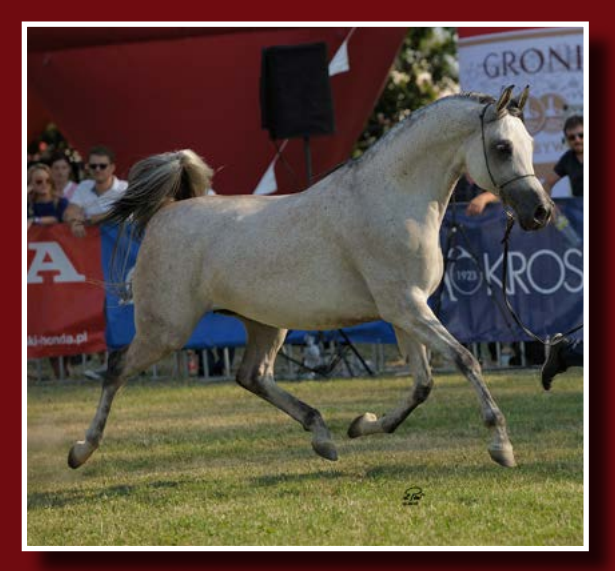
BEST MOVEMENT Lawinia - Michałów Stud