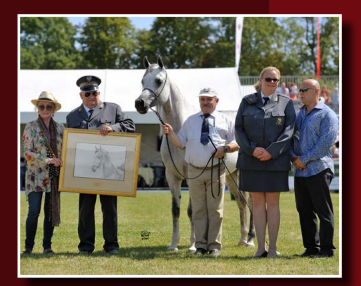
BEST HEAD Parmana - Michałów Stud