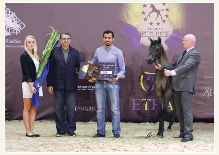
JAMAL AL DIN OVERALL TOP FIVE FOAL EKS ALIHANDRO x FALCONSONG BHF BREEDER/OWNER: AL MUAWD STUD (KSA)