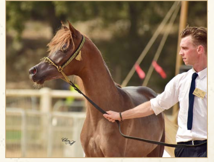
SILVER MEDAL - NADER AL SHAMAL AA (SALAA EL DINE X *INSHA SHA LATIFA) BRED AND OWNED BY ARIELA ARABIANS