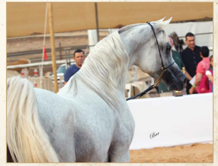
BRONZE MEDAL - SHADWAN IBN SETALA (*HT EL KHURAFA X *SETALA) BRED BY YAACOV MATALON AND OWNED BY ABD TAHA

SILVER MEDAL - WAHILDAAR BKV (LAHEEB X *BARAKIS WHISPER) BRED BY YUVAL KELLER HORSE CENTER AND OWNED BY SALAMAN BASHA