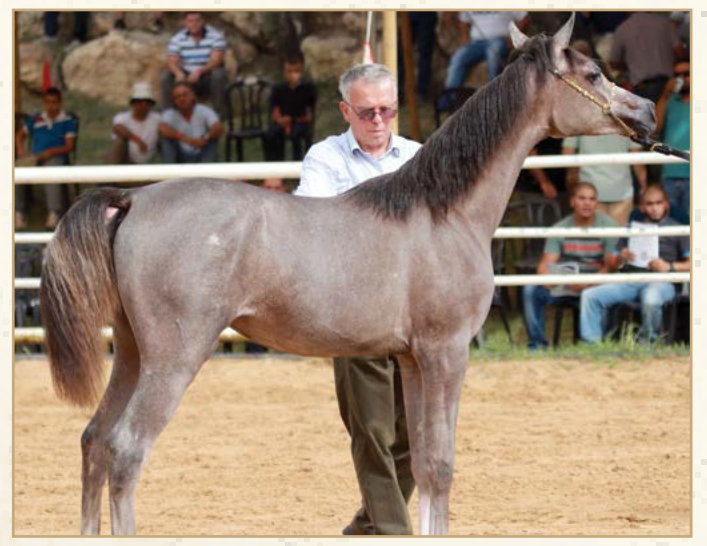
BRONZE MEDAL - AL MAASA MY (MOUADAAR BKV X JOHARA WWA) BRED AND OWNED BY AL MUWATEZ FARM