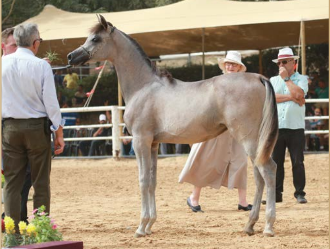
SILVER MEDAL - SHAHEEN AA (AL AYAL AA X *SANIYYAH RCA) BRED AND OWNED BY ARIELA ARABIANS