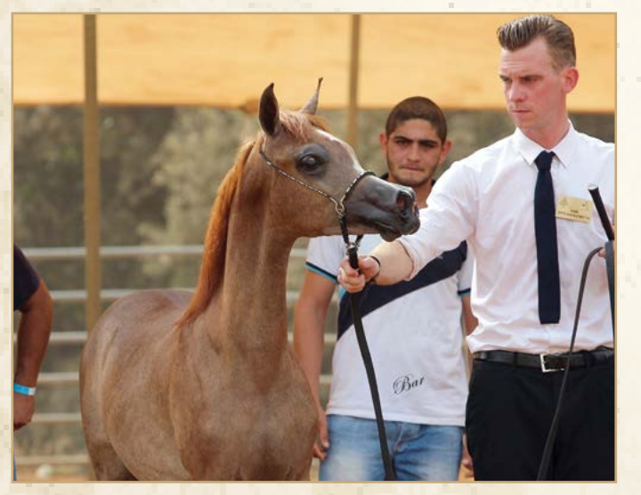
SILVER MEDAL - SORAYA AA (AL AYAL AA X SANIYYAH RCA) BRED BY ARIELA ARABIANS AND OWNED BY ARIELA ARABIANS AND ADL ALHEIB