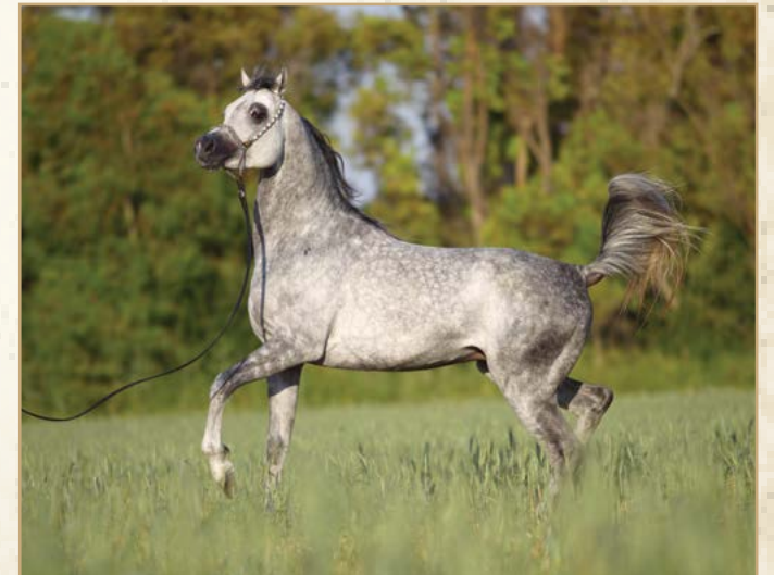
BRONZE MEDAL - SHAMS SHARAV AA (*SIMEON SHARAV X *SANIYYAH RCA) BRED AND OWNED BY ARIELA ARABIANS