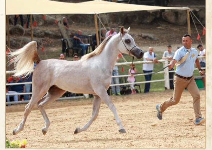
BRONZE MEDAL - FAED AL KHEL (AL AYAL AA X TAKIYAH AA) BRED AND OWNED BY NISHAT AND BARKAAT MANSOUR