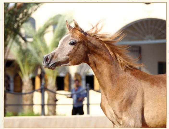
BRONZE MEDAL - TURKIZ AA (AL AYAL AA X *JPJ TALASHA) BRED BY ARIELA ARABIANS AND OWNED BY ARIELA ARABIANS AND WAHABI FALACH

SILVER MEDAL - LUBANA AL QASEM (AL AYAL AA X LOUBANA) BRED BY HIKHMAT TAHA AND OWNED BY HIKHMAT TAHA & RASHAD DAOUD