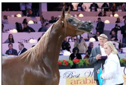
FILLIES B DELIGHT'S DIVAH RB