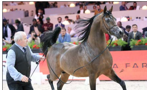
BEST MOVEMENT MALES EQUATOR

QR MARC | EKLIPTYKA - B/O: STADNINA KONI MICHAŁÓW (POL)