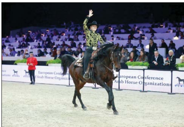
Muscateal's Saphir & Doris Pfann Gold Trail, Gold, Reining, Gold Western Pleasure