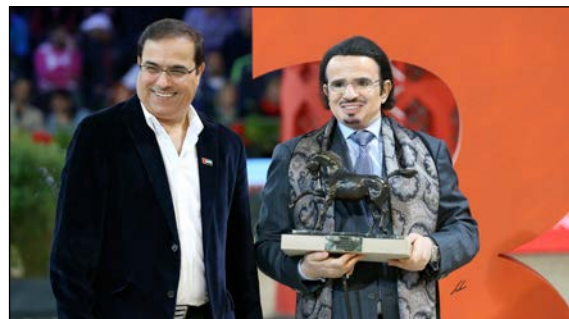
TROPHY FOR THE 35 th ANNIVERSARY AL KHALEDIAH STABLES

QR MARC | OSO AXOTICA - B/O: KNOCKE ARABIANS (BEL)