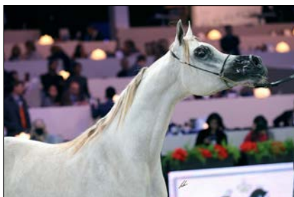
YEARLING FILLIES B MOZN ALBIDAYER