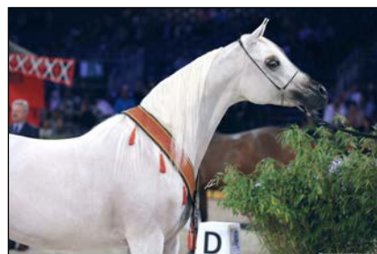
MARES B F.M. GLORIAA