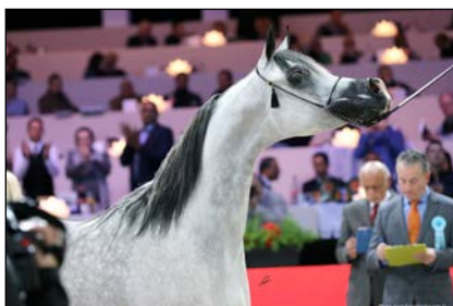
MARES A KLASSICAL DREAM ML