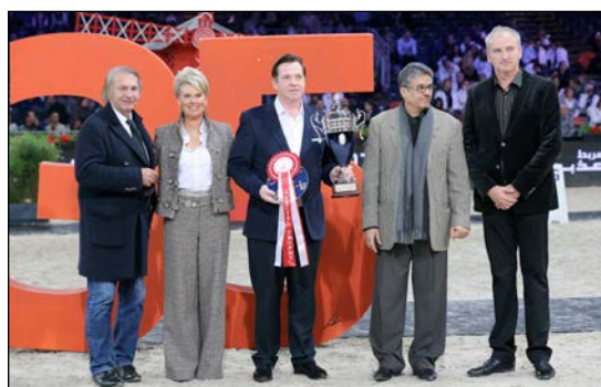
BEST SIRE IN THE SHOW QR MARC (KNOCKE ARABIANS)