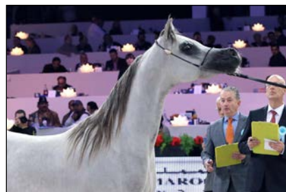
FILLIES A OMEL AISHA ALJASSIMYA