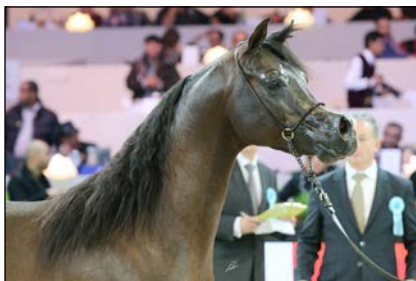
STALLIONS A VAN GOGH AM