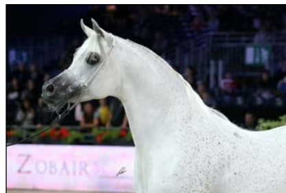
STALLIONS B AJA JUSTIFIED