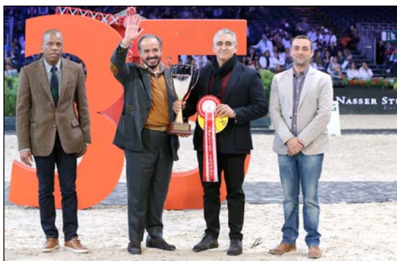
FIRST WORLD BEST DAM TROPHY WINNER ESKLAWA (ALZOB AIR STUD)

QR MARC | EKLIPTYKA - B/O: STADNINA KONI MICHAŁÓW (POL)