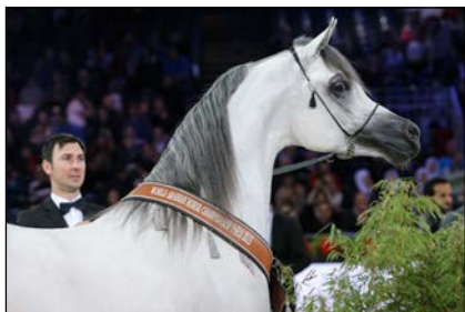
COLTS B EQUIBRON K.A.