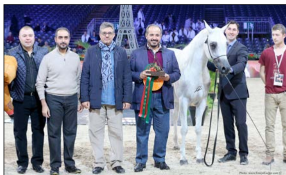
BEST MARE IN THE SHOW SALWA AL ZOB AIR (ALZOB AIR STUD)

FA EL SHAWAN | WA PRISCILLA B: ABDUL AZIZ BIN IBRAHIM AL BARGASH (KSA) O: AL SAYED STUD (KSA)