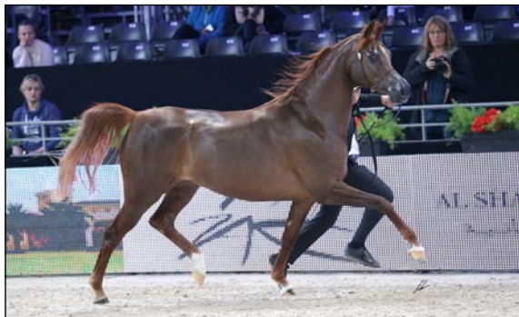
BEST MOVEMENT FEMALES ORFA D'ARAB K.A.

QR MARC | OSO AXOTICA - B/O: KNOCKE ARABIANS (BEL)