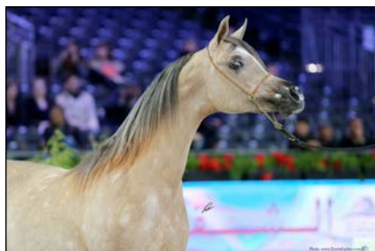
YEARLING COLTS A AJ AZZAM