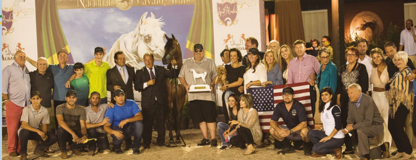
Gold National Champion Young Colt, Razeer Serondela from Storm Skye Arabians