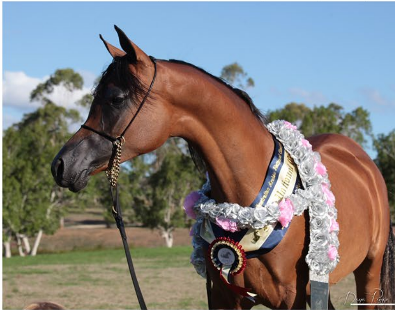
Silver Australian Champion Yearling Filly - Sia KA - Krishlah Arabians & Future Farms