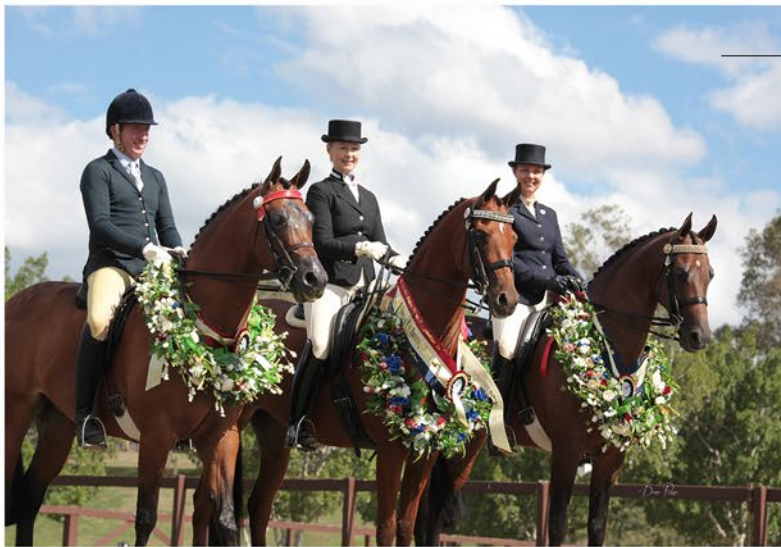
Ridden Arabian Gelding class -