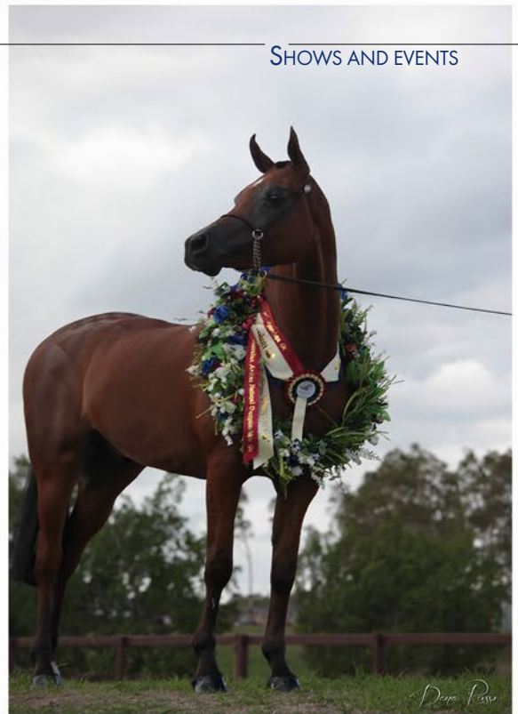
Purebred Arabian Senior Gelding - GOLD CHAMPION - Georgio KA - Krishlah Arabians & Future Farms