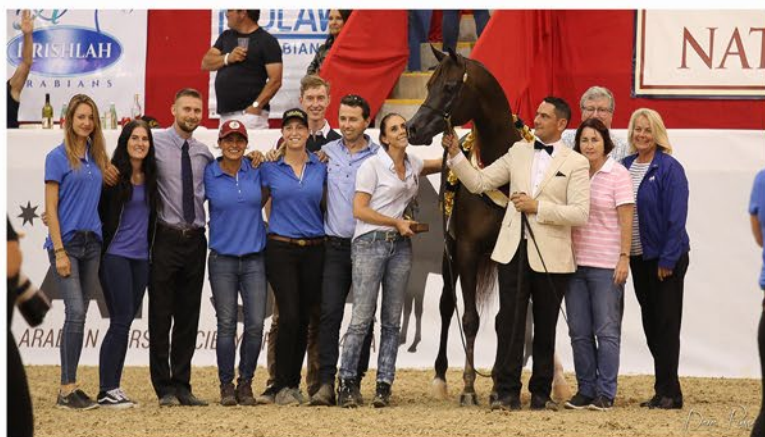
Purebred Arabian Senior Stallion - GOLD CHAMPION - Konquest MI - Mulawa Arabian Stud Pty Ltd

AUSTRALIAN ARABIAN NATIONAL CHAMPIONSHIPS