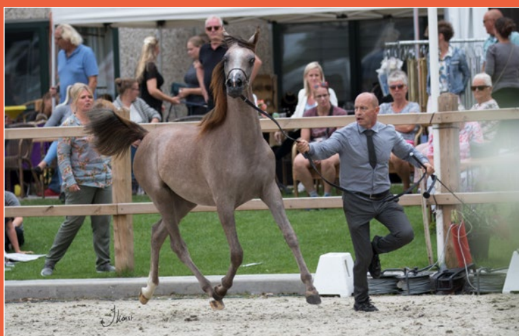
SILVER MEDAL CHAMPION B.A. FIORELLA EL PALACIO VO | FLORESSAH W B/O: BEMBOM ARABIANS