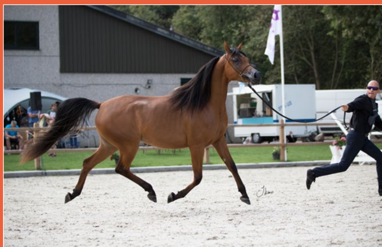
BRONZE MEDAL CHAMPION HABIB'S ROBINA BYSTIVAL KOSSACK | GB HABIB B: B. MOREES - O: F.F. MOREES