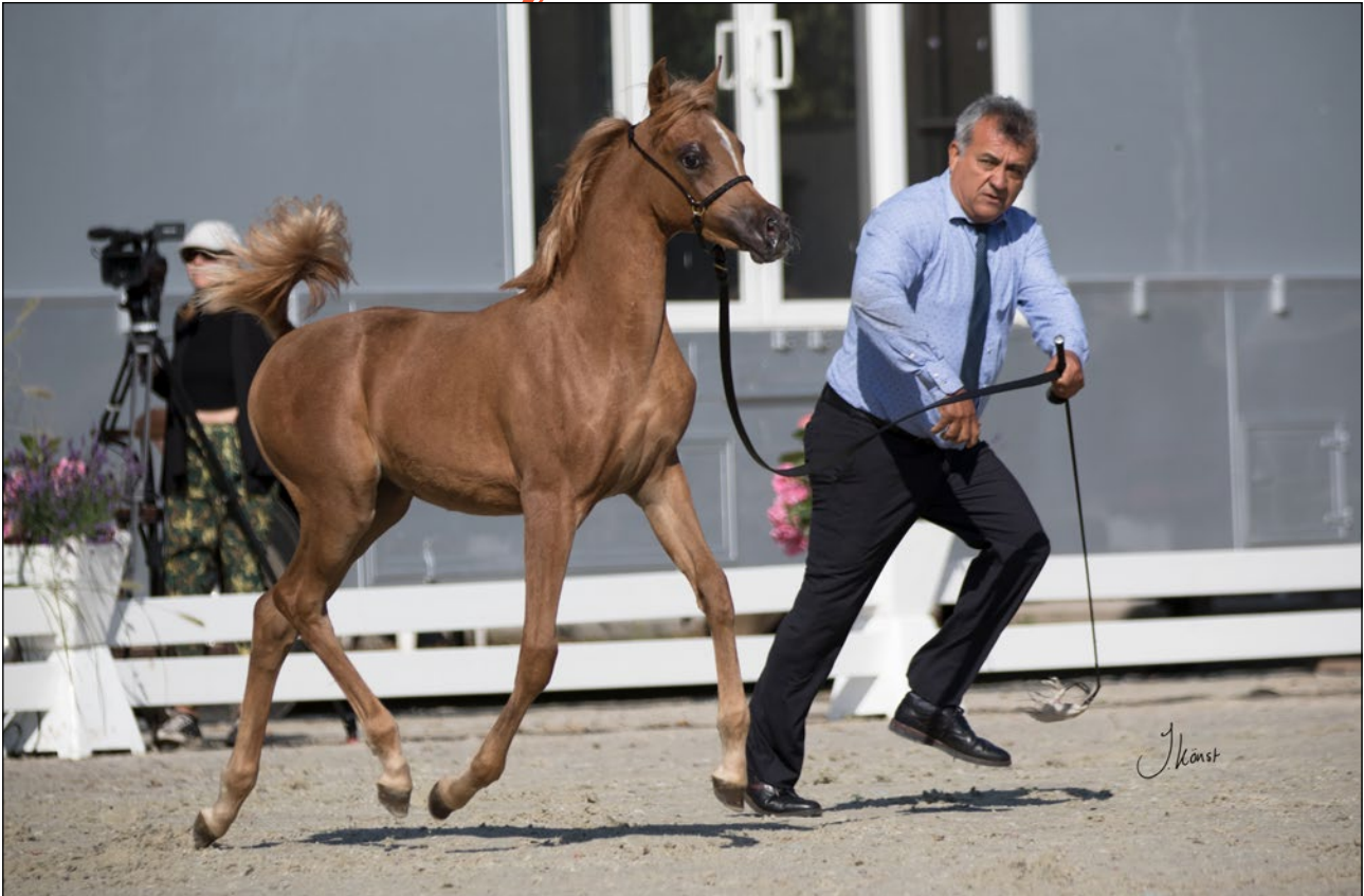
GOLD MEDAL CHAMPION - B.A. NAILAH MAGIC ABAN | MAGIC NADIMA - B: FONTANELLA MAGIC ARABIANS - O: BEMBOM ARABIANS