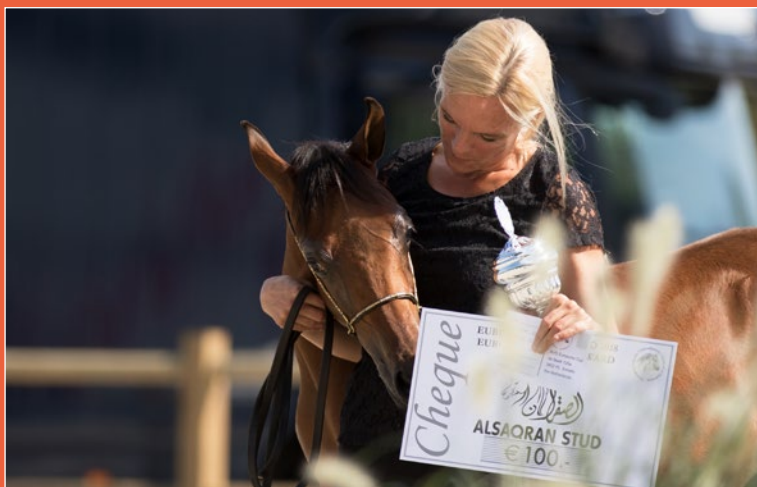
SILVER MEDAL CHAMPION F&M LAST PRINCESS OF KARMA FORELOCK'S SHAHEEN | YA KARMA B/O: F&M ARABIANS