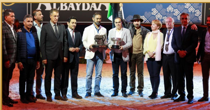
BREEDERS TROPHIES UAE