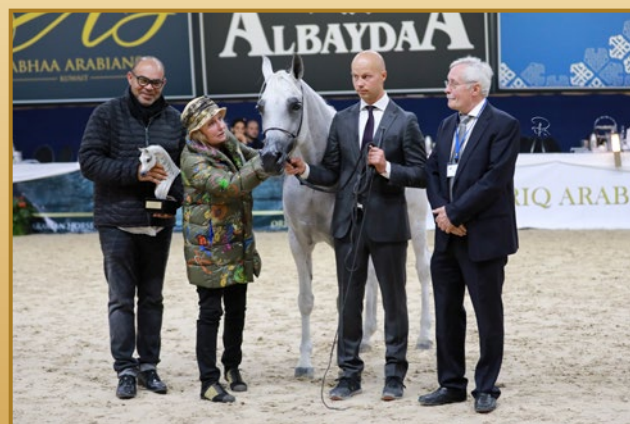
ETNOLOGIA | HIGHEST POINTS FEMALE

B: SHEIKH ABDULLA BIN MAJID ALOASSEMI - O: AL SAQRAN STUD