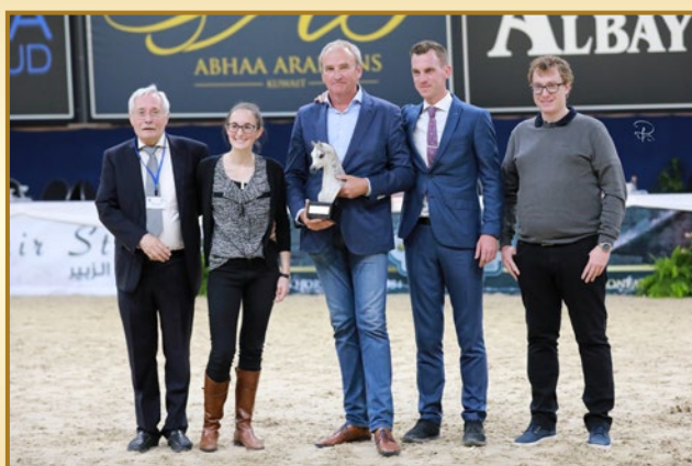
EQUIBRON KA | BEST EUROPEAN HORSE