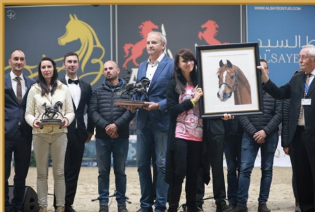
PADRON PSYCHE | LIFETIME AWARD