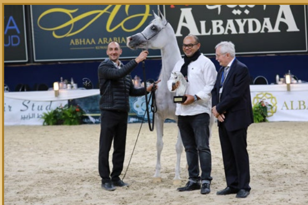
ALMA GB | BEST STRAIGHT EGYPTIAN