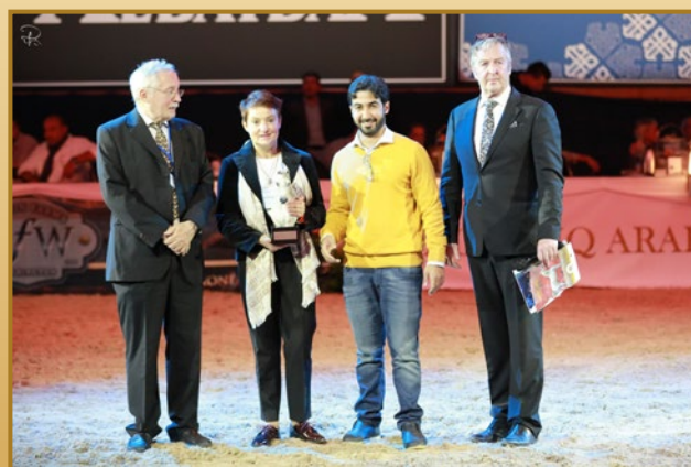
WILDONA | ANC FESTIVAL FUTURE AWARD