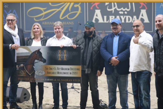
EL REY MAGNUM | BREEDING LOTTERY