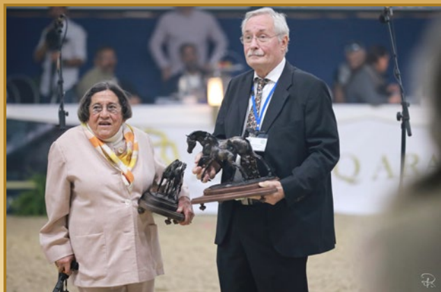
URSULA RAHM LIFETIME ACHIEVEMENT AWARD