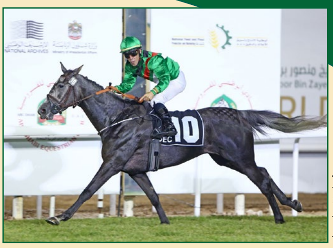
Al Shamoos winning Jewel Crown