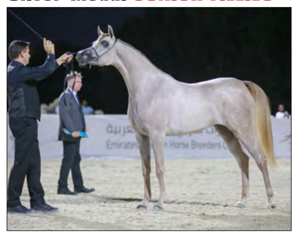
AJ FALAK AJ AZZAM X FELICIA RLC B/O: AJMAN STUD