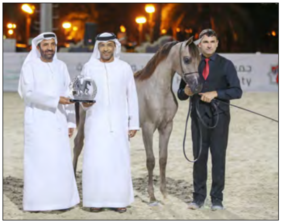
AJ AL BRRAQAH 5

FA EL RASHEEM X FELICIA RLC B/O: AJMAN STUD