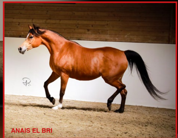
ANAIS EL BRI