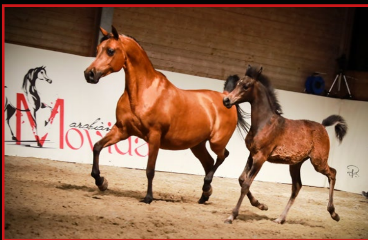
BATISTAH & BALKIS EL AYAL