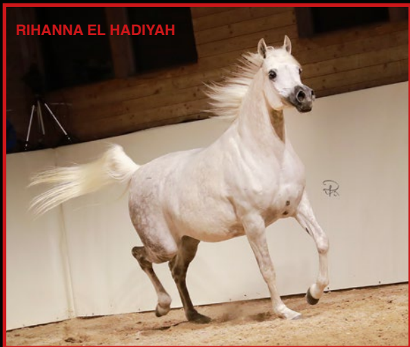
RIHANNA EL HADIYAH