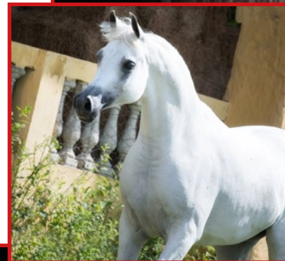
JYVARA EL MAKTUB