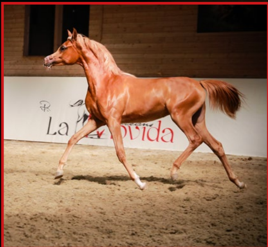
BINTA EL JYAR