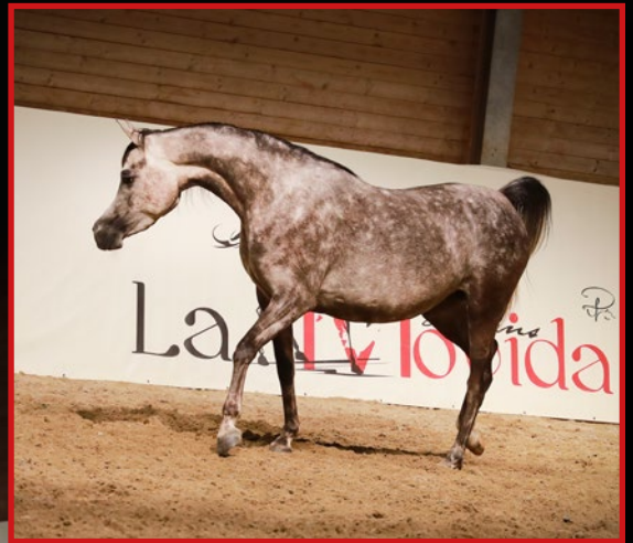
BASILEA EL JUSTICE