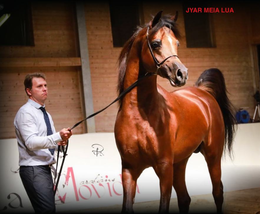
JYAR MEIA LUA