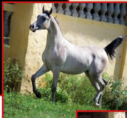
EIFFEL MEIA LUA