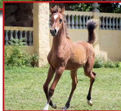
ERYKAH MEIA LUA

The particularity in our relationship has been perhaps the fact, that even we both used similar bloodlines, - we had always different priorities in our horses and so we created different styles of horses coming from similar lines.