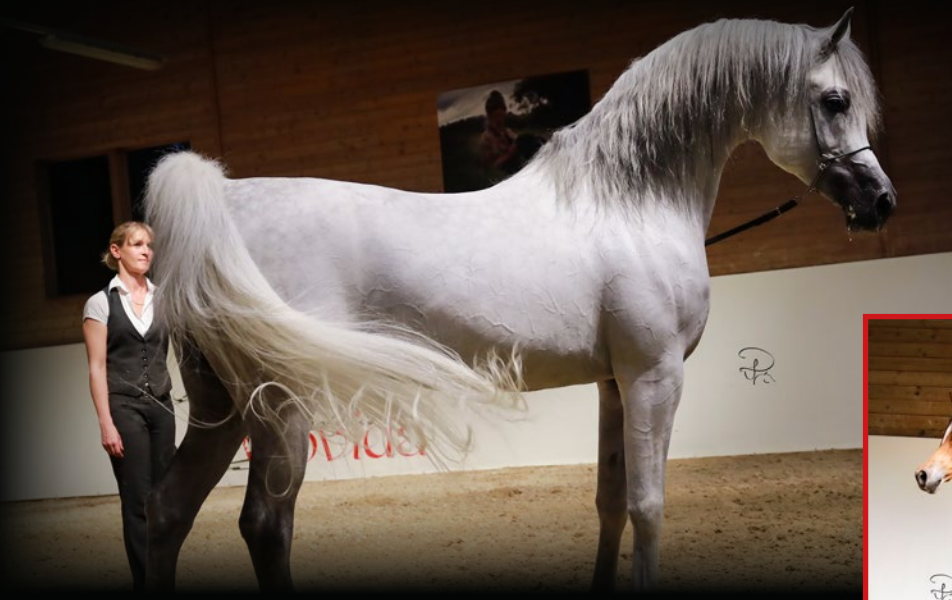
LAWRENCE EL GAZAL