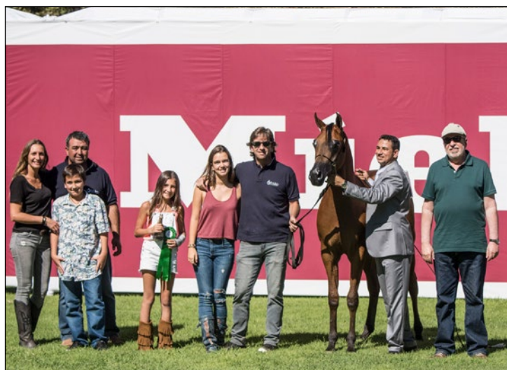
Silver Medal Junior Fillies Llancay Zamara from Haras Lancay