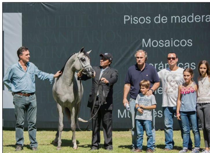
Bronze Medal Colts HP Hariry from Haras Panquehue