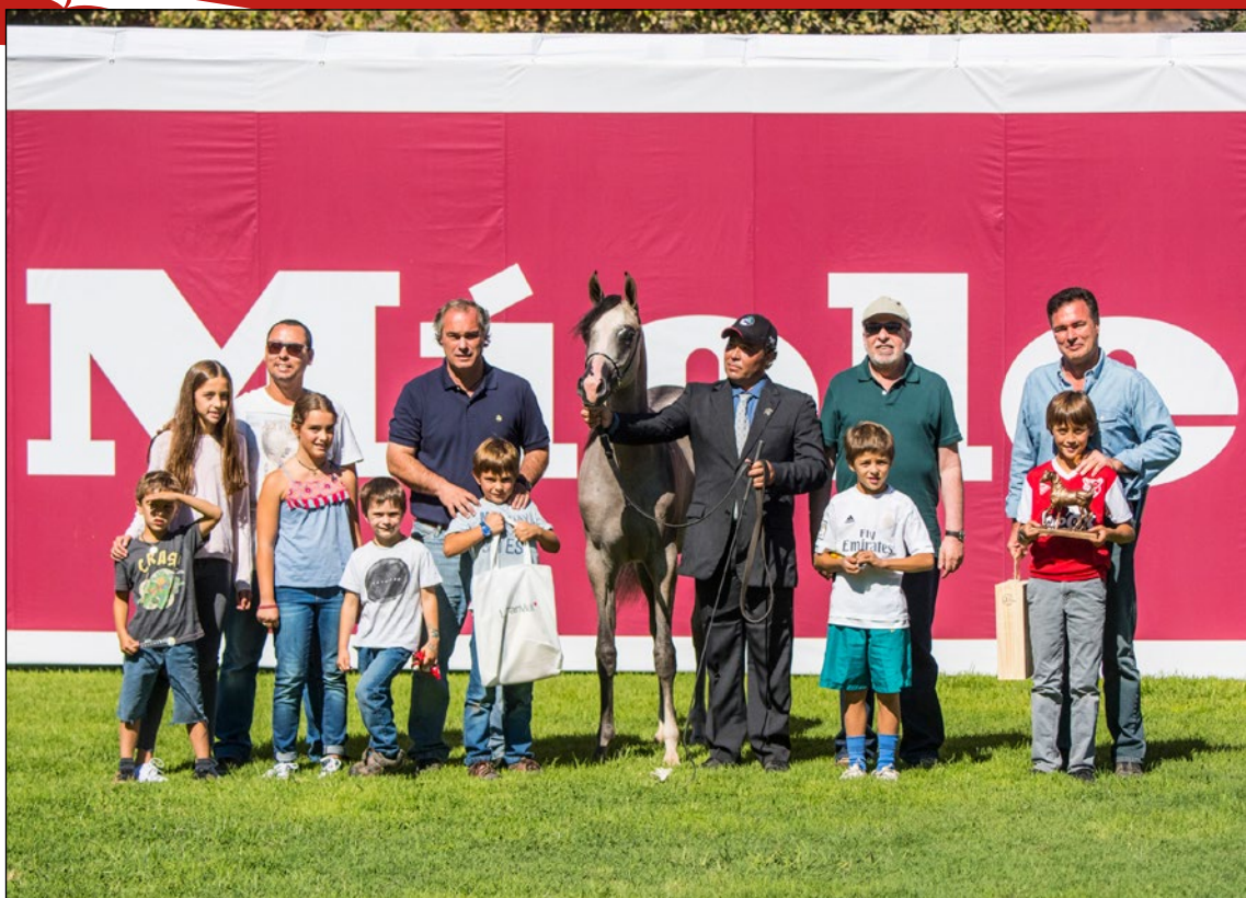
Gold Medal Junior Fillies - HP Almudena from Haras Panquehue