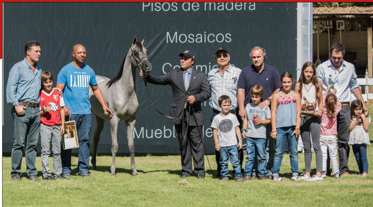
Gold Medal Junior Colts - HP Balduino from Haras Panquehue