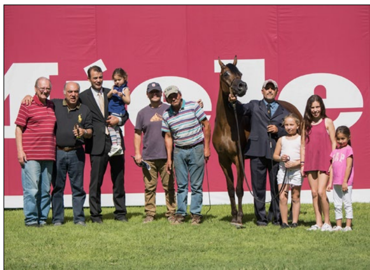
Silver Medal Fillies HSM Simona from Haras Santa Marta