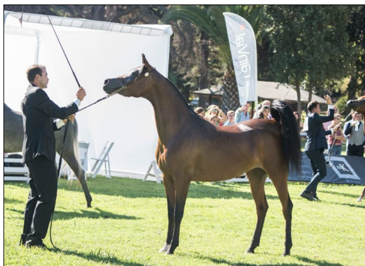
Silver Medal Young Mares El Palenque Colomba from Haras El Palenque, Panquehue and Águas Claras