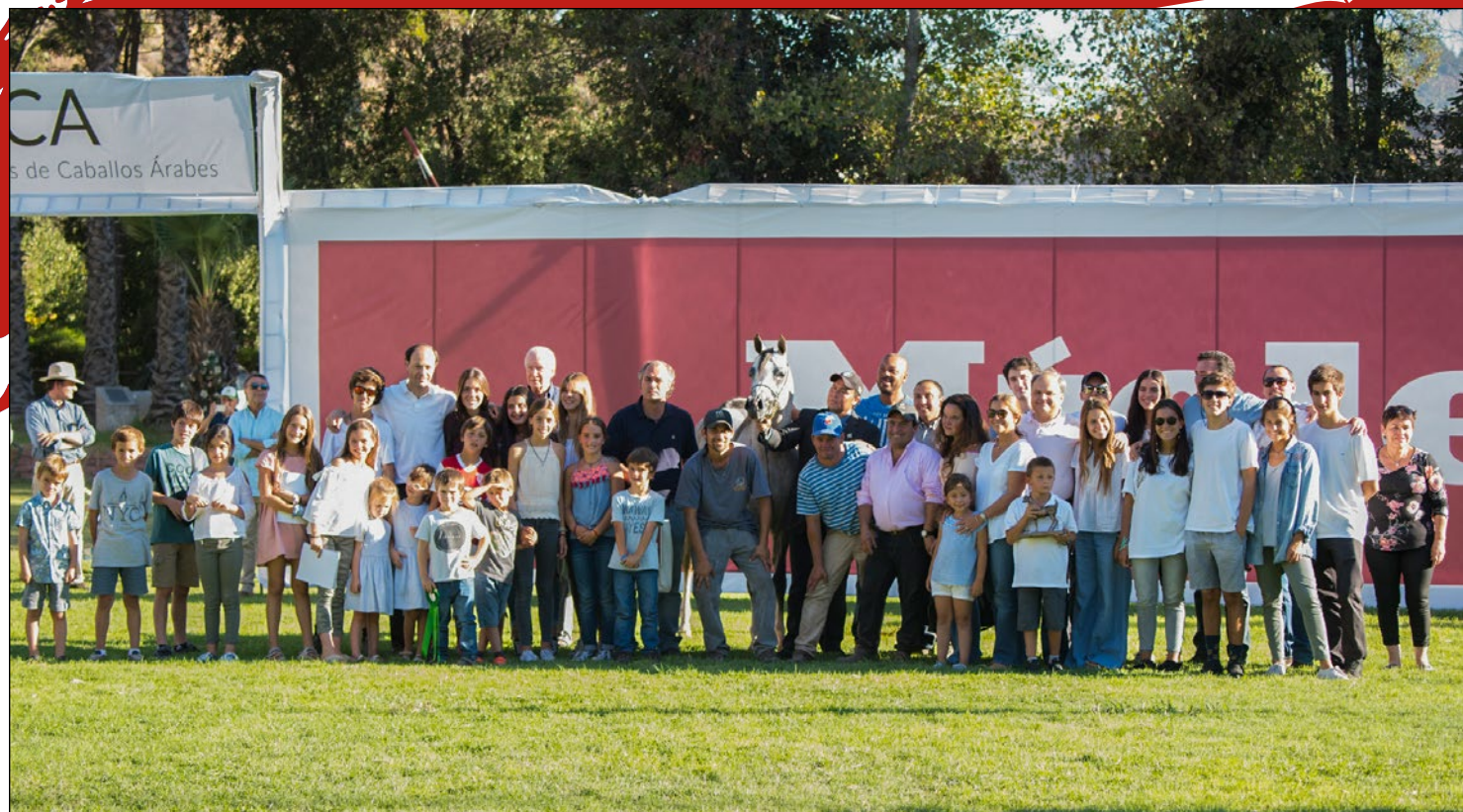
Gold Medal Stallions - HP Alí from Haras Panquehue and Aguas Claras