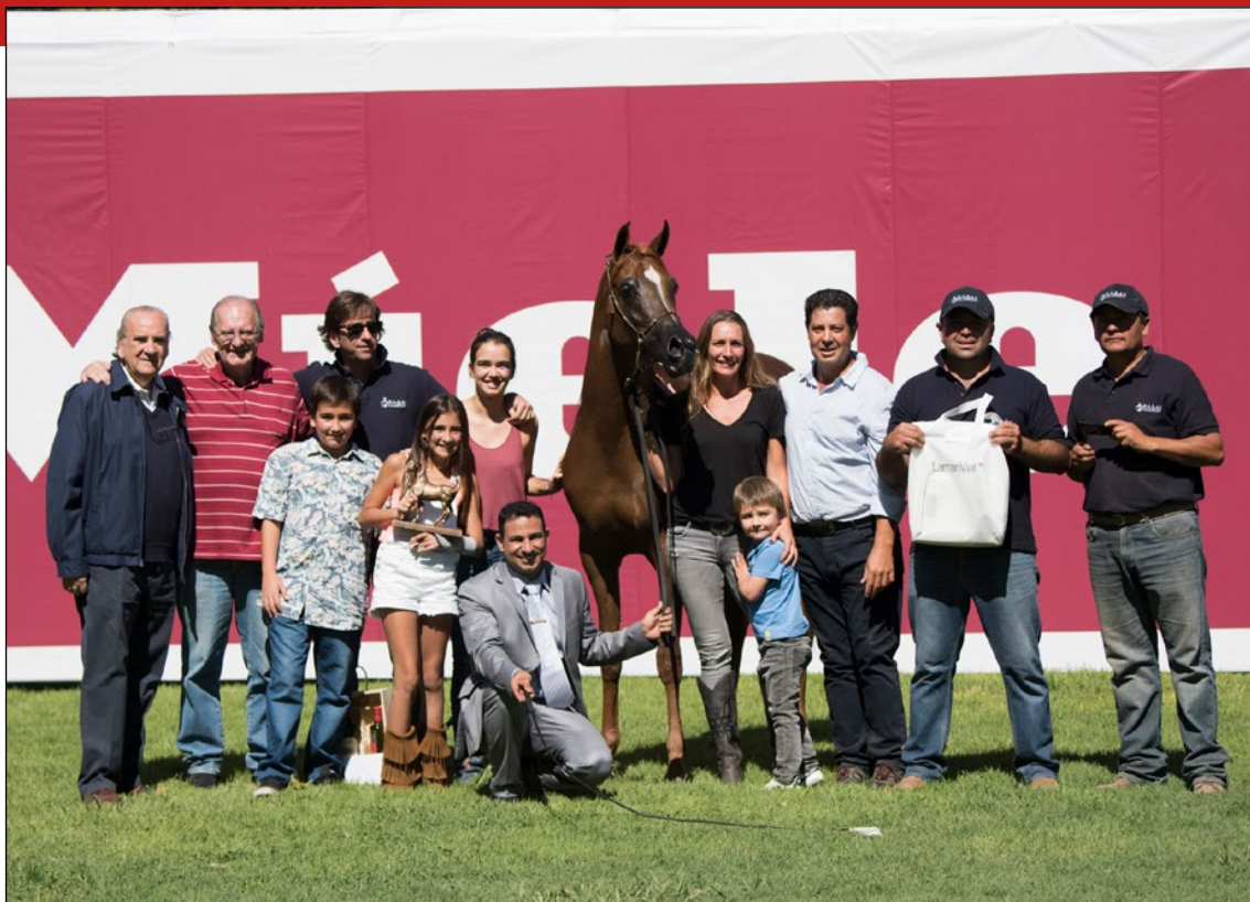
Gold Medal Fillies - Llancay Jade from Haras Llancay