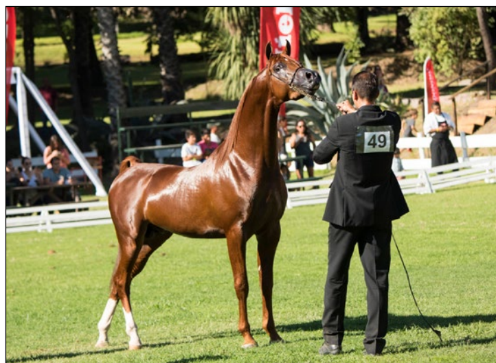
Bronze Medal Young Stallions HSM Señor Victor from Haras Santa Marta