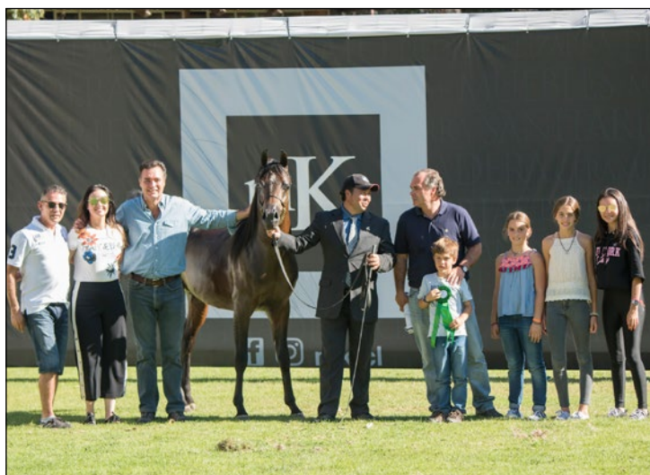
Silver Medal Young Stallions HP Mabrouk from Haras Panquehue