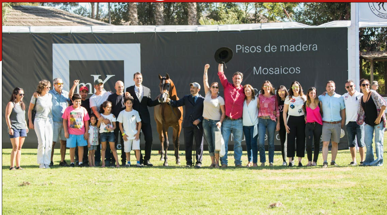
Gold Medal Young Stallions - AltovalsolJagger from Haras Altovasol