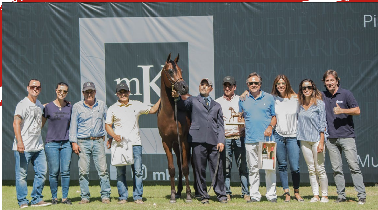
Gold Medal Colts - HHC Ballantine from Hacienda Chada