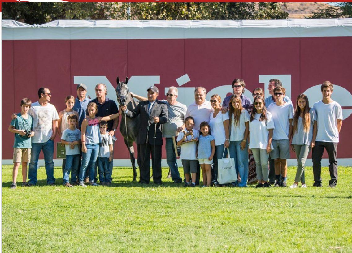
Gold Medal Young Mares - Gloriosa El Power from Haras Panquehue and Aguas Claras