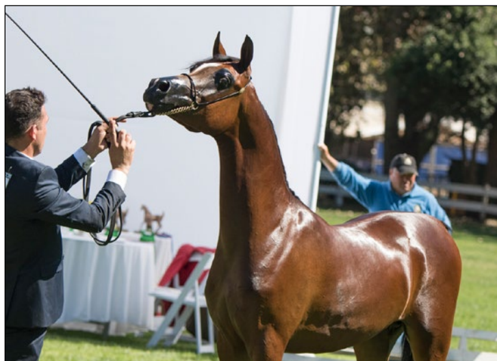
Silver Medal Colts TMK Camel Sha from Haras Temaiken