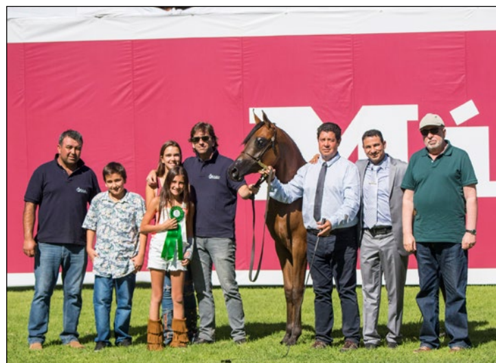
Bronze Medal Junior Fillies Llancay Josefa from Haras Lancay