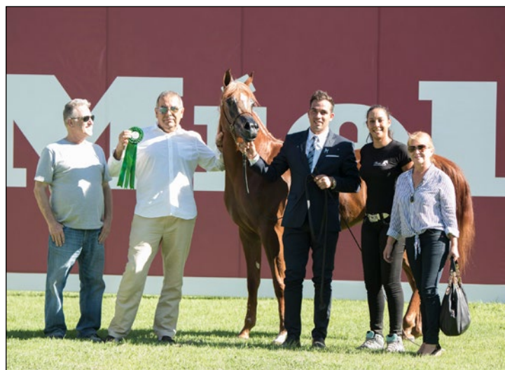
Bronze Medal Young Mares HS Shazadi do Haras Shangrila