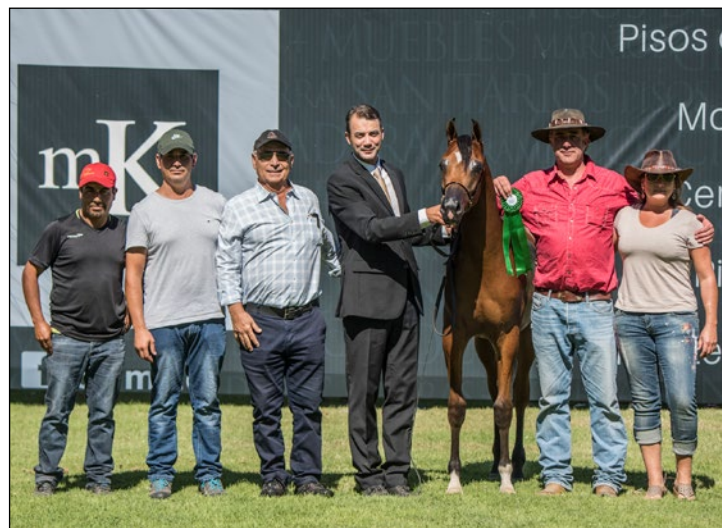
Bronze Medal Junior Colts Altovasol Hendrix from Haras Altovasol