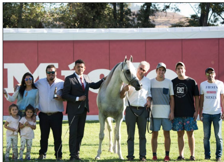
Silver Medal Stallions HSA Maktub from Haras Puquelahue