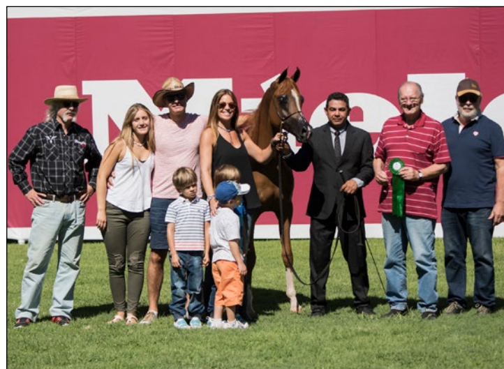
Bronze Medal Fillies HSA Almendra from Haras Santa Ana