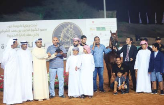
Under the patronage of His Highness Sheikh Mohammed Bin Hamad Al Sharqi Crown Prince of Fujairah