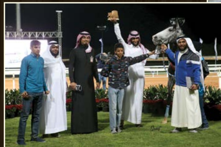
BATAL AL REEM