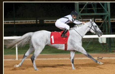
TALLAAB AL KHALEDIAH