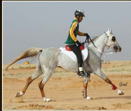
SOUTH SKY NEW YORK