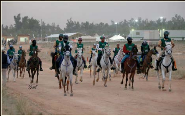
THE START AT 6.30 AM BEFORE THE SUN WAS UP