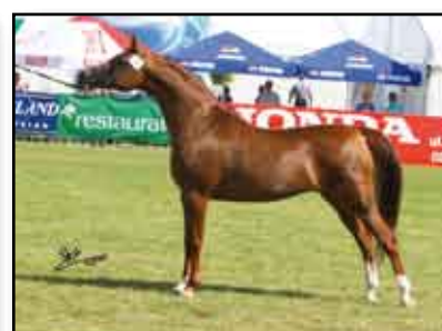
Lot 3 - Fallada