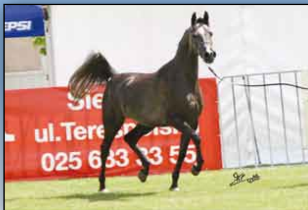
CHAOSPERSEFONA 2. Pl. fillies 2yrs old (class 2A) (Poganin – Ceres/Ganges) Chrcynno-Palace