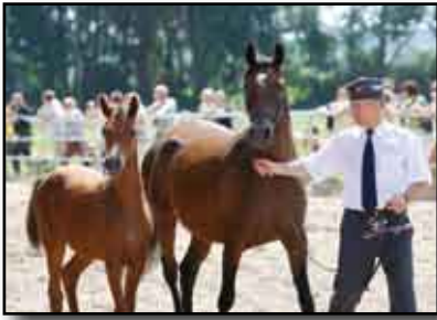
Watra & Filly by Ganges