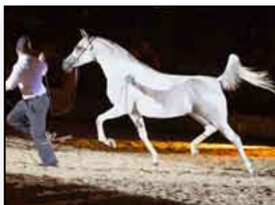
Lot 12 - Felicjana