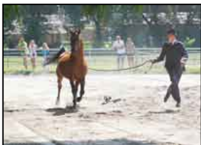
Aslan - Stallion