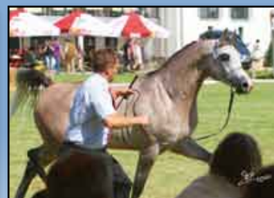
Lot B - Panicz