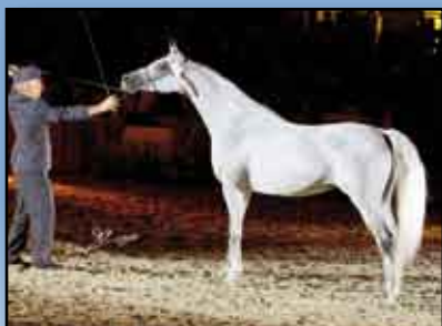
Lot 17 - Samura