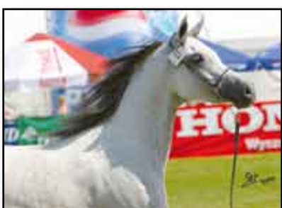
Lot 23 - Pogoda