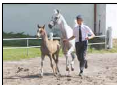
Anilla & Filly by Porto