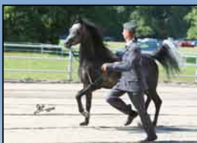
Polon - Stallion