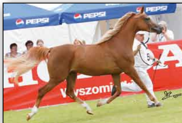
ESPINILLA 2. Pl. fillies 2 yrs old (class 2B) (Al Maraam – Espadrilla/Monogramm) Michałów