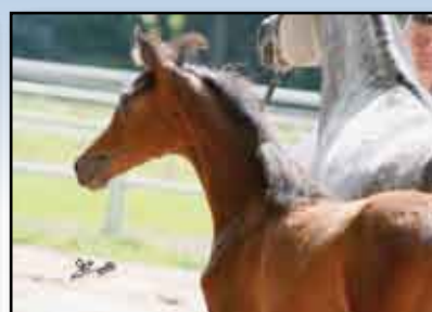
Alhambra - Filly by Ganges