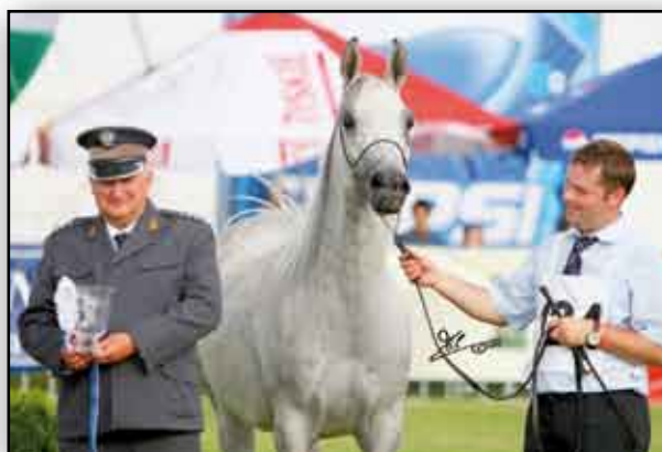
WIEŻA BABEL 2. Pl. mares 7-10 yrs old (Laheeb – Wiażma/Arbil) Michałów

The next two senior classes were a unique parade of the best of Polish breeding. In the 7–10 year old mares' class the best turned out to be the invaluable Janów-bred Palmeta ( Ecabo – Pilica/Fawor ), who bested Michałów's Laheeb (IL) daughters – Wieża Babel (out of Wiażma/Arbil ) and Emesa (out of Etopka/Eukaliptus ). The last class belonged to Michałów Stud, as the first four spots were taken by daughters of Monogramm (US). Evaluated highest was the 15 year old Georgia (out of Gizela/Probat (SE)). With just a slightly lower score second placed Emmona (out of Emilda/Pamir ) – an exquisite mare, Polish National Junior Champion Mare and World Junior Champion Mare, World Top Ten Senior Mare, who has for years been unlucky in breaking through in the Polish Nationals. She is not the only one who has a tough task ahead of her – this time she beat last year's Polish National Reserve Champion Mare Espadrilla (out of Emanacja/Eukaliptus ) and Scottsdale Reserve Champion Mare Egzonerka (out of Egzotyka/Probat (SE)).