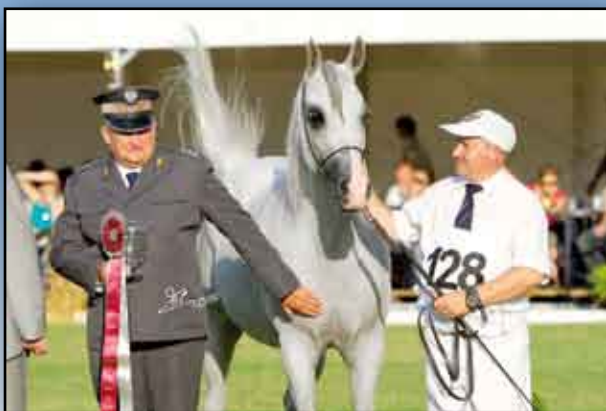
EMMONA 2 Pl. mares 11 yrs & above (Monogramm – Emilda/Pamir) Michałów