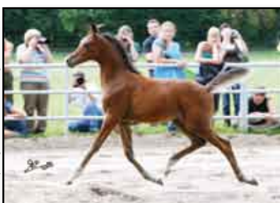
Pelta - Colt by QR Marc