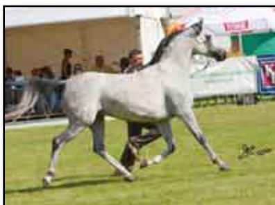
Lot 11 - Wizga