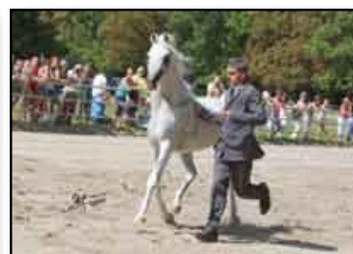
Ararat - Stallion