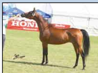
Lot 9 - Elimeja