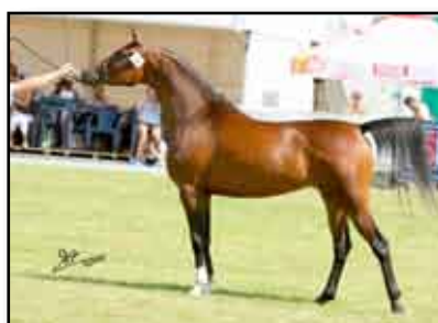
Lot 29 - Estaka