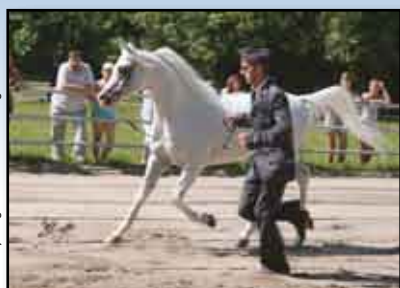
Salar - Stallion