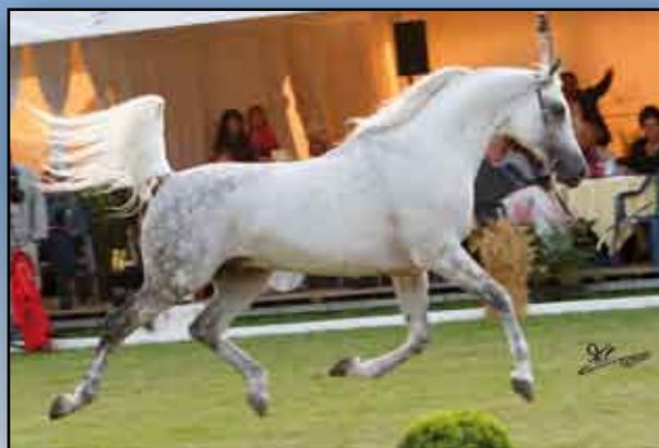
OSTRAGON 2. Pl. stallions 9 yrs old & above (Pers – Osełka/Palas) Białka