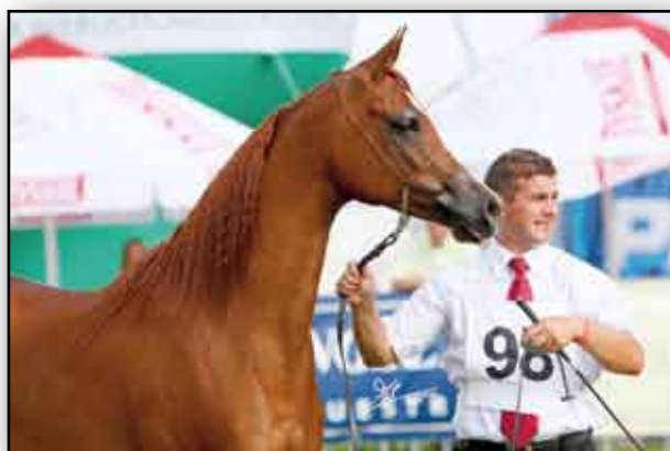
VALERIANA 2. Pl. mares 4-6 yrs old (Werter – Vahta/Aspect) Agricola Farm