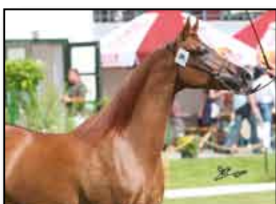
Lot 30 - Nike