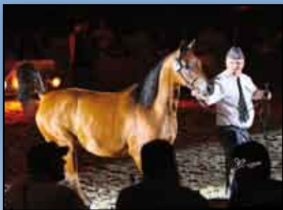
Lot 13 - Euspiria