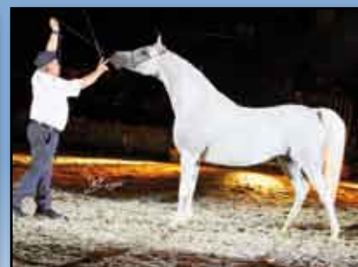
Lot 15 - Droga Mileczna