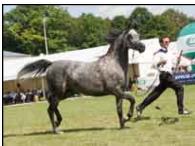
Lot 10 - Pinta