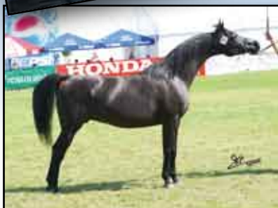
Lot 7 - Bellanda