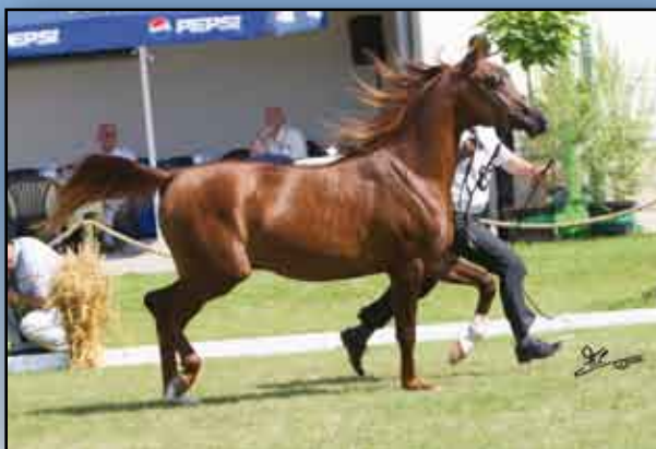
EMBELLON 2. Pl. colts 2 yrs old (Poganin – Embella/Monogramm) Michałów