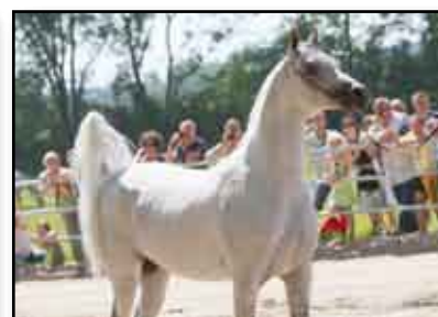
Pegasus - Stallion