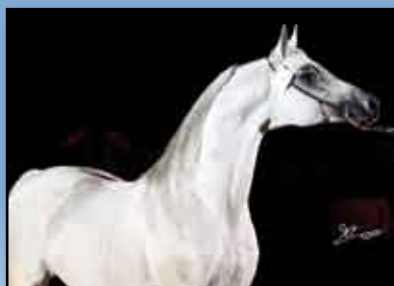
Lot A - Alvaro