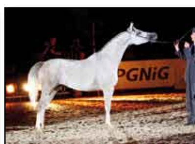
Lot 28 - Fabira