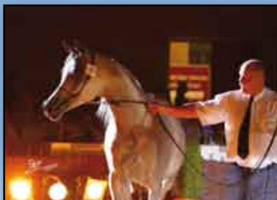
Lot 33 - Poksa