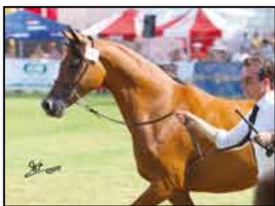
Lot 4 - Pre-ria