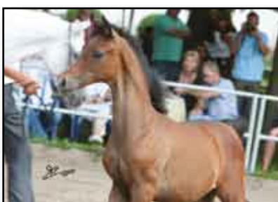
Andaluzja - Colt by Ganges