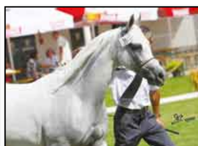
Lot 31 - Tonacja