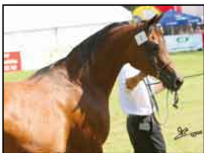
Lot 1 - Pelota

The attention of the public then swiveled to the next mare – the extremely feminine daughter of Pipi – Janów's Pre-ria. The mare quickly achieved a price of 230 thousand