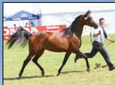
Lot 18 - Filistia