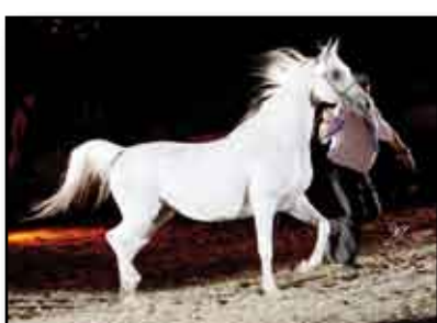
Lot 27 - Nina