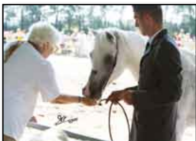
Balon, 30 years old

The visits in the State Studs deliver unforgettable emotions. It is worthwhile to participate in the Post-Sale Tour, but most of all to come and see the Polish National Show and famous auction in person. Let's meet in Janów Podlaski next year also!