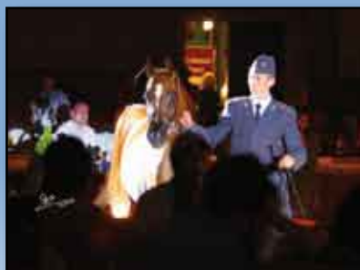
Lot 14 - Faseta