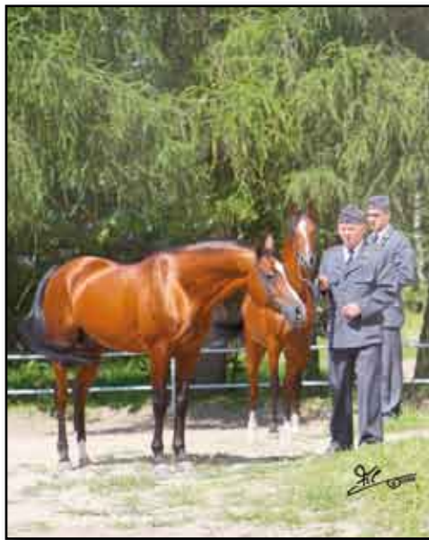
The front horse is the stallion ALBUM and in the back, the stallion ALBUS