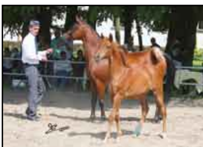
Ekumena & Colt by Ganges