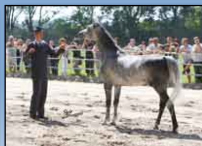
Porto - Stallion