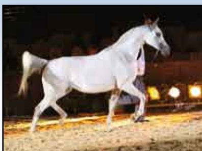
Lot 8 - Emika