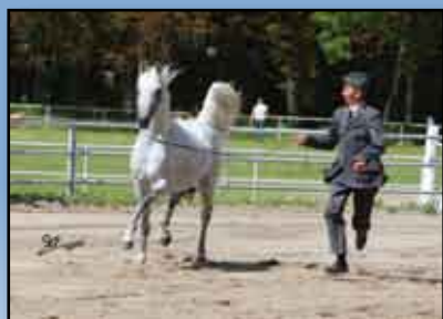
Piaff - Stallion