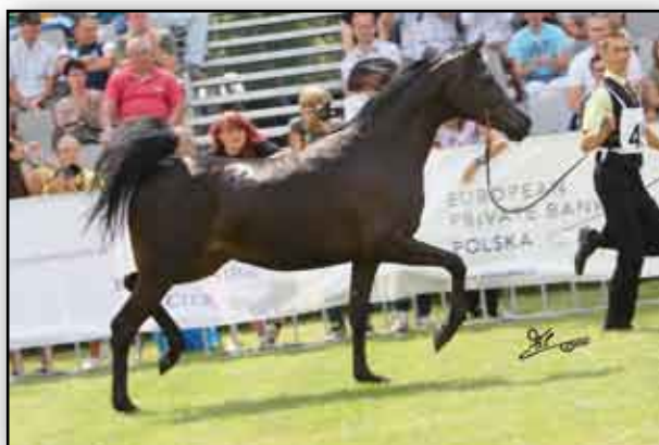
SARBIA 1. Pl. fillies 2 yrs old (class 2B) (Ekstern – Samura/Ararat) Janów Podlaski