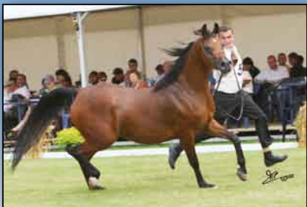
ESPINEZJA 2 Pl. fillies 3 yrs old (Psyttadel – Entaga/Ganges) bred: L. Jarmuz owned: Falborek Arabians