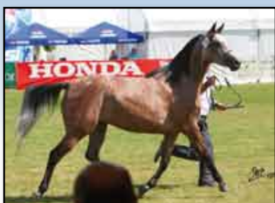
Lot 20 - Walpurgia