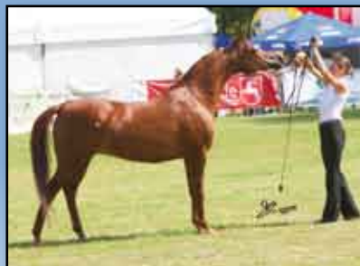
Lot 16 - Granada