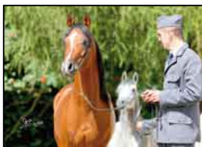
Albus - Stallion