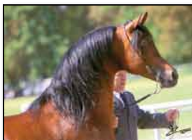
Ganges - Stallion