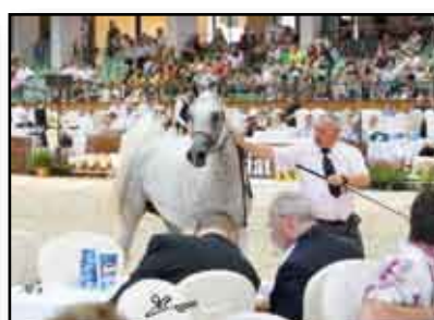
Lot 24 - Lozanna