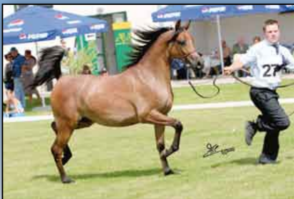
LAWINIA 2. Pl. yearling fillies (class 1B) (Ekstern – Luanda/Emigrant) Michałów