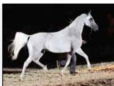
Lot 6 - Euscera