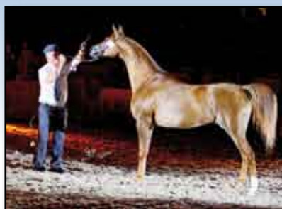
Lot 19 - Elmina