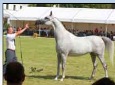
Lot 21 - Zlota Orchidea