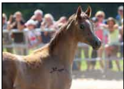
Cerelia - Filly by Enzo