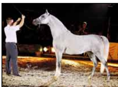
Lot 22 - Hebe