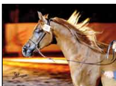
Lot 25 - Cesena