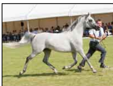
Lot 2 - Elgara