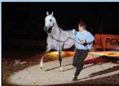
Lot C - Eliat