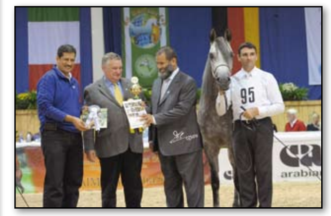
PISTORIA (Gazal Al Shaqab*** x Palmira**) 2 Pl. Mares 4-6 yrs old B&O: Michalow/PL