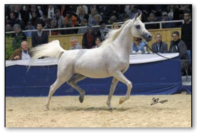
ZAGROBLA * * * (Monogramm*** x Zguba) 2 Pl. Mares 11 yrs & over B&O: Michalow/PL