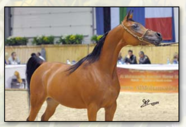
AV DOHASSAI (Massai Ibn Marenga x AV Dolimha) 2 Pl. Fillies 3 yrs old B: Sanchi/IT - O: Great White Arabians/GB

TURCHIYA MPE (WH Justice***x Thee Rahiba) 2 Pl. Fillies 2 yrs old B&O: Manzi/IT