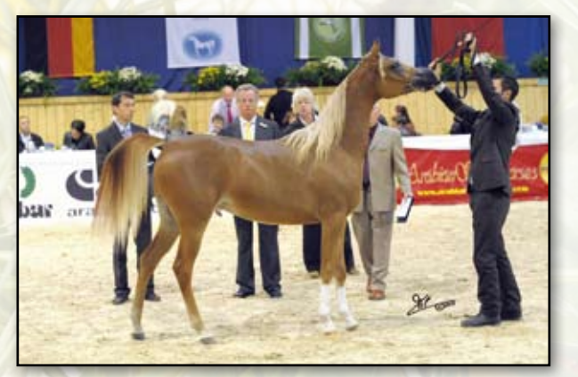
(Ajman Moniscione<sup>**</sup> x Pamira Bint Psytadel) 2 Pl. Fillies 1 yrs old (B) B&O: Hammer/DE