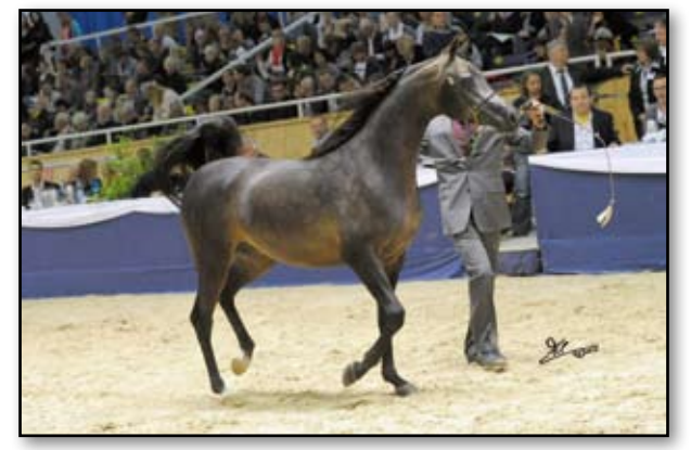
EL CHALL WR (Magnum Chall HVP x Major Love Affair) 2 Pl. Colts 2 yrs old B: Camacho/USA - O: North/USA