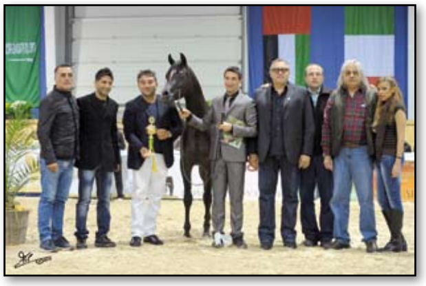
MAGIC MAGNIFIQUE (True Colours x Magic Mon Amour) 1 Pl. Colts 1 yr old B&O: Fontanella Magic Arabians/IT