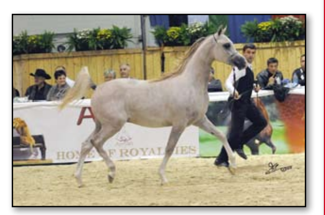
AJ BINTAN (WH Justice**** x RGA Kouress) 2 Pl. Colts 1 yr old B: Markelle Arabians/USA - O: Ajman Stud/UAE