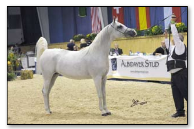
EMMONA* (Monogramm*** x Emilda*) 1 Pl. Mares 11 yrs & over B&O: Michalow/PL