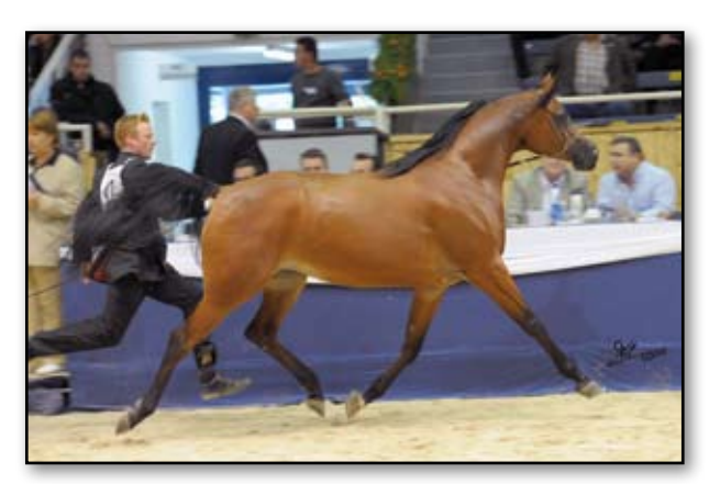
MARYLLA (Gazal Al Shaqab*** x Margotka) 2 Pl. Mares 4-6 yrs old B: Blommeröd/SE - O: Shgair Stud Farm/KSA