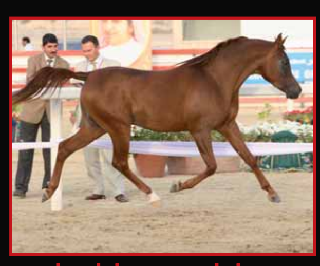
mahabi assaghier reserve stallions