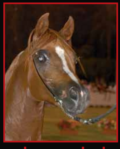
best head male