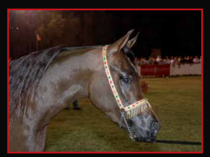
AMAL CHAMPION FILLies