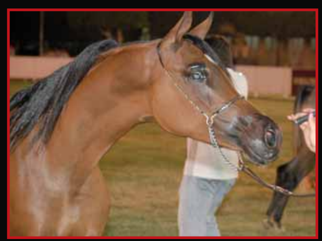
aal i b'khour reserve FILLies