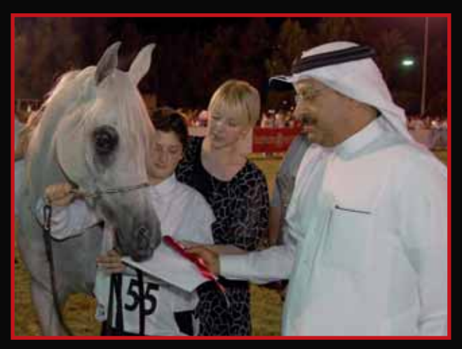
S.S. manara CHAMPION mares

siness of assessing these youngsters. It was a rather easy win for the Qatari bred Roba't Al Naif a daughter of WN Star Of Antigua owned by the Aali Stable which would dominate much of this show. The second division of this class threw up the first 90 plus score of the evening as the charismatic Bahrain born Aali B'khour swept her class. The Aali Stable owned winner was imported in-utero and is by Gai El Julyenn ex Coolrain Estellar. Another Bahrain born filly Amal owned by the Sunset Stable and by the very typey Al Adeed Al Shagab son Naif Al Rayyan out of Bint Al Lail took the next class for fillies between 2 and 3 years old. She also scored 90. The Aali Stable had to be content with second in this class with their Gazal Al Shaqab daughter Tallaht Al Naif. Class 5 for young mares of 3 to 4 years old saw the gorgeous SW Renegade daughter S.S. Manara owned by the Al Mohanna Stable dominate proceedings with yet another 90 plus score. Aali Stable had yet another second place with the Dakharo sired Jawaher Al Khalidiah. They didn't have to wait long for another win though as their Al Shaqab bred pair of Shahd Al Shaqab (by Adnan Al Shaqab) and Noof Al Shaqab (by Ansata Selman) took first two spots in the large but disappointing Class 7 for mares four years old and over.