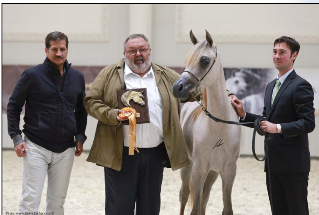
AL MALIKA (Al Farid/Al Caia) - O&B: Huber/AT