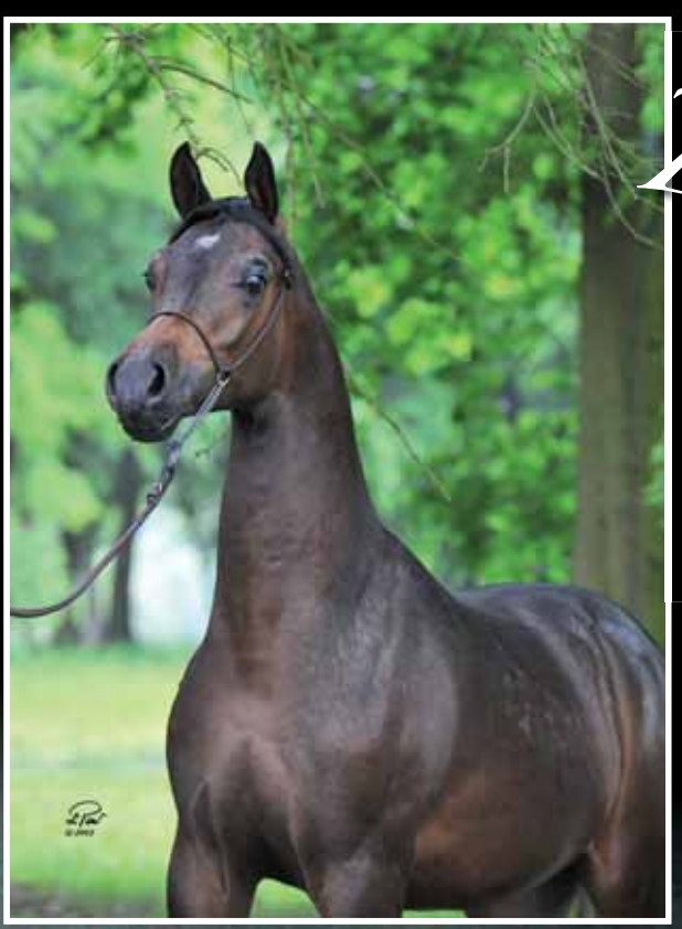
grey 2008 (Pegasus – Gwarka/Monogramm) Agnieszka Wójtowicz