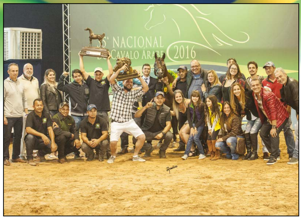
Gold National Champion Stallion Matisse FM from Haras Stigmatas