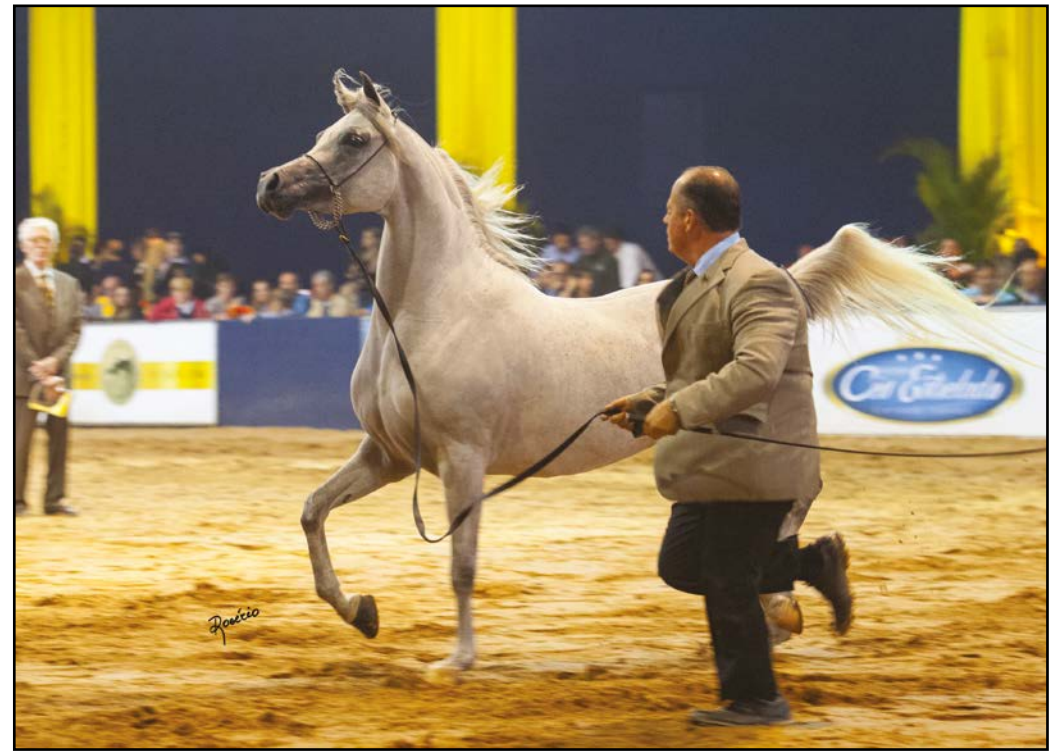
Gold National Champion Young Mare Baviera HVP from Haras Vila dos Pinheiros