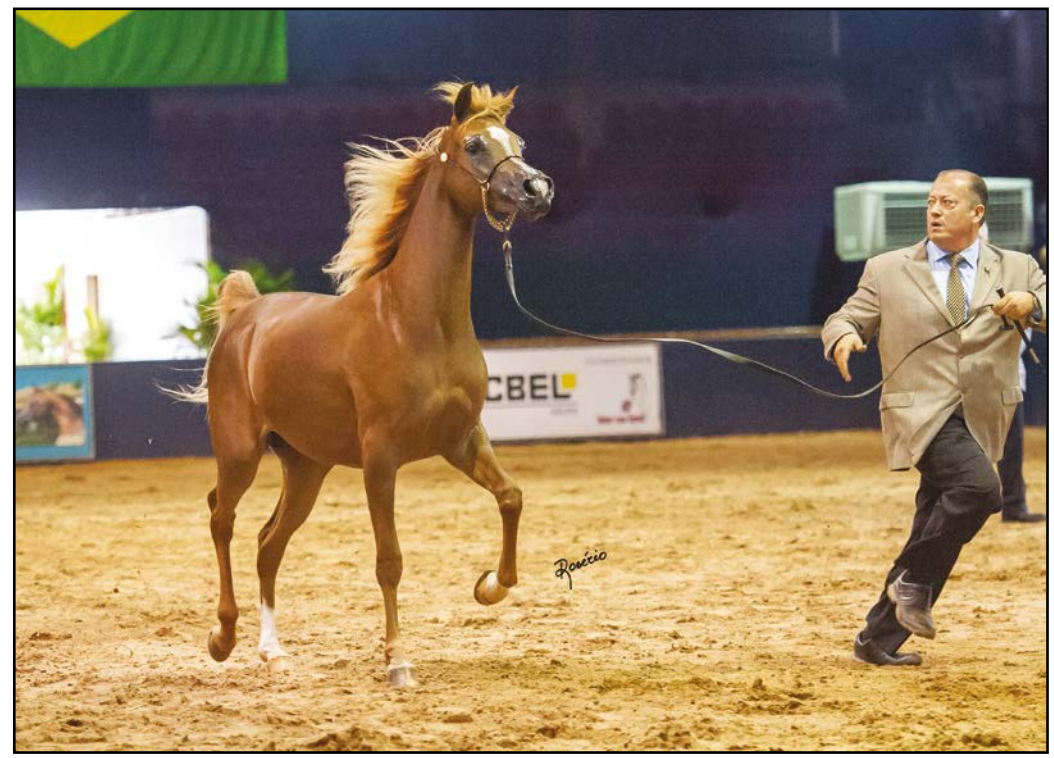
Gold National Champion Young Filly Munique HDF from Haras das Faias