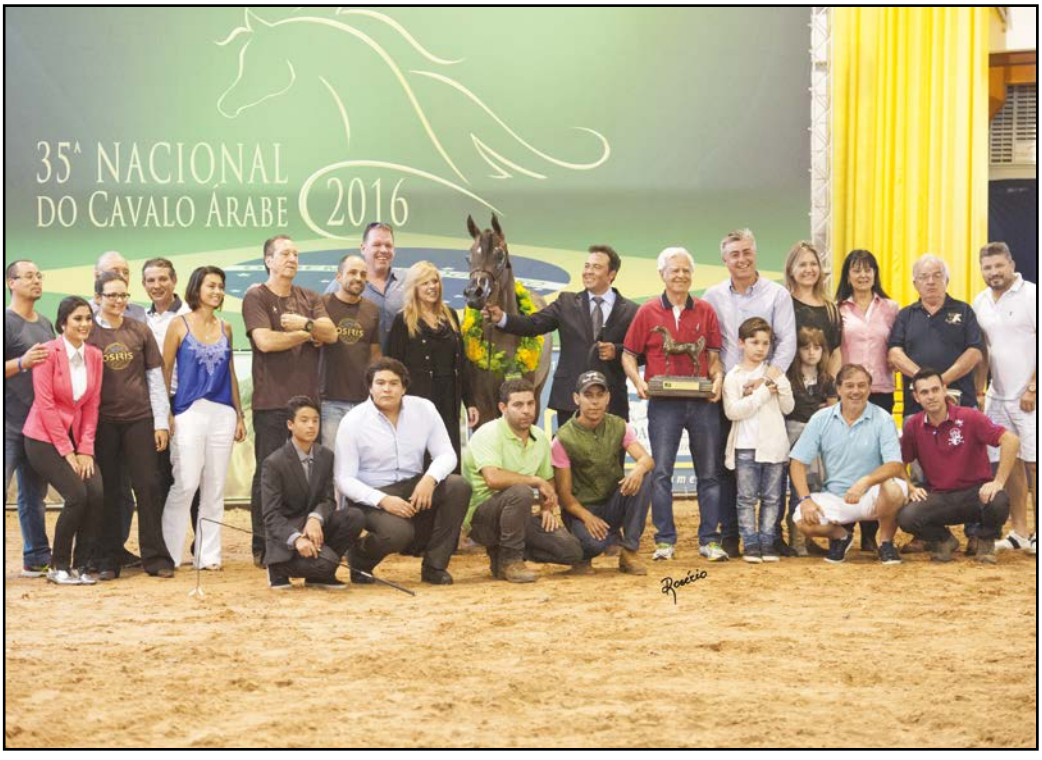
Gold National Champion Filly Khyki HEC from Haras e Estância California