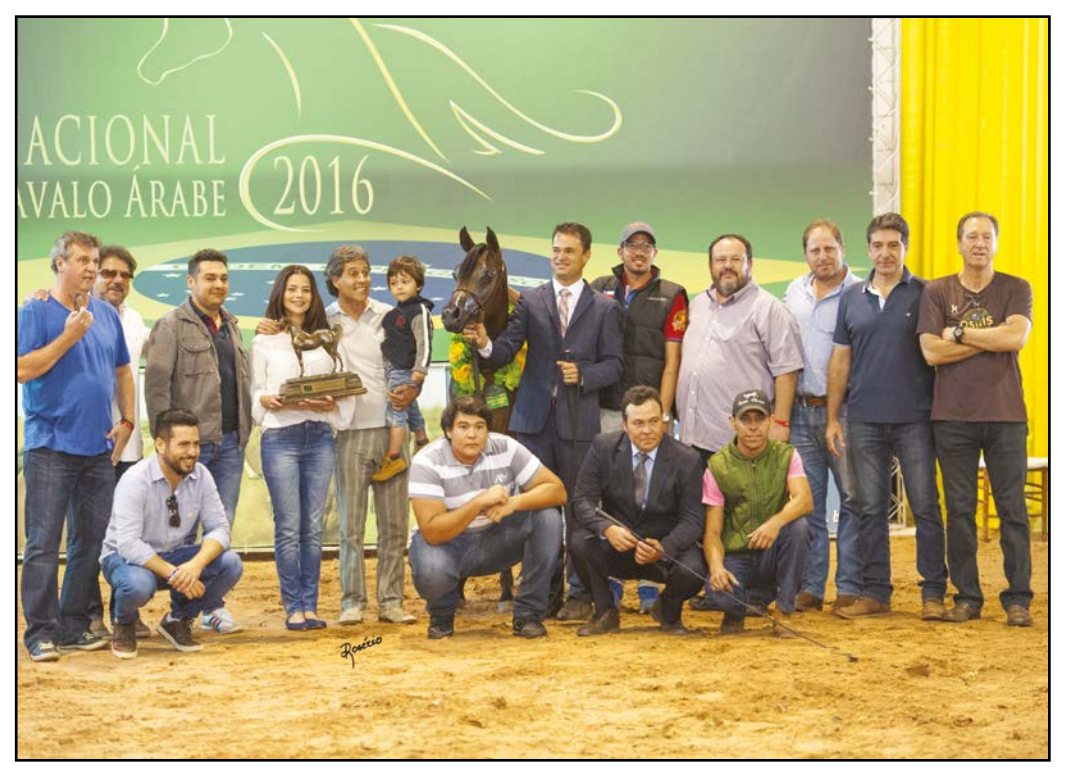
Gold National Champion Jr. Filly Roxane Johnny from Haras Johnny