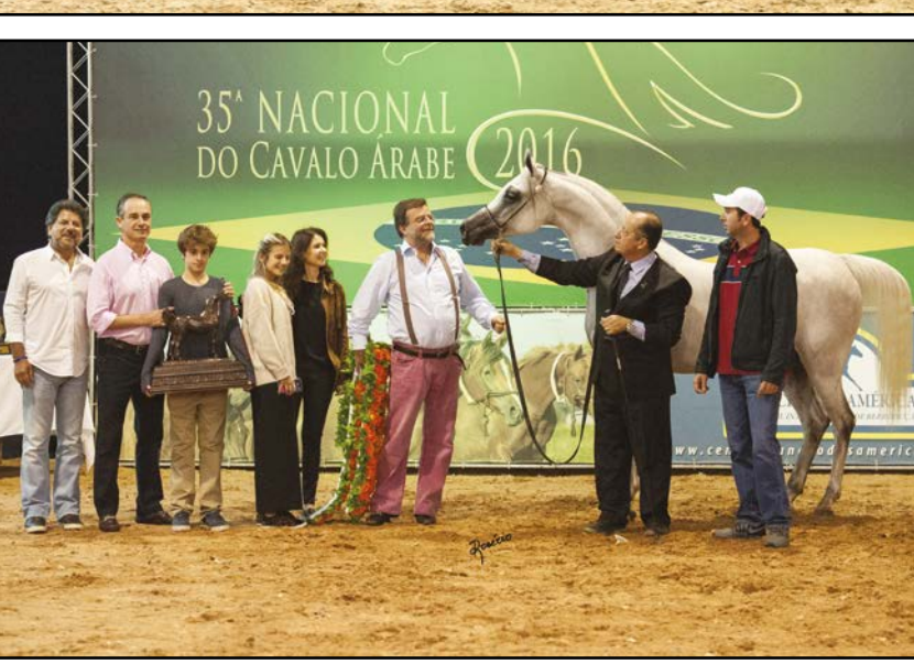
Bronze National Champion Young Stallion Armani El Keav from Haras HPJ