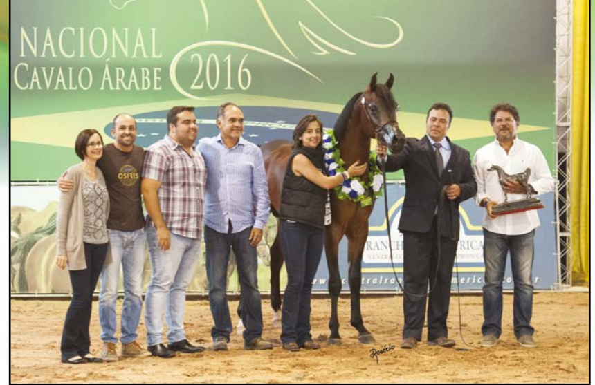
Silver National Champion Young Filly Juline Morab from Haras Morab

Silver National Champion Young Colt Zahir El Madan from Haras El Madan