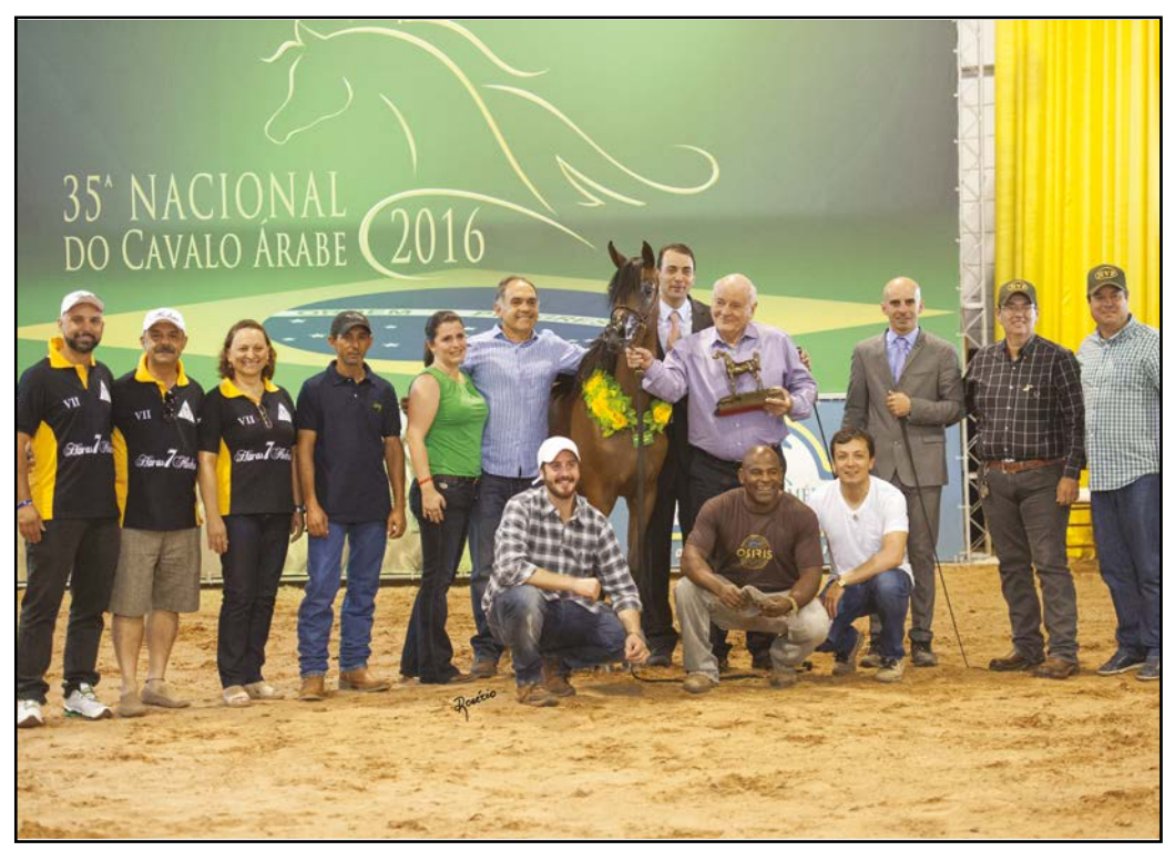
Gold National Champion Jr. Jr. Filly La Belle Shawan from Haras Vila dos Pinheiros