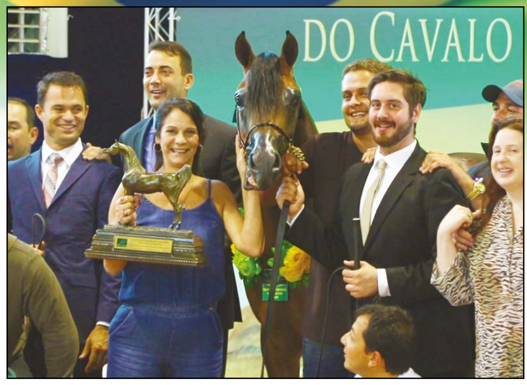
Gold National Champion Young Colt Falak FK from Haras FK