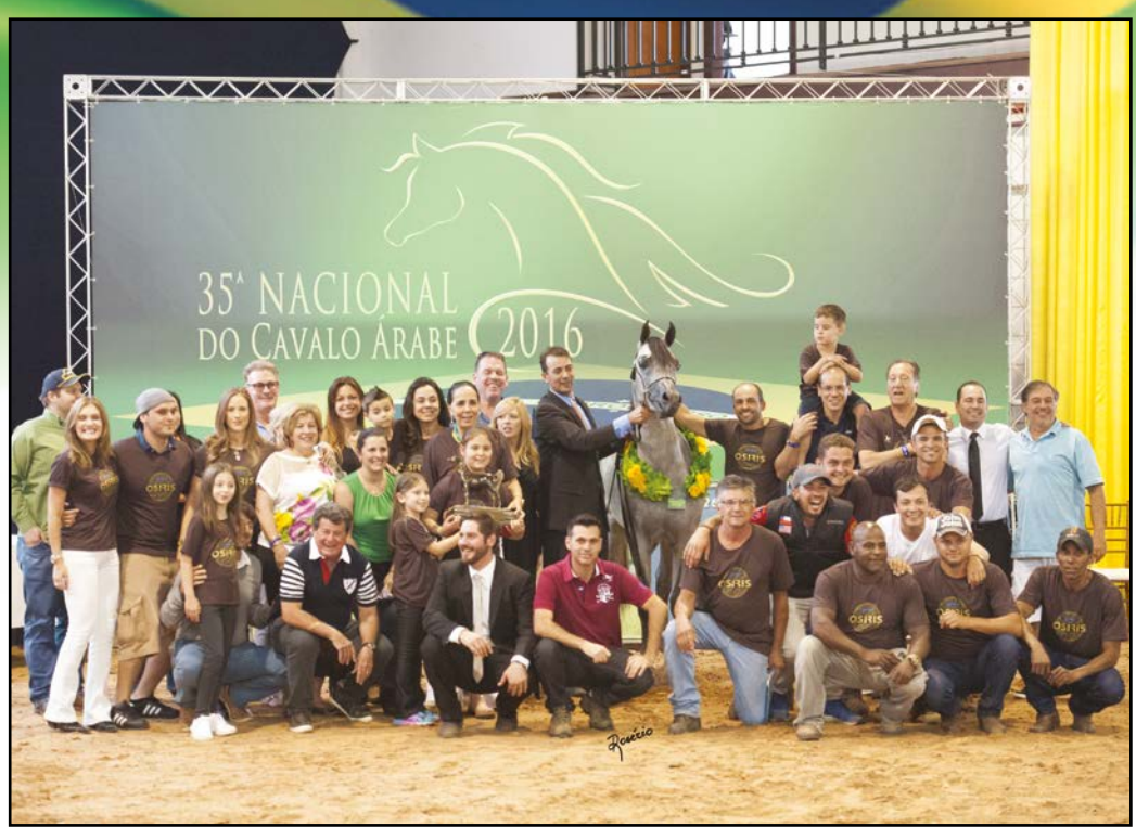
Gold National Champion Colt Gran Osiris from Haras De Al Hosçan