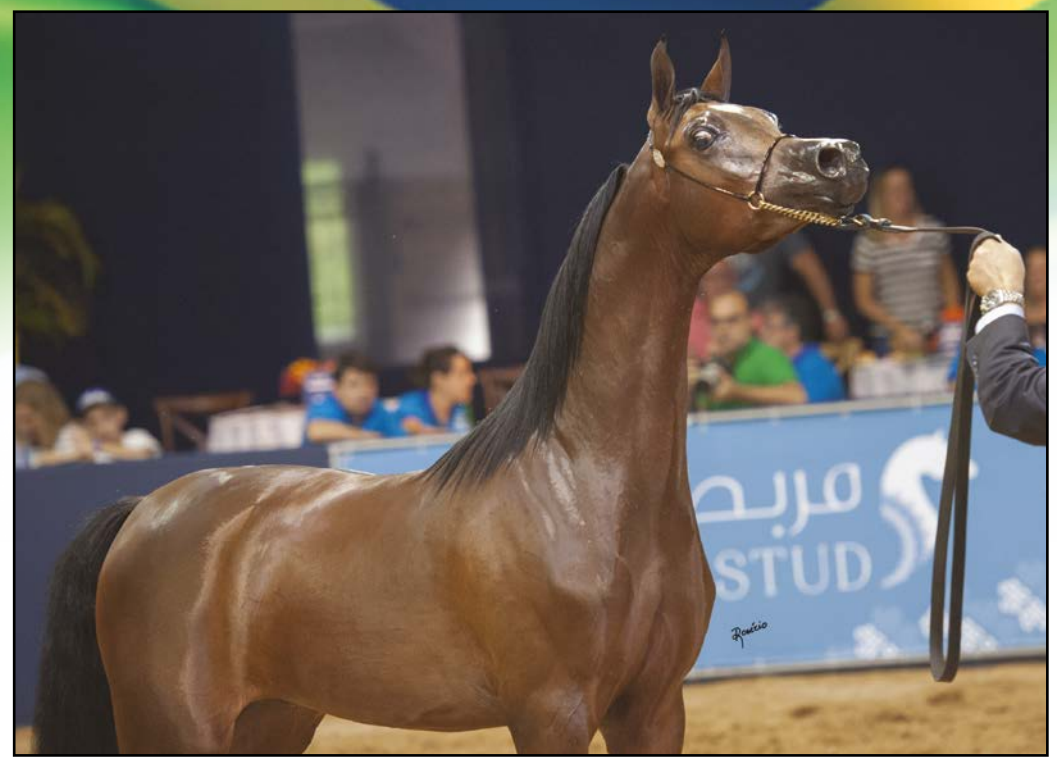
Gold National Champion Jr. Colt Royal Asad from Royal Arabians