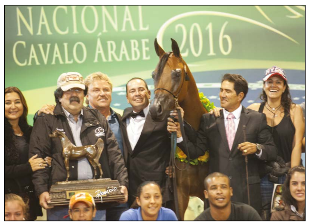
Gold National Champion Mare Queen Ayda FWM from Haras Lone Star