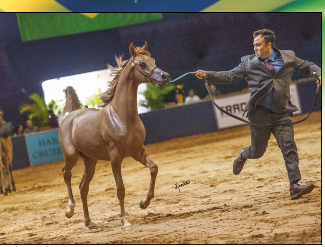
Gold National Champion Jr. Jr. Colt TS Prince Khidam from Haras Arco Azul