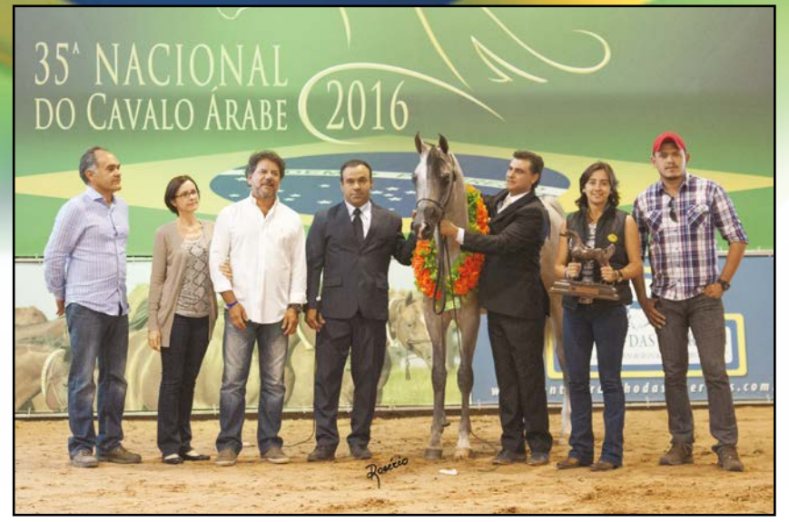
Bronze National Champion Young Filly Sweet Satisfaction from Haras De Al Hosçan