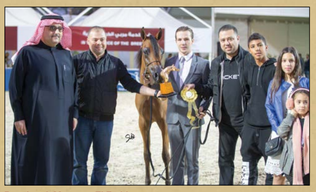
Best head, Mazyona El Farida

The fifth edition of this show reinforces in Egypt the presence of the AHO who renews its focus on helping small and big breeders to maintain and spread the arabian purebred. As always AHO has awarded prizemoney that breeders can invest in their farms and, as always, everything has been made possible by