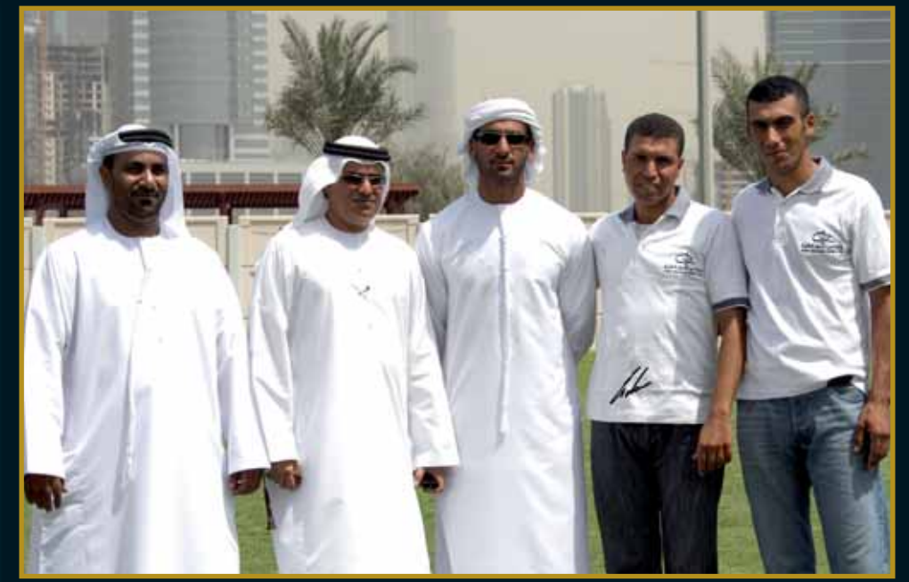
Dubai Arabian Horse Stud Team

appear in the junior show categories. More evidence of the effectiveness of a project that is way ahead of its time. But let us leave space to the images of these wonderful mares and the incredible production of the Dubai Arabian Horse Stud. □