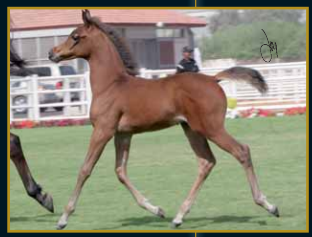
D Deemah 2009 filly Royal Colours x Muranas Je Taime

ce working with wellestablished studs that have gained lots of expe-