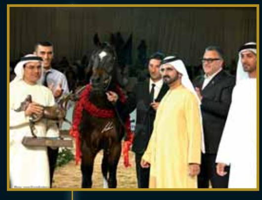
H.H. Sheikh Mohammed bin Rashid Al Maktoum

private reception. The local and international press wrote a lot