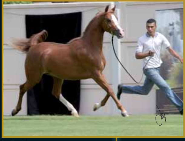
Perfect Storm 2006 chestnut filly Justify x Afire Storm

In the next pages, our words are accompanied by images that