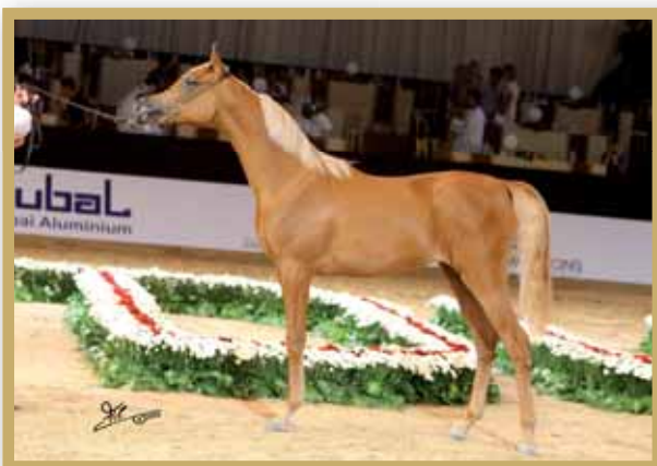
ZAINAH AL THALITHA KORONEC X AL JAZI 1. PL. FILLIES 1 YEAR OLD SECTION A B&O: KING ABDULLA BIN ABDULAZIZ & SONS

DUBAI INTERNATIONAL ARABIAN HORSE CHAMPIONSHIP ECAHO A SHOW