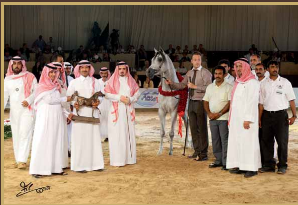
AL LAHAB X EL DORADA B: MANNY VIERRA - O: HRH PRINCE KHALED BIN SULTAN BIN ABDUL AZIZ AL SAUD