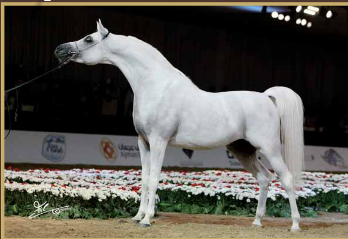
AS SINANS PACHA X NAVARRONE "P" B: DESPEGHEL-VAN-HEE - O: AJMAN STUD