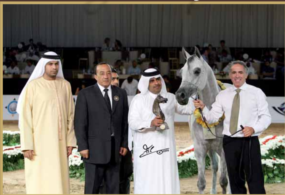
MARWAN AL SHAQAB X ZT LUDJKALBA B: MARIETA SALAS - O: AL SHAQAB