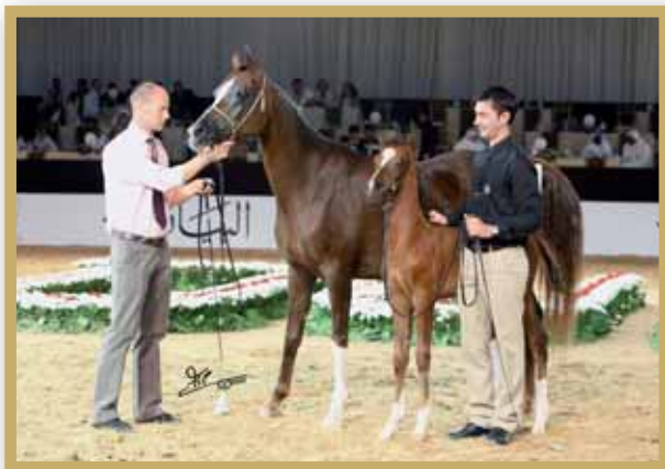
ATLAS AL ZOBAIR