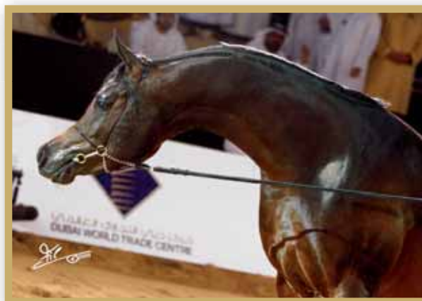
ROYAL COLOURS MOST BEAUTIFUL HEAD