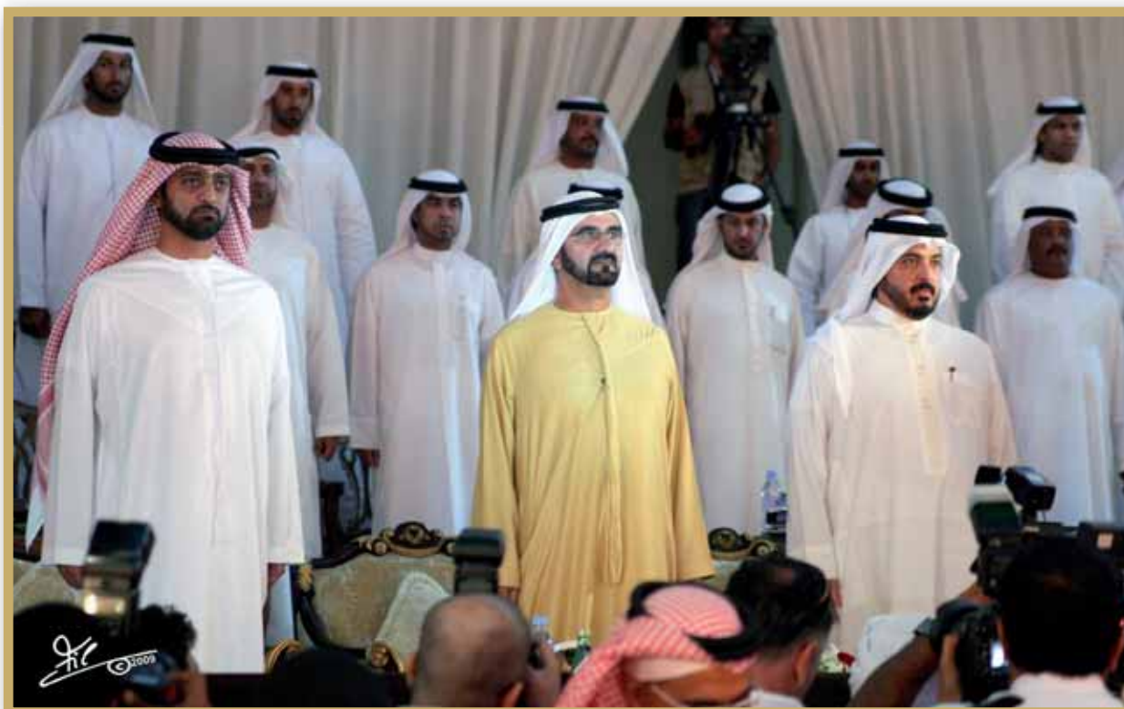
SHEIKH AMMAR BIN HUMAID AL NUAIMI, CROWN PRINCE OF AJMAN & H.H. SHEIKH MOHAMMED BIN RASHID AL MAKTOUM (VICE-PRESIDENT AND PRIME MINISTER OF THE UAE AND RULER OF DUBAI)

DUBAI INTERNATIONAL ARABIAN HORSE CHAMPIONSHIP ECAHO A SHOW