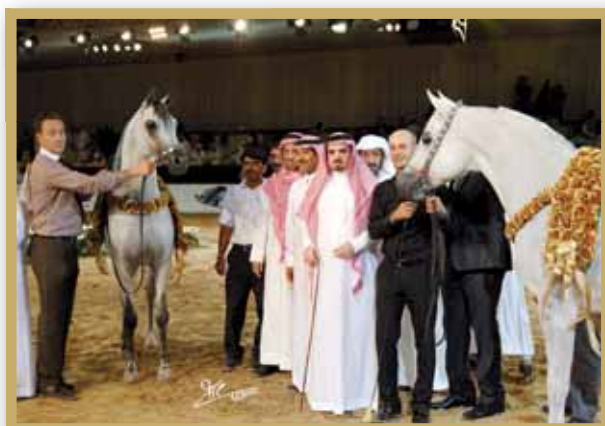
BAANDEROS & NIJEM IBN ETERNITY

DUBAI INTERNATIONAL ARABIAN HORSE CHAMPIONSHIP ECAHO A SHOW