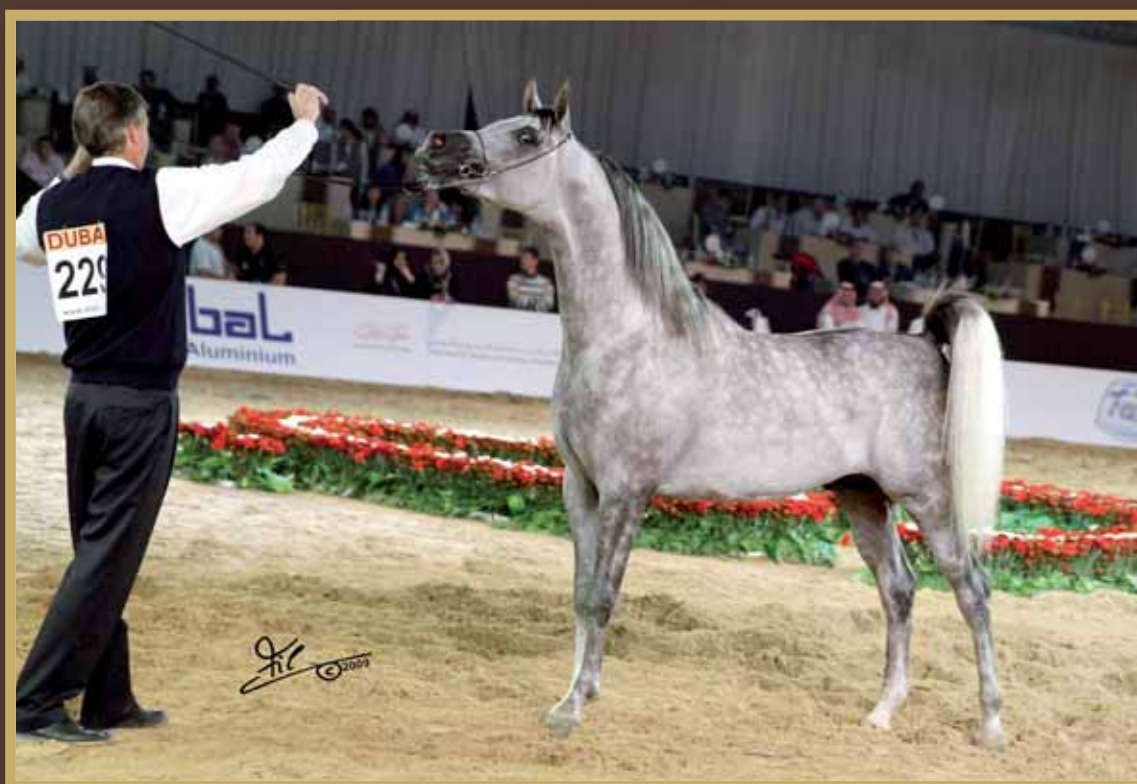
POGANIN X KWESTURA B: SK MICHAELOW - O: ATHBA STUD