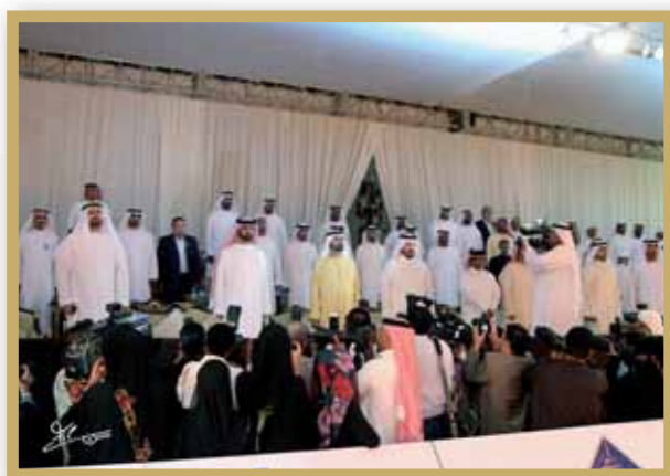
SHEIKHS AND VIPS

DUBAI INTERNATIONAL ARABIAN HORSE CHAMPIONSHIP ECAHO A SHOW