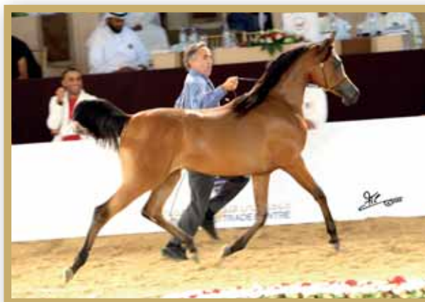
SHAMAH AL SHAQAB MARWAN AL SHAQAB X SWF DESERT ROSE 1. PL. FILLIES 1 YEAR OLD SECTION B B&O: AL SHAQAB

2008/2009. This alone can give you an idea of the atmosphere that pervaded the entire event, a combination of euphoria and tension that reached the climax on the day of the final, when the top spots were still up for grabs. The