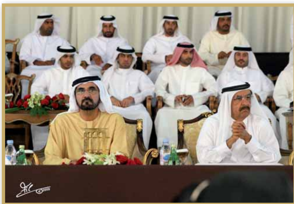
H.H. SHEIKH MOHAMMED BIN RASHID AL MAKTOUM (VICE-PRESIDENT AND PRIME MINISTER OF THE UAE AND RULER OF DUBAI) & H.H. SHEIKH HAMDAN BIN RASHID AL MAKTOUM