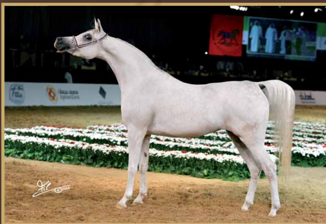
LAHEEB X BAHHA B: MASLATI & ARIELA ARABIANS - O: AJMAN STUD