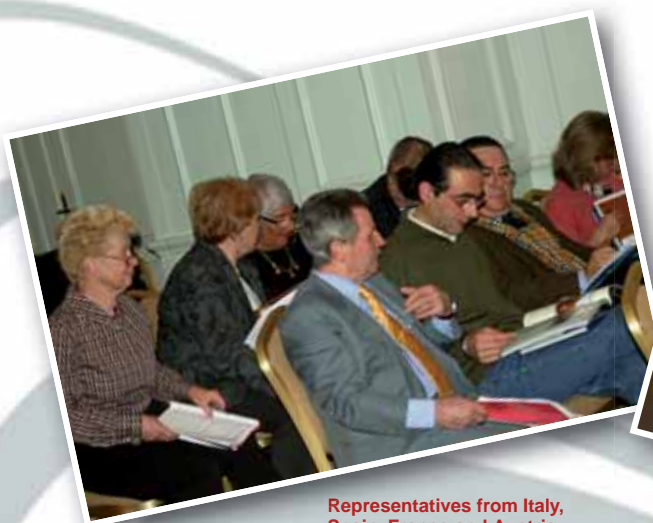
Representatives from Italy, Spain, France and Austria

The assembly honoured the dead with a minute of silence.