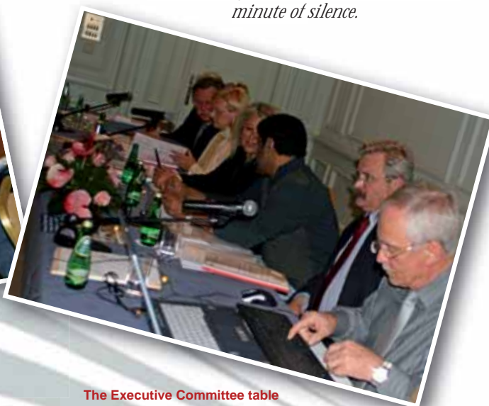
The Executive Committee table