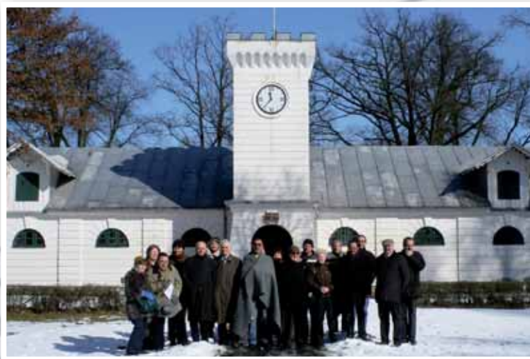
Many representatives join the post conference tour to Janow Podlaski