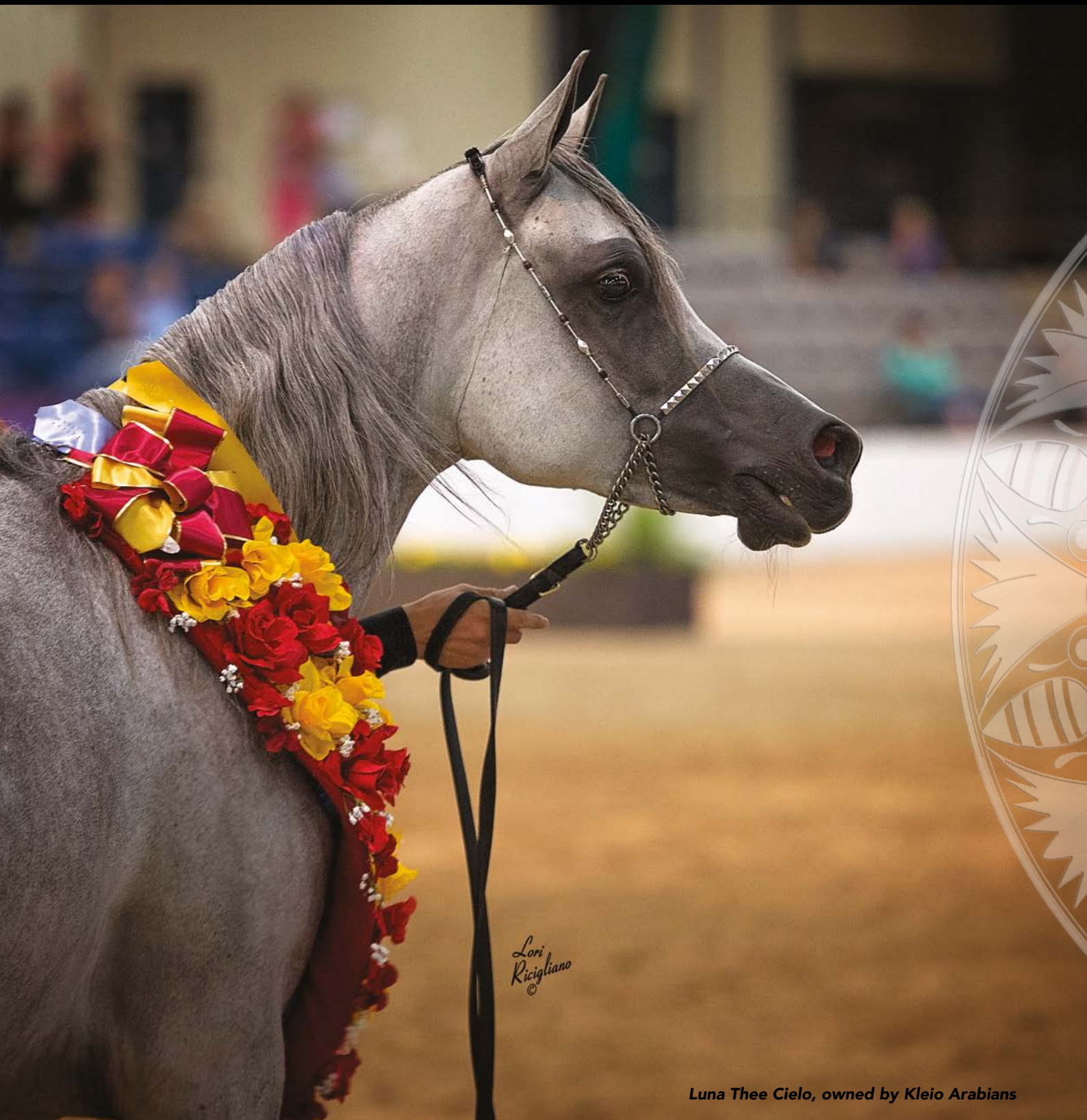
Luna Thee Cielo, owned by Kleio Arabians