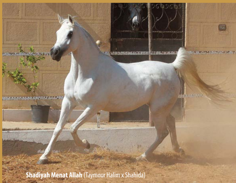
Shadiyah Menat Allah (Taymour Halim x Shahida)