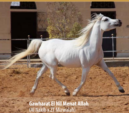
Gawharat El Nil Menat Allah (Al Nakib x ZT Mizwalah)