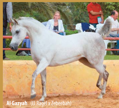
Al Gazyah (El Ragel x Zebeebah)