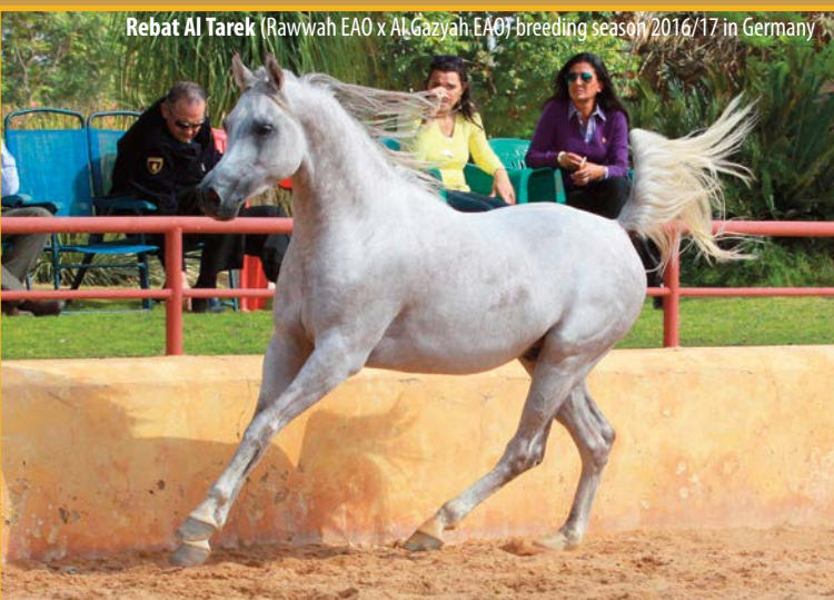
Rebat Al Tarek (Rawwah EAO x AL Gazyah EAO) breeding season 2016/17 in Germany

We all wish you good luck for your farm and your stallion.