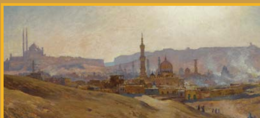
Etienne Dinet, Cairo, 19 th Century

A group of breeders from Germany, Italy, and Switzerland had followed the call of Pyramid Society Europe to come and visit the shows in Cairo in November. Once there, they would not go without visiting some significant studs as well, in order to get an insight into the breeding concepts, the horses, and their way of living. Having a look behind the scenes is always fascinating and makes for fresh experiences. Sometimes, new contacts will result, stimulating the market for stallions or making interesting new connections for breeding possible. In today's media world of pictures, it is more important than ever to be able to have a personal close look at horses, also inspecting their offspring, so as to get to a realistic assessment of their value for the globalized breeding of our