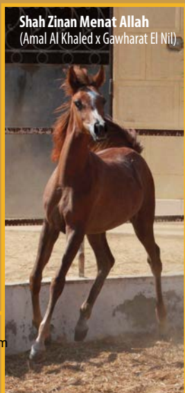
Shah Zinan Menat Allah (Amal Al Khaled x Gawharat El Nil)