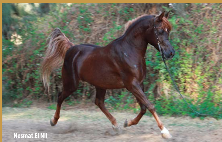
Nesmat El Nil