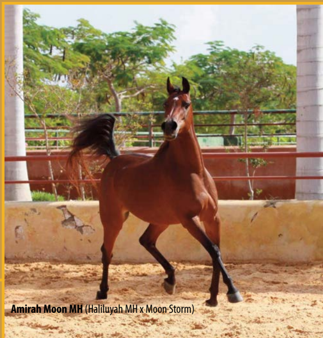
Amirah Moon MH (Haliluyah MH x Moon Storm)

Savir: Thank you very much, Ali. We will discuss the Straight Egyptians in Egypt in some more detail in the next issue of our Desert Heritage Magazine.