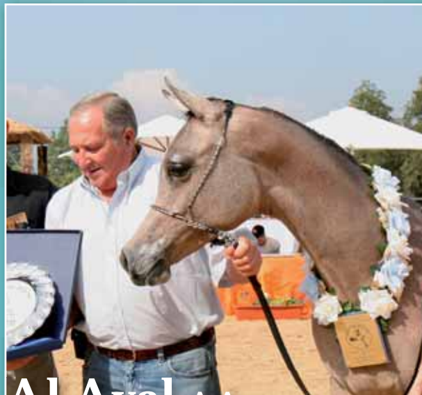
Al Ayal AA Futurity Colts