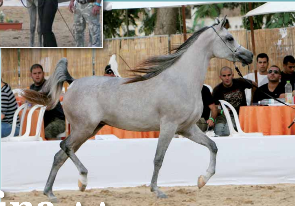
Al Bilal x Dumka Bred and owned by Ariela Arabians