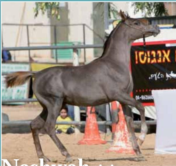
Nashwah AA Futurity Fillies