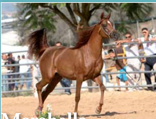
Marabella 1 pl. Fillies 2007a