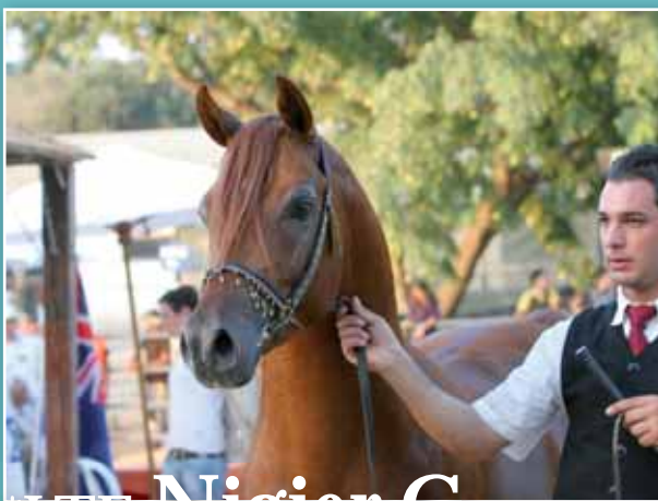
*LTF Nigier C 1 pl. Colts 2005