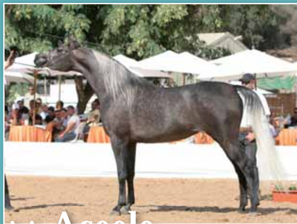
AA Aseele 1 pl. Fillies 2005