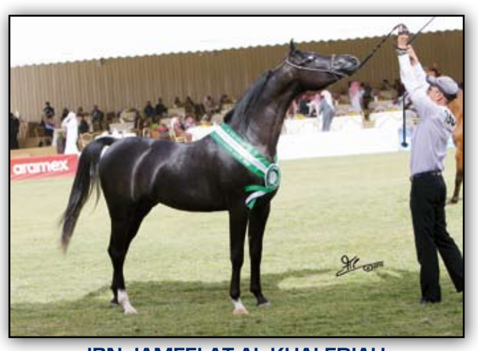
IBN JAMEELAT AL KHALEDIAH Moutaz Al Biwaibiya x Jameelat Al Khalidiah Breeder & Owner: HRH Prince Khaled bin Sultan bin Abdulaziz Al Saud 1 pl. Colts 2 yrs old (Class 5B)