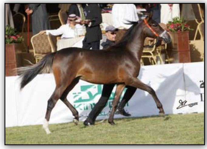
HADEEL AL KHALEDIAH Khalid El Biwaibiya x Areefah

Breeder & Owner: HRH Prince Khaled bin Sultan Bin Abdulaziz Al Saud 1 pl. Fillies Desert Bred Arabians (Class 13)