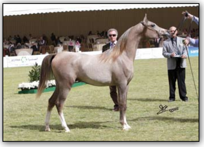
AL MONTASER Koronec x El Masoufah Breeder & Owner: King Abdullah Bin Abdulaziz & Sons 1 pl. Colts 1 yr old (Class 4B)