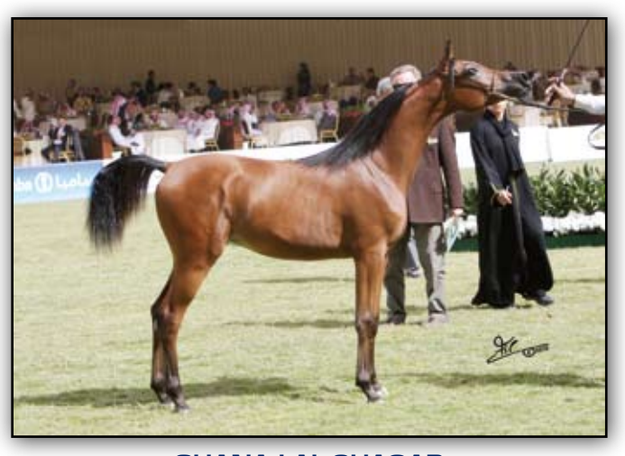
GHANAJ AL SHAQAB Marwan Al Shaqab x CP Vanitie Fair Breeder & Owner: Al Shaqab 2 pl. Fillies 1 yr old (Class 1B)