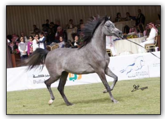
PARMANA Al Maraam x Palmira Breeder: SK Michalow - Owner: Athbah Stud 2 pl. Fillies 2 yrs old (Class 2A)