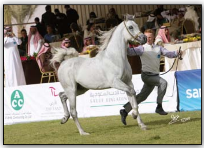
NAYEF AL SHAQAB

Ashhal Al Rayyan x Naima Al Shaqab Breeder: Al Shaqab - Owner: HH Prince Salman bin Mohammed bin Saad bin Abdul El Rahman Al Saud 2 pl. Colts 3 yrs old (Class 6)