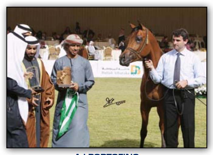
AJ PORTOFINO Vervaldee x Magic Jamilla Breeder: Fontanella Magic Arabians - Owner: Ajman Stud 2 pl. Colts 2 yrs old (Class 5B)

the Athbah Stud. Following in second place, with just 0.8 points less was ZAINAH AL THALITHA (Koronec x Al Jazi) owned by King Abdullah Bin Abdulaziz & Sons. NOOR BINT ETERNITY-D (Eternity Ibn Navarrone-D x M Randy) owned by the Ajman Stud finished in third place. A triple whammy in Class C of 2-year-old fillies for the Al Khalediah stud, which saw NOORAN AL KHALIDIAH AL (Padrons Immage x