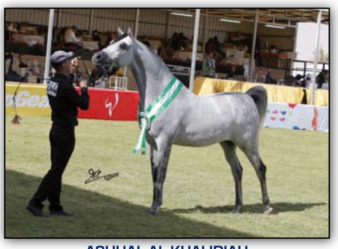
ASHHAL AL KHALIDIAH Aja Sangali x Psyches Kyss Breeder & Owner: HRH Prince Khaled bin Sultan bin Abdulaziz Al Saud 1 pl. Stallions 4-6 yrs (Class 10 B)