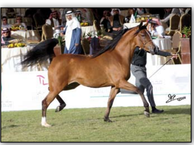
HAMDANIEH EL SAHARAA

Breeder & Owner: HRH Prince Khaled bin Sultan Bin Abdulaziz Al Saud 1 pl. Fillies Desert Bred Arabians (Class 13)