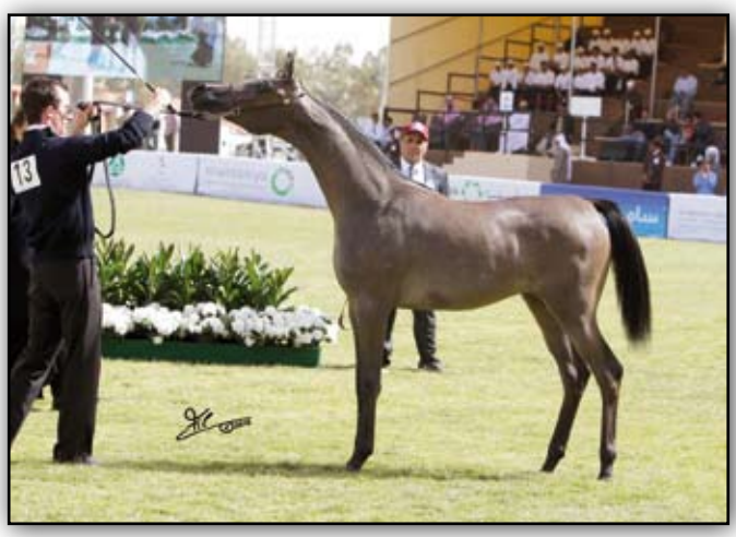
MEQBILAT ATHBAH QR Marc x Martinique J Breeder & Owner: Athbah Stud 1 pl. Fillies 1 yr old (Class 1A)