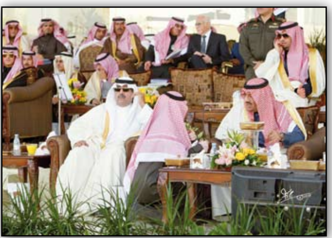
HRH Prince Faisal with Prince Khaled Bin Sultan