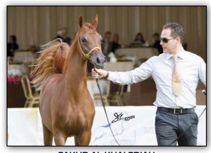
FAKHR AL KHALEDIAH Marquis Cahr x Barah Al Khalidiah Breeder & Owner: HRH Prince Khaled bin Sultan bin Abdulaziz Al Saud 2 pl. Colts 1 yr old (Class 4B)