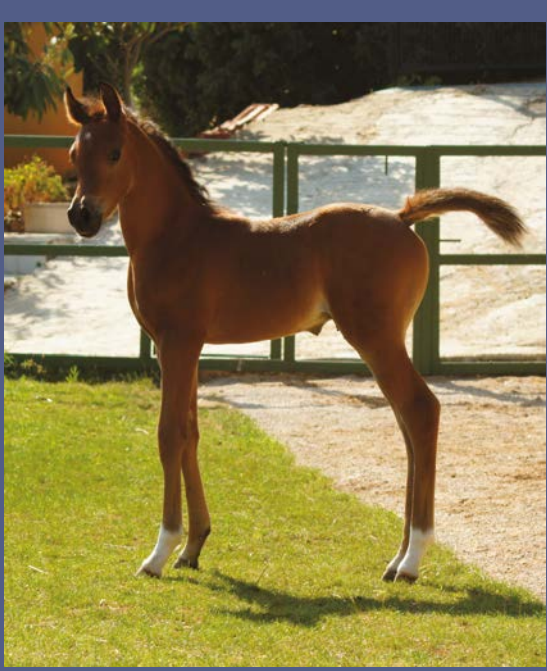
DG ANTAR (Fadi Al Shaqab x Alisha Bint Bengali)