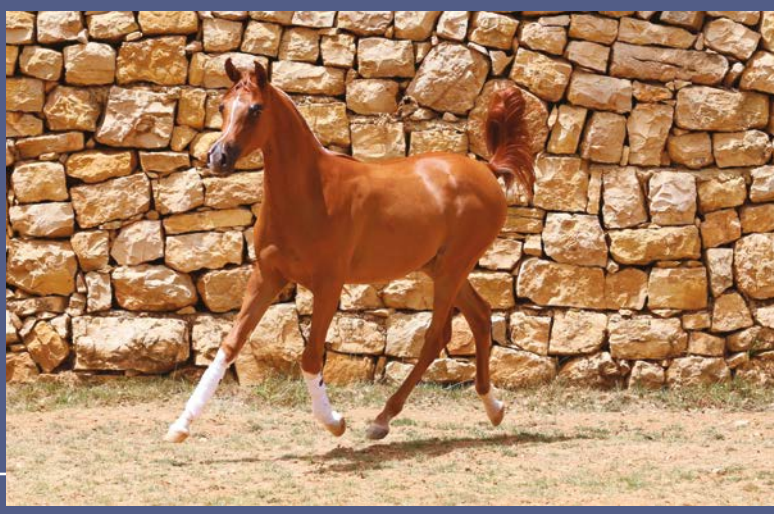
AJ NADER (AJ Mardan x AJ Noor Kwestura), yearling colt