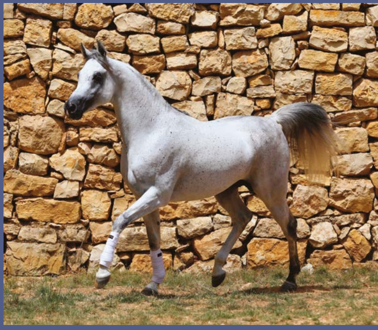
TB HILAL (Nil del Guado x TB Hasna), straight Egyptian mare, Obayyan Om Juray strain, born in 2013. She is in foal to Ammar Al Mohamadia.