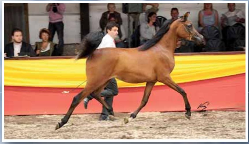
Gold Junior Champion Filly

DG Sahra (DF Malik Jamil x L.M. Sadunga)