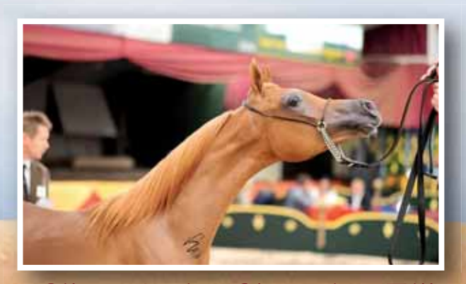
Silver Junior Champion Filly Mawee Athba (QR Marc x Trejor IA)

DG Sahra (DF Malik Jamil x L.M. Sadunga)