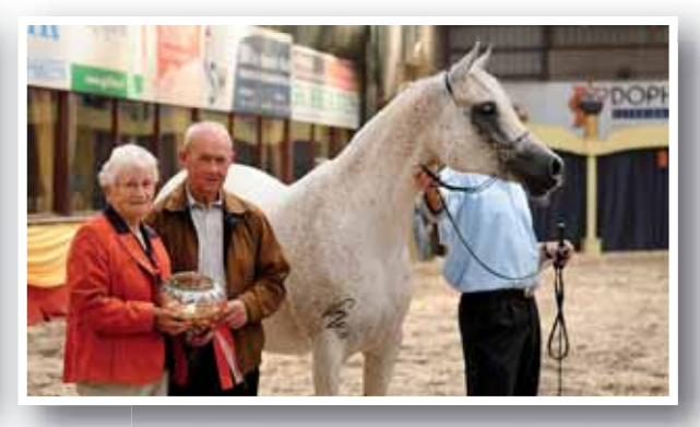
Bronze Senior Champion Mare

While the junior results were mostly won by the first-sight favorites, the senior championships brought much more emotions to both spectators and the owners... Mares 4-6