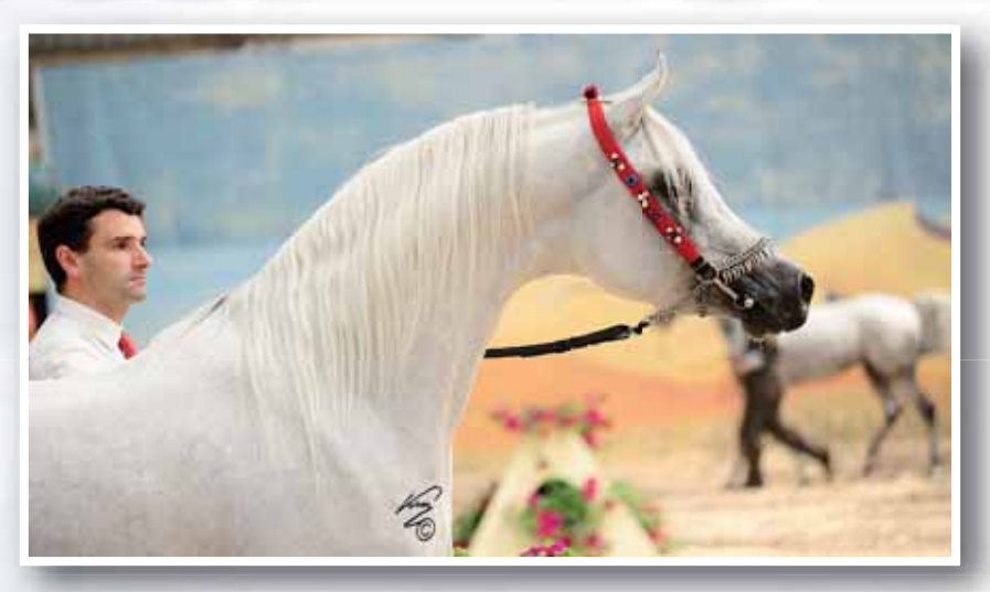
Gold Senior Champion Stallion All Falkshill (Mahadin x Al Estrella)