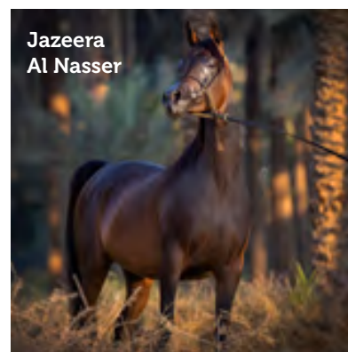
Jazeera Al Nasser