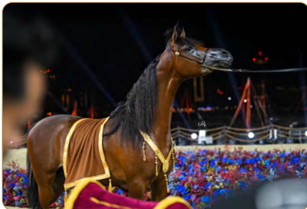
Gold Medal Junior Colts LEHON