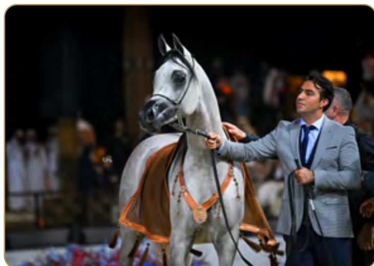
Bronze Medal Junior Colts D SHAHAR

D SERAJ X FT SHAELLA B/O: DUBAI ARABIAN HORSE STUD