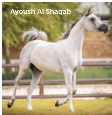
Ayoush Al Shaqab