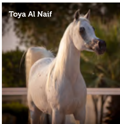
Toya Al Naif