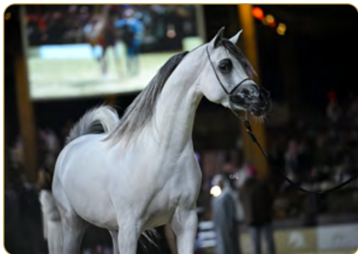
Silver Medal Junior Colts D SHARAR