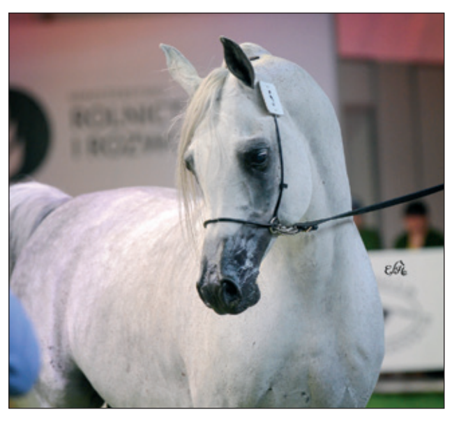
POMIAN GAZAL AL SHAQAB X PILAR LOT. 5