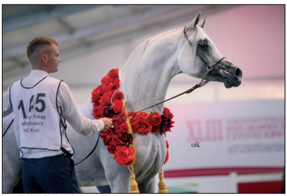
Paris (Kahil Al Shaqab x Palmeta by Ecaho)

division of 7-10-year-old mares was dominated by the participants from Janow Podlaski. The first position was triumphantly taken by the 10-year-old beautifully maturing grey Euzona (Om El Bellissimo x Euzetia by Etogram) who received a full set of 20s for type plus 2x20 for head and neck and 2x20 for movement. With a total score of 94.20 points, she finished ahead of her 9-year-old chestnut stable companion Paterna, the daughter of two legends who passed away not so long ago, the significant sire of champions, Eden C, and the unforgettable Pinga (by Gazal Al Shaqab). After witnessing so much beauty and feminine charm, I expected the excitement to calm down while admiring the oldest mares. I could not have been more wrong! The temperature kept rising to reach its peak until the last contestant of the day left the showring. And what a mare it