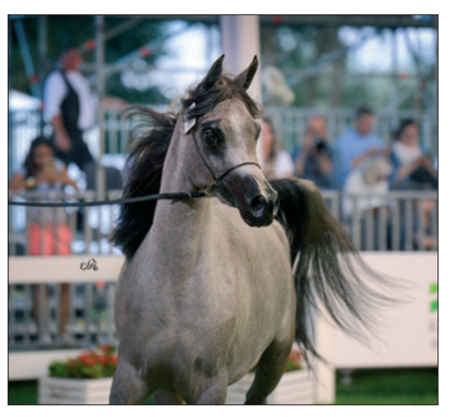
EL MADERA MORION X EL MEDONIA LOT. 3