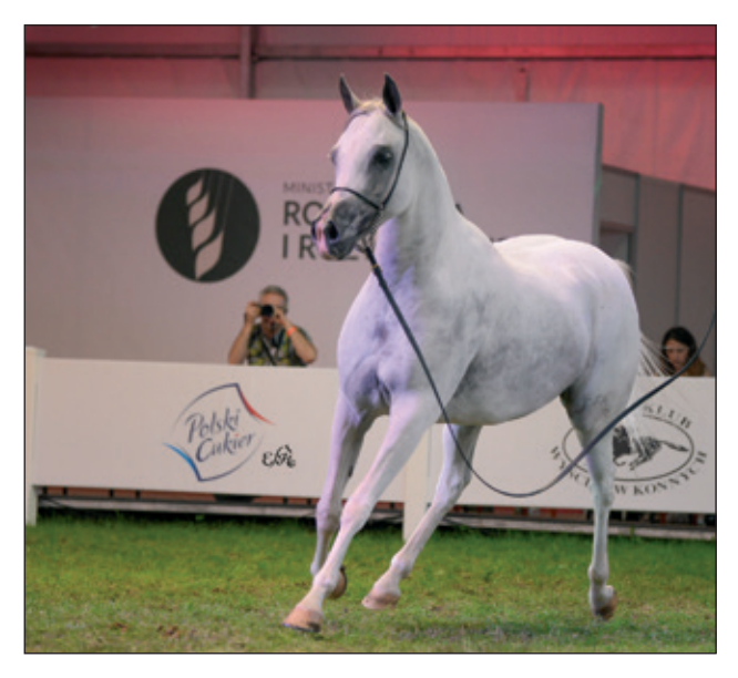
TATRA PALATINO X TARTINA LOT. 14