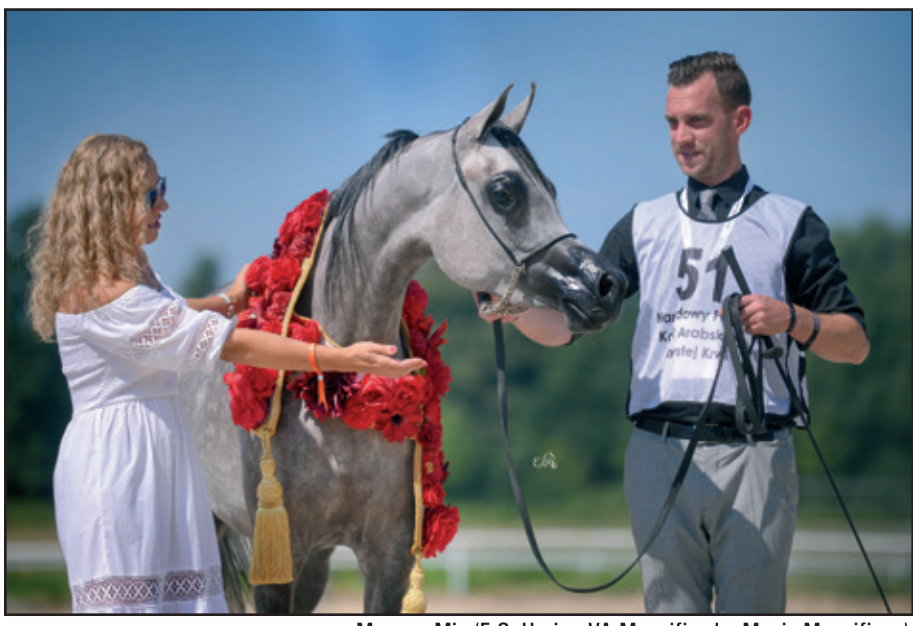
Mamma Mia (E.S. Harir x VA Magnifica by Magic Magnifique)

mares. El Bellissima received 5x20 for type, 3x20 for head and neck and 2x20 for movement, which gave her the total of 93.80 points, while Pila, receiving 'only' one 20 for type and 3x20 for movement, finished on the class podium with 93.20 points. In class 7B, the scores soared even higher, with the two qualifying mares reaching above 94 points. This time, it was a decisive triumph of Michalow Stud. Their beautiful bay Ekstern daughter Protekcja (out of Pentra by Poganin) bewitched the judges with her exotic type (4x20), perfectly shaped head and neck (3x20), correct conformation and powerful ground-covering trot (5x20). Her final mark of 94.40 points seemed impossible to be defeated, but the show was not over yet. Her maternal half-sister Poganinka (by El Omari) came second with only 0.10 points difference in the final score. Typey (5x20), with an