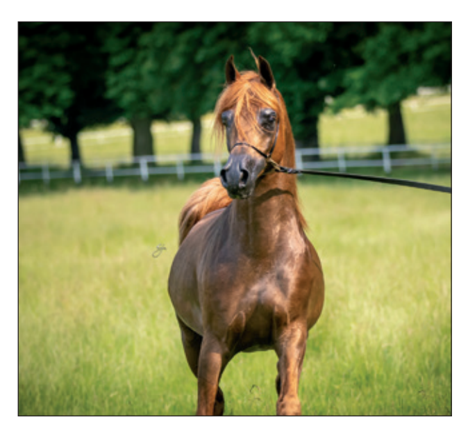
WORONIN VITORIO TO X WILDA LOT. S/18