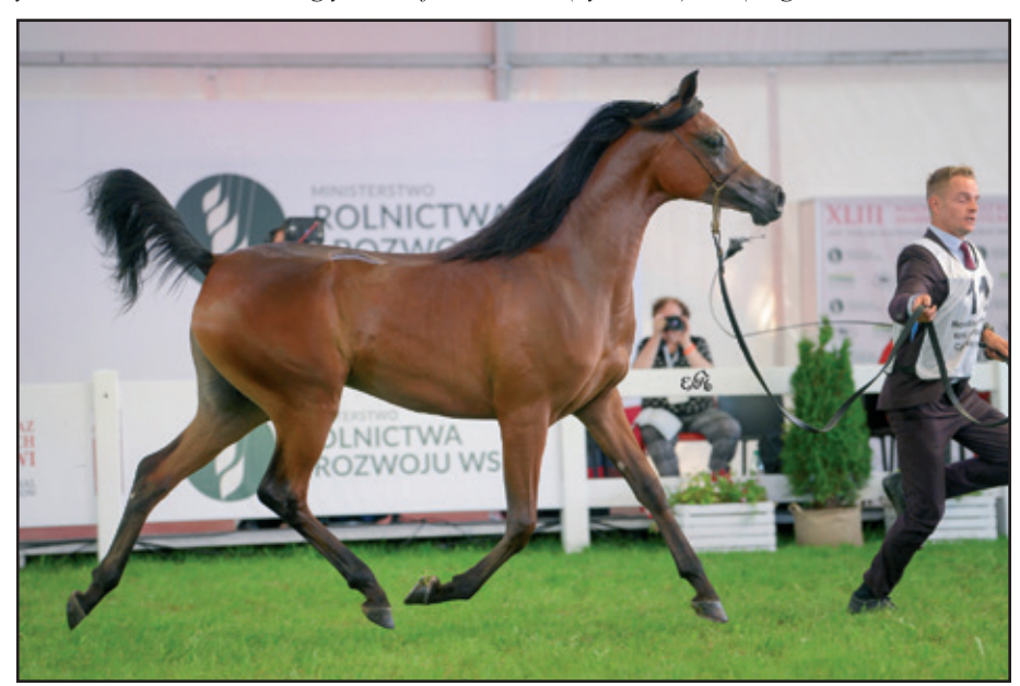
Bogini Roz PA (Kahil Al Shaqab x Black Rose by Abyad AA)

The two senior stallion classes were not very crowded but did not fail in keeping us excited until the end of the day. After the presentation of 7 elegant young stallions in class 10, two 4-year-old chestnut representatives of the Polish state studs; Erantis (Ascot DD x Eugara by Om El Bellissimo) from Janow Podlaski and Belmari (El Omari x Bint Ermina by Kabsztad) representing Malopolska Hodowla Roslin, took the first two places, scoring 91.30 and 91.10 points respectively. The last class of the day belonged to the impressive grey Paris, sired by Kahil Al Shaqab and out of the reigning Queen of Janow Podlaski, already 20-years-old but still stunningly beautiful Palmeta (by Ecaho).