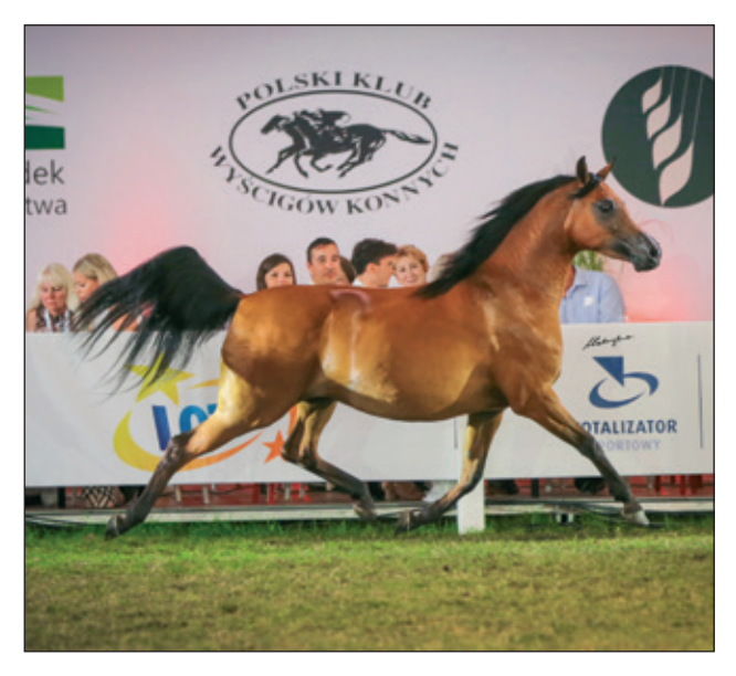
ALSARA KAHIL AL SHAQAB X ALEGRA LOT. S/8