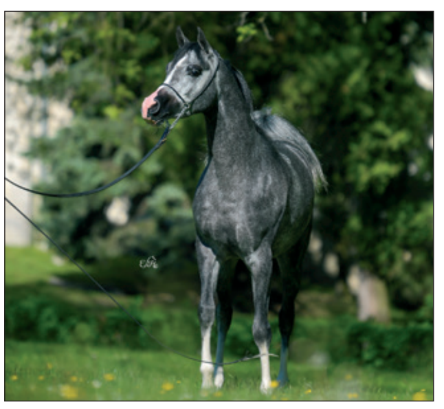
PENTARION MEDALION X PERNATA LOT. S/15