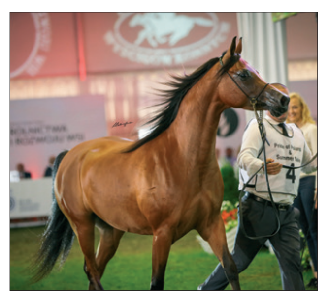
ALDONZA BORSALINO K X ALHASA LOT. S/4