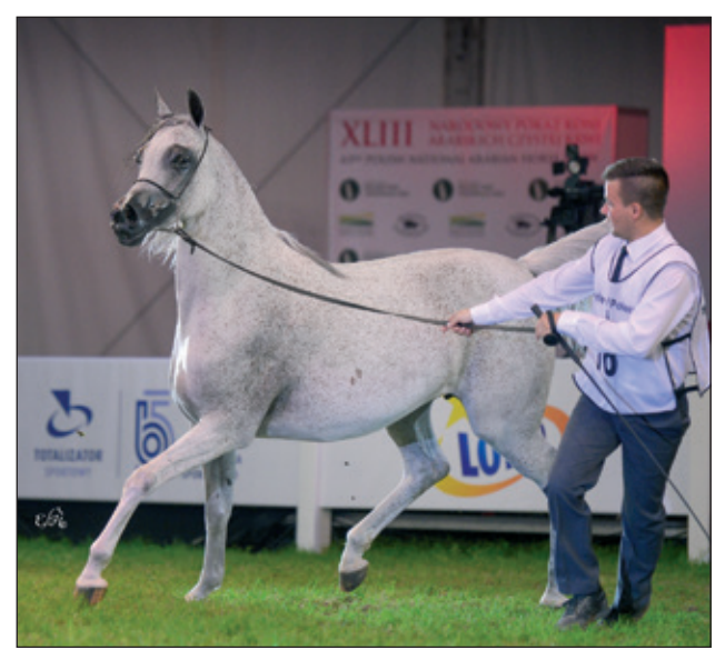
PUSTYNNA NOC WH KANEKO MS X PUSTYNNA ROSA LOT. 16