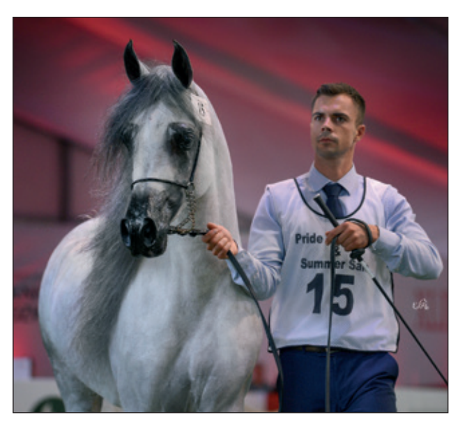
ERMITAGE QR MARC X EMANDORIA LOT. 15