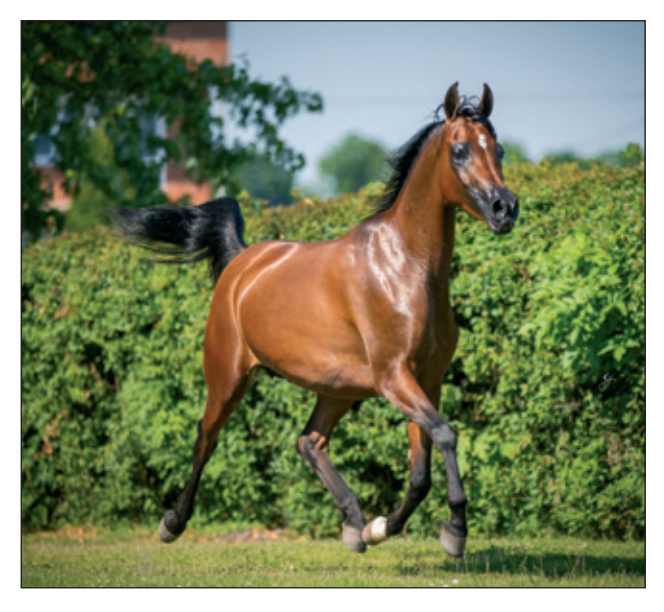
EMESTA EMERALD J X EMOCJA LOT. S/16