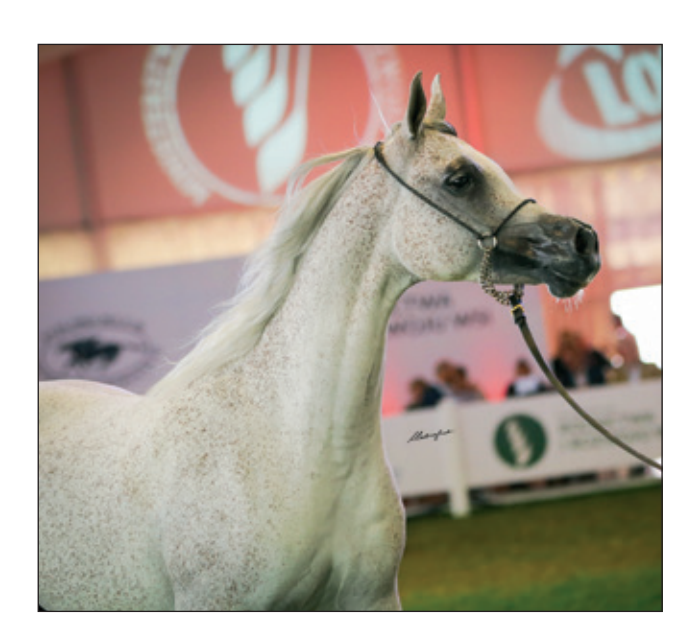
ENDORFINA ALERT X ETERYKA LOT. S/2