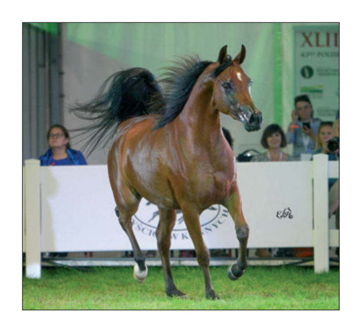
BRODNICA POGROM X BAMBINA LOT. 12