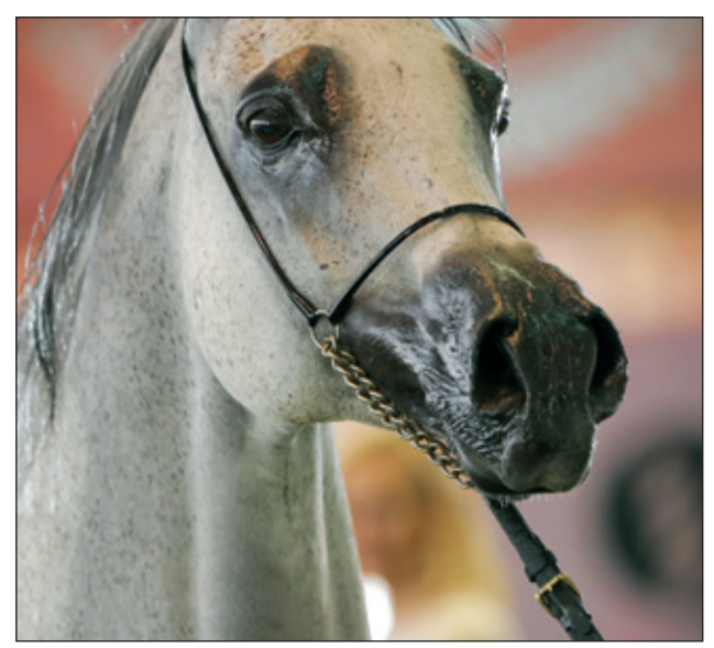
ELLENA EKSTERN X EL KAHIRA LOT. S/5