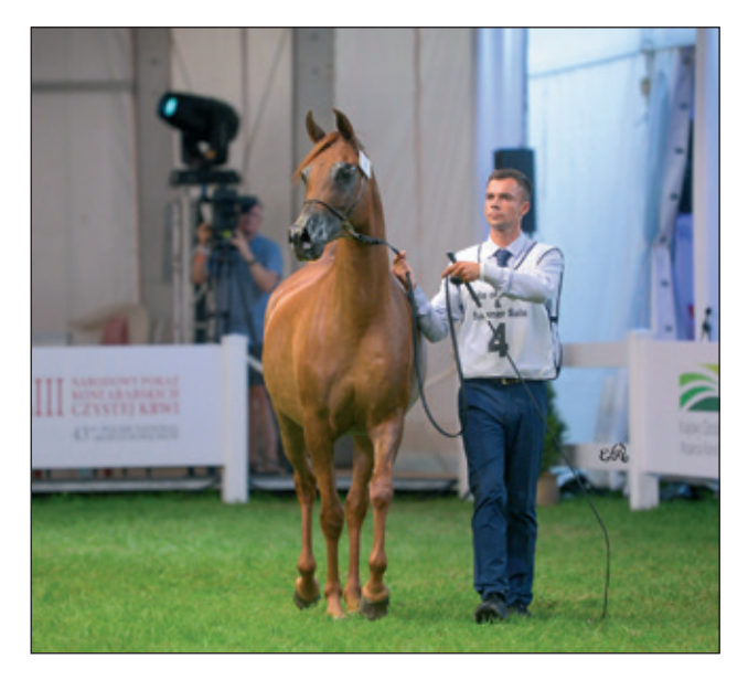
ENOBARIA QR MARC X EKLIPTYKA LOT. 4