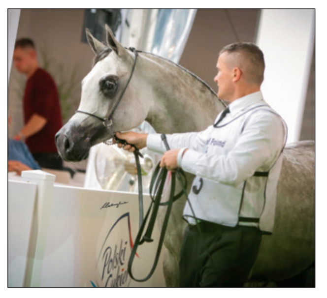
BINELLA EMPIRE X BINT ERMINA LOT. S/13