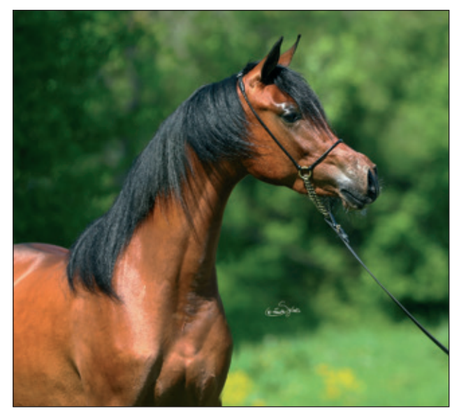
PRIMADORIA EMERALD J X PIA LOT. S/9