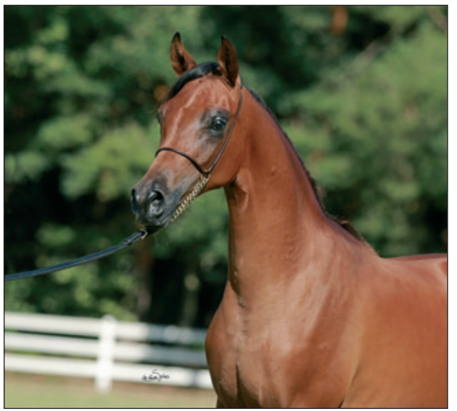
PARTITA PA MORION X POEZJA LOT. S/11