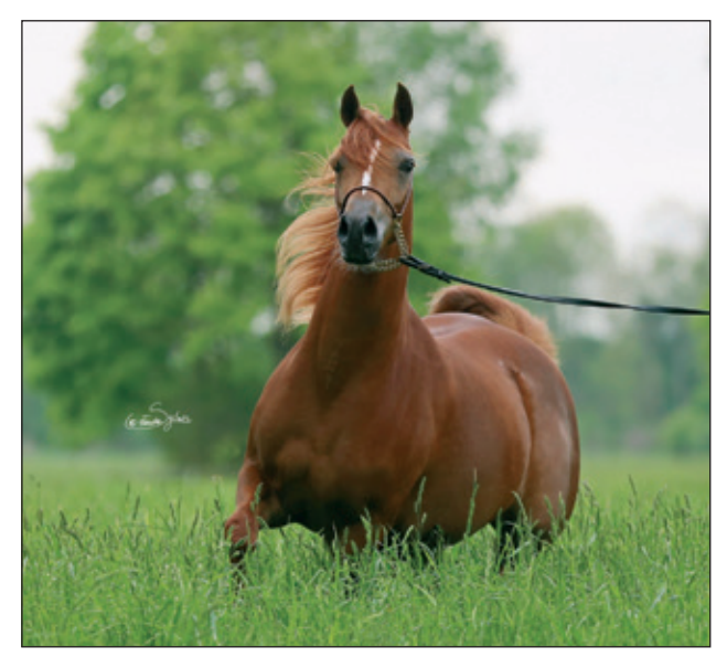
ELICIA BORSALINO K X EL FADA LOT. S/17