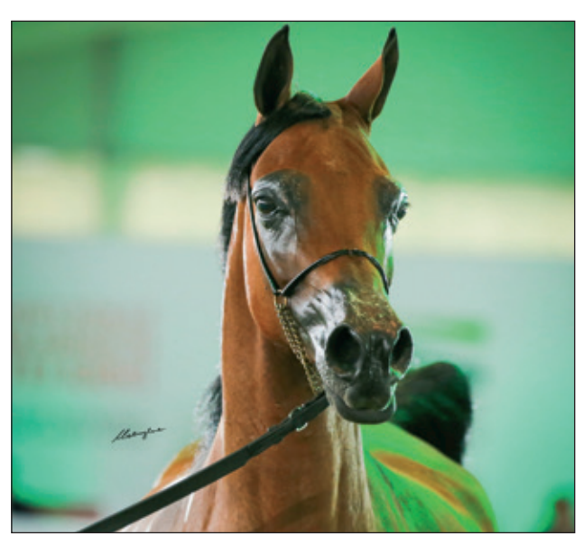
EL AZJA EKSTERN X EL DORRA LOT. S/7