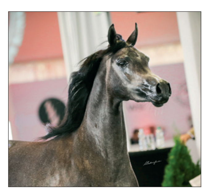
EL KASHIRA WADEE AL SHAQAB X EVICTORIA LOT. S/6