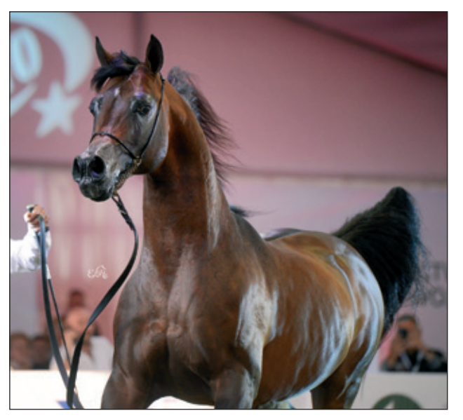
EQUATOR QR MARC X EKLIPTYKA LOT. 10