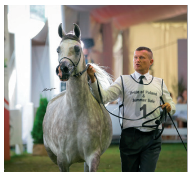
APPIANA ZUNDANCE JAMIL X ANTJA LOT. S/1