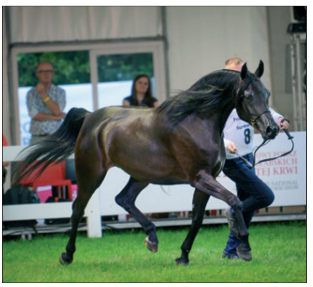
BEMOLA POMIAN X BELLISA LOT. 8