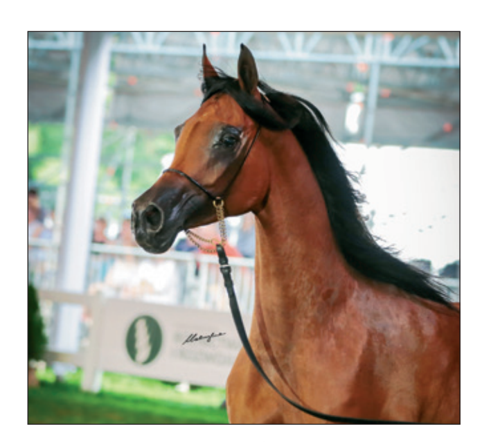
CHEROJA GANGES X CHERONEA LOT. S/14