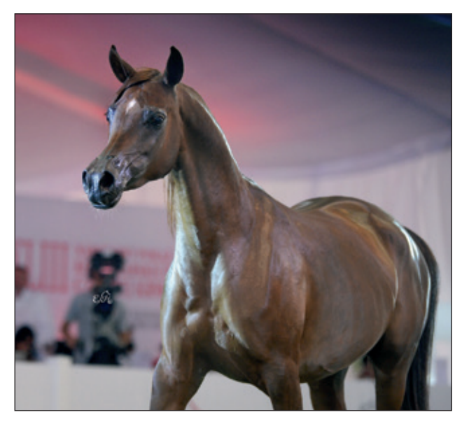
ESTAMA EKS ALIHANDRO X ESTAKA LOT. 9