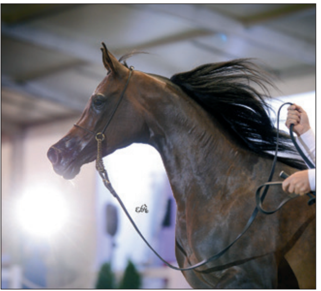
PARADNA EQUATOR X PIEKNA PANI LOT. 13