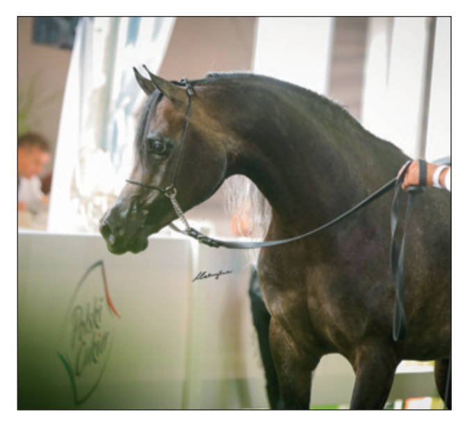
POINTER SAHM EL ARAB X PALANGA LOT. S/12