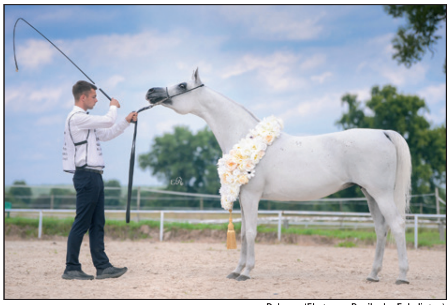
Palanga (Ekstern x Panika by Eukaliptus)

expected, the 19-year-old embodiment of feminine charm, the gorgeous grey Palanga, became Gold Champion Senior Mare. However, her win was not as obvious as it may seem. Her much younger paternal half-sister Protekcja, who also represents the same dam line of Gazella DB in Michalow, was nipping at her heels. Both received the same score in the championship but this time the ethereal beauty of the mature mare prevailed over the powerfully vibrant representative of a younger generation, and with a minimal difference in the class score, Protekcja had to give the highest place on the podium to her older half-sister. Scoring only two points less in the championship than Palanga and Protekcja, their classy chestnut stable companion, El Bellissima, was awarded with the Bronze Champion Senior Mare title. The mesmerising mares of Michalow were joined