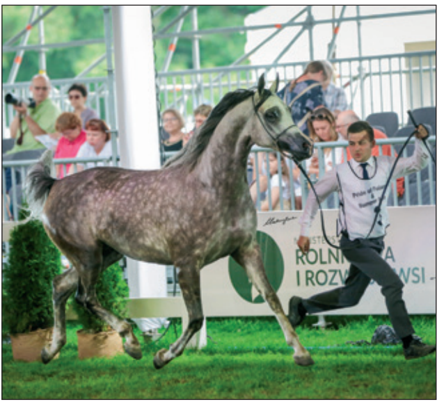
EMILIONA ZLOTY MEDAL X EMILY LOT. S/3