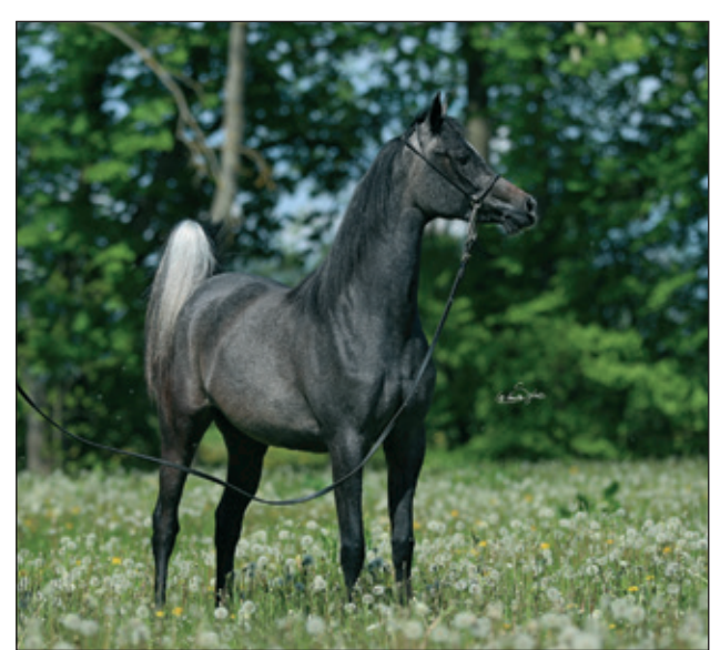
PASIONATA POGANIN X PASSIONARIA LOT. S/19