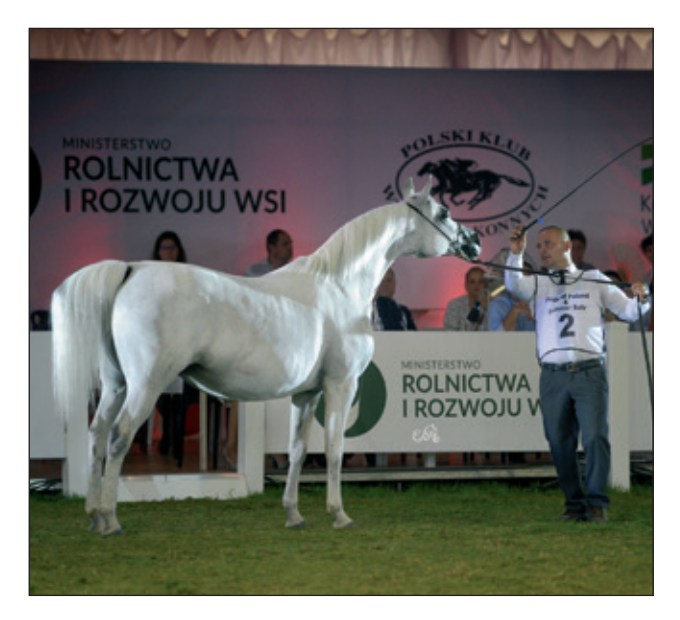
AMIGA PIAFF X AMRA LOT. 2