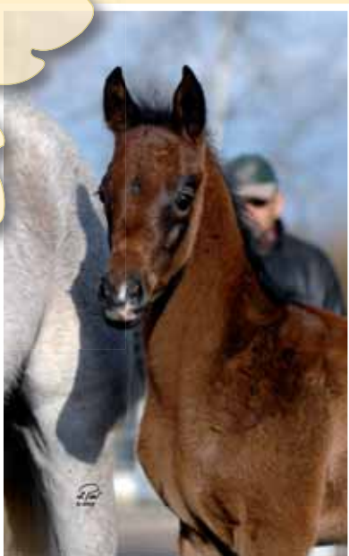
Fastella x Perseusz colt