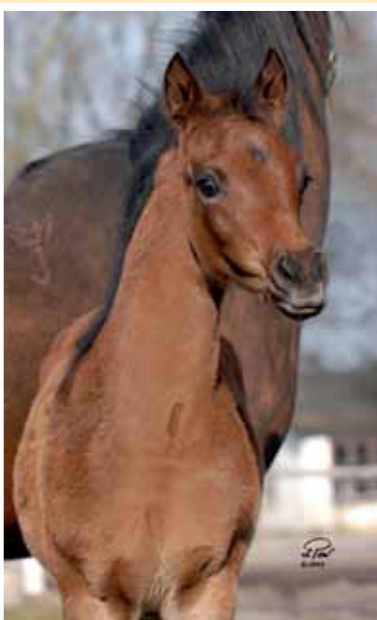
Czartawa x Ganges filly