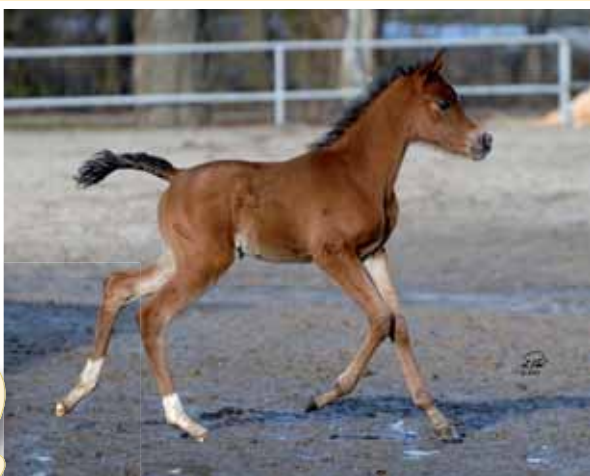
Belgica x Eden C filly