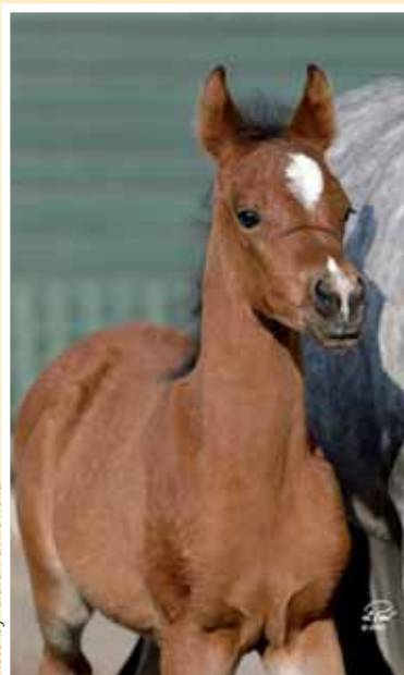
Pernila x Enzo filly