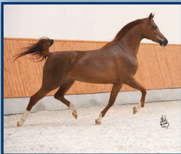
Fallada Monogramm x Fanaberia/Probat Michałów Stud

The youngest of the State Studs, Bialka, has often understatedly stolen the spotlight at the Pride of Poland with some of its finest