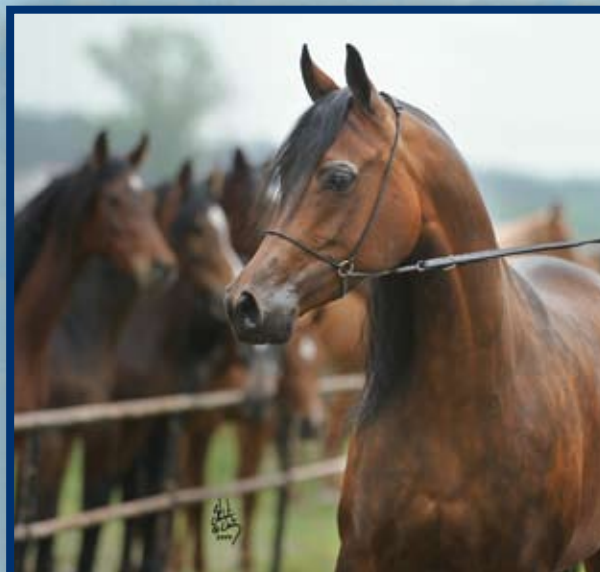
Gazal Al Shaqab x Fantazja/Wachlarz - Michałów Stud