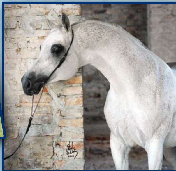
Eukaliptus x Algora/Probat - Janów Podlaski Stud