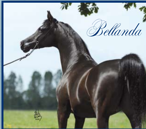
Pilot x Belladona/Europejczyk - Janów Podlaski Stud

Since 1979, the Polish National Show has showcased the finest of the Polish breeding program in conjunction with the annual auction. World renowned for its extraordinarily high calibre of excellence, the Polish National Show is a three day celebration of magnificent mares, charismatic stallions, captivating fillies and promising colts. Under the brilliance of the late summer sun, many of the greatest show horses of the last quarter century first found fame within the overwhelmingly enthusiastic show paddock of Janow Podlaski. Reigning European Triple Crown winner and show goddess supreme PLANISSIMA completed her domination of the Polish show ring on home turf in 2008 by not only unanimously capturing the title of Polish National Senior Champion Mare, but also by becoming the only horse ever to be twice named Best in Show at the Polish Nationals. Expect the same level of excitement and world-class quality in 2009,