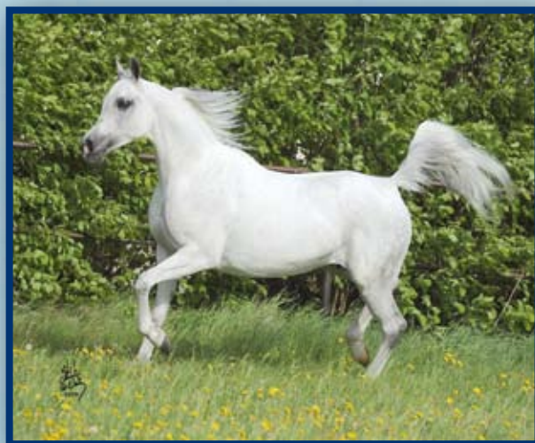
Emika Eldon x Emoza/Ernal Białka Stud

in years past. Unforgettable broodmares and accomplished show horses such as MAESTA, HULA, EUSKARA, FRASKATA, HEROLDIA and ELZUNIA have found good fortune with aspiring breeders around the world after passing through the auction. This year, Bialka adds EMIKA to this list of distinction, a mare greatly admired and desired by many of the most astute and accomplished international Arabian horse breeders. Also a former Polish National Reserve Champion and winner of the European stage, EMIKA is beloved for her superlative construction, classic type and charm, and her incredibly powerful trot, with its exceptional length of stride and strength of suspension.