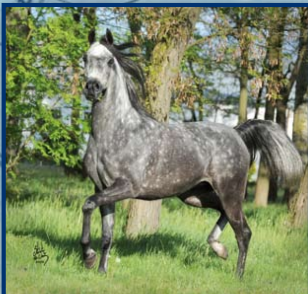
Ekstern x Pilar/Fawor - Janów Podlaski Stud