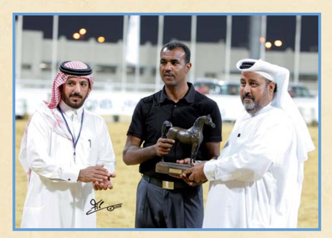
The Best horses of Citizen