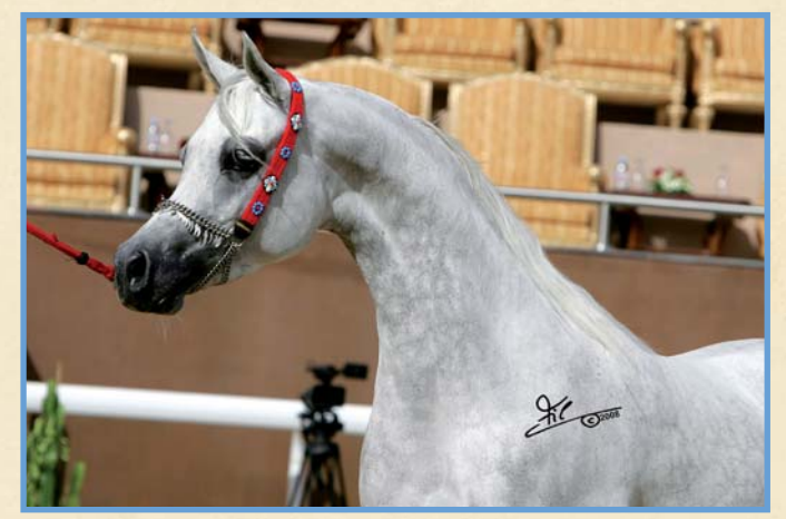
Top Five - Panarea by Palawan