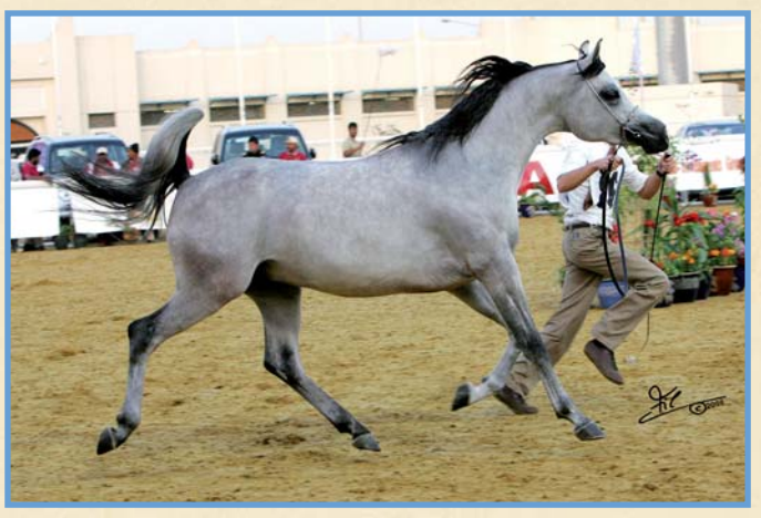
Top Five - Memphis 27