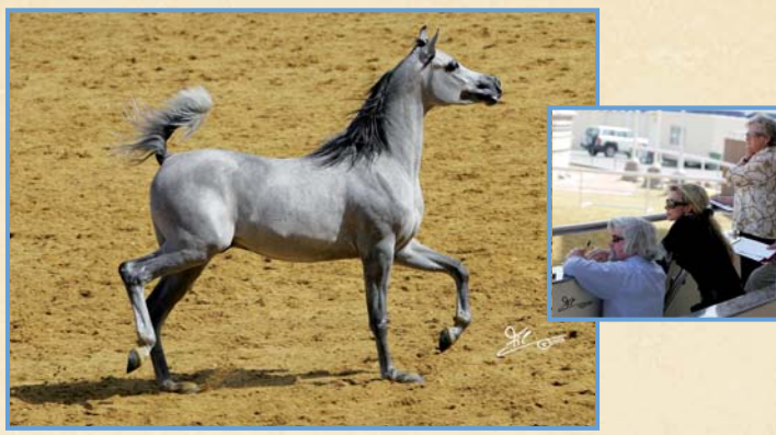
1° Pl. Females