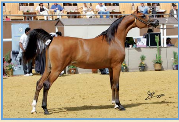
Sweet Caroline LL 2° PI. Fillies 2 years old (Class 2/A)