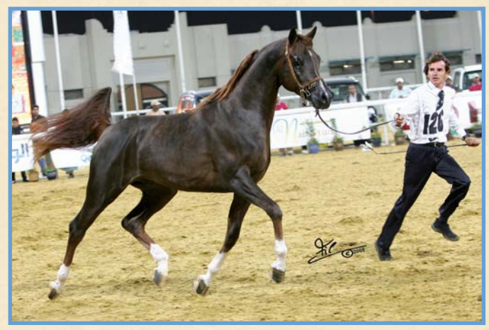
Top Five - IM Bayyard Cathare