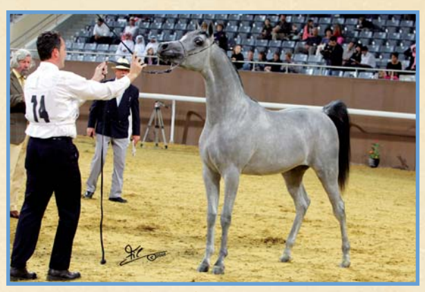
El Palacio VO 2° Pl. Colts 2 years old (Class 5)

He was followed by *El Palacio VO (Al Lahab x El Dorada), a gray colt bred in the United States and now owned by the Al Khalediah Stables of H.H. Prince Khaled Bin Sultan Bin Abdul Aziz Al Saud (KSA). The third place went to a lovely bay colt owned by the Royal Oman Stables,