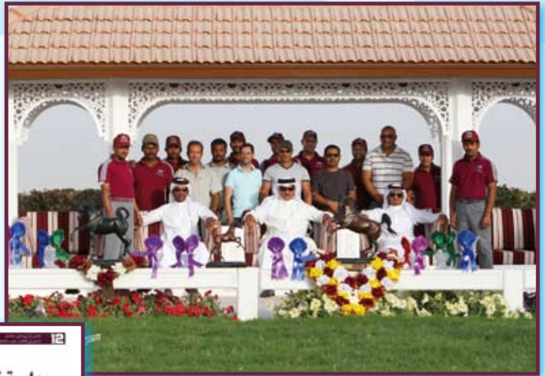
Al Shaqab Team