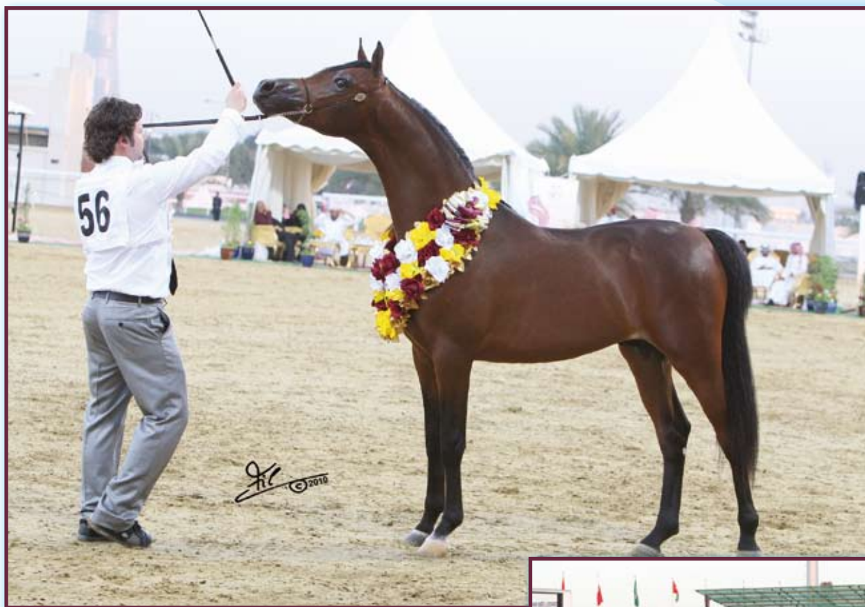
Khalil Al Shaqab (Marwan Al Shaqab x Ofw Mishaahl) Breeder/Owner: Al Shaqab, Qatar