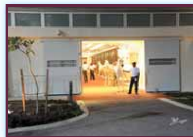
The evening was another celebration of the Arabian Horse heritage that is part of the foundation of the Qatari culture. The Breeding & Show section presented some horses in hand and in liberty