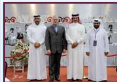
Al Shaqab' Breeding & Show deopartment 25 horses, and 24 were sold! A very good result and record, especially when noting that the buyers came from several different countries all over the Gulf!