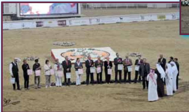
Judges & Officials