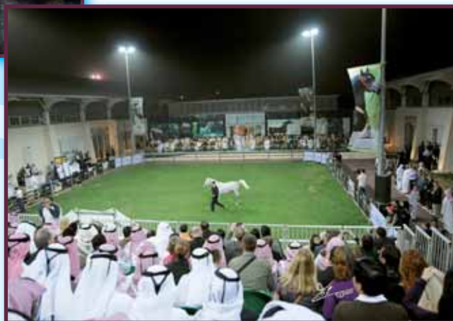
Al Shaqab, member of Qatar Foundation hosted once again an Open House straight after the Qatar International Championship 2011. The new stables and facilities were the location of the presentation arranged from the Al Shaqab Breeding & Show department to give an input to their new stables and some of their horses and breeding