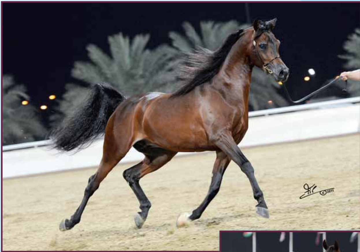
KAHIL AL SHAQAB (Marwan Al Shaqab x Ofw Mishaahl) Breeder/Owner: Al Shaqab, Qatar