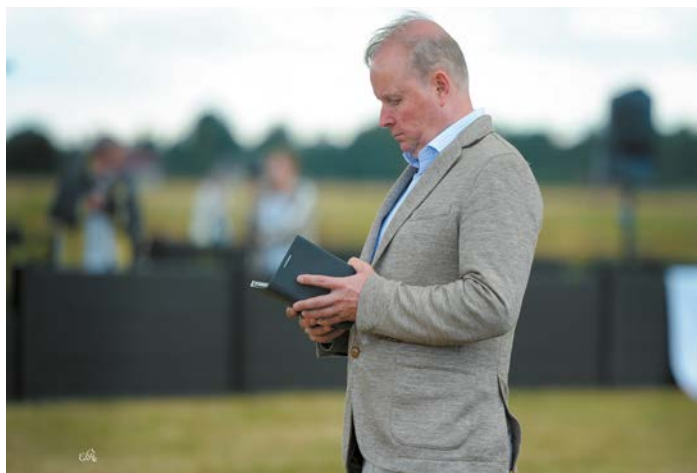
Judge James Swaenepoel (Belgium)