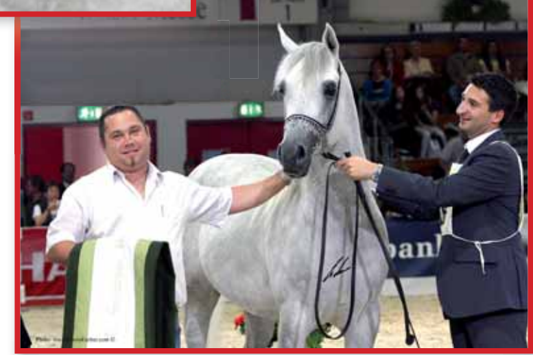
Al Emir Reserve Champion Stallions Owner/Breeders: Huber/AT