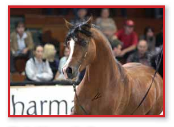
DA Kandahar Top Five