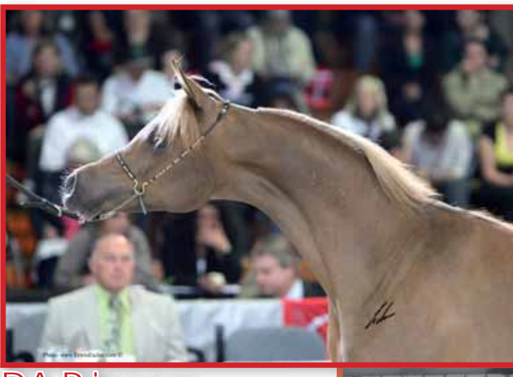
DA Princess Of Justice