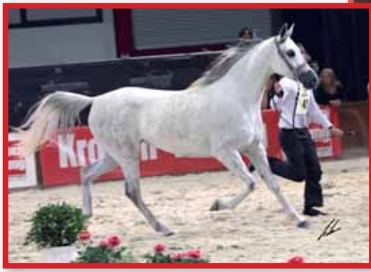
Faustyna Top Five