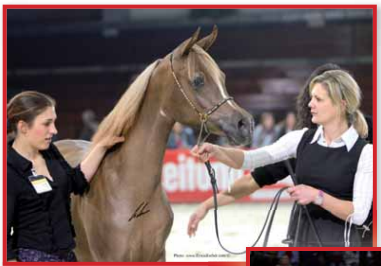
DA Princess Of Justice