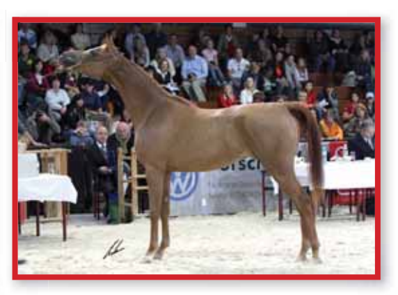
MM Escada Top Five