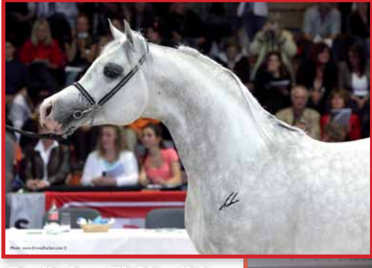
Galinka El Sheikh Champion Stallions Owner/Breeders: Selimah Arabians/AT