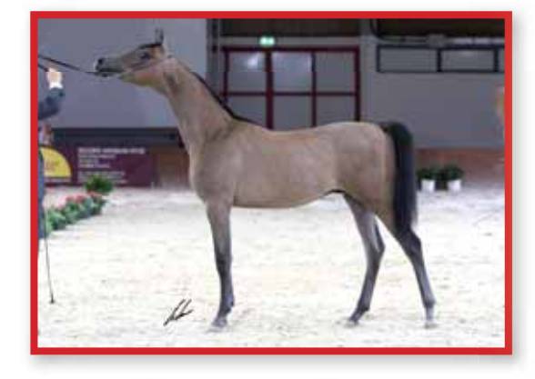
MM Fernando Top Five