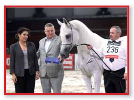
Emanda*** Top Five