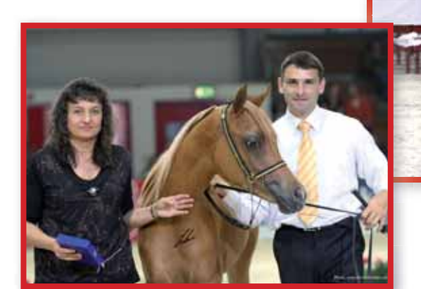
Eternal Rouge Reserve Champion Fillies Owner/Breeders: Rongits/AT