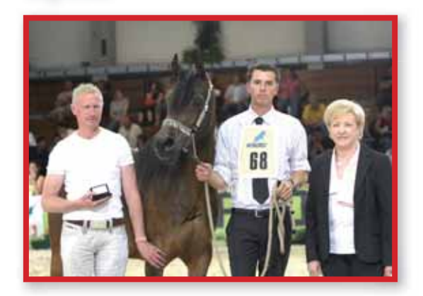
Aaliyah Bey Top Five

Owner: Williams & Brown/USA Breeders: Huemer/AT