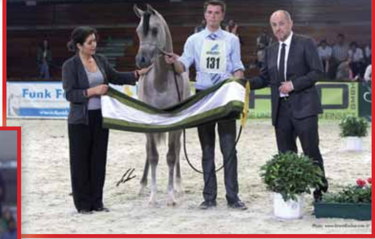
Aja Justified Reserve Champion Colts