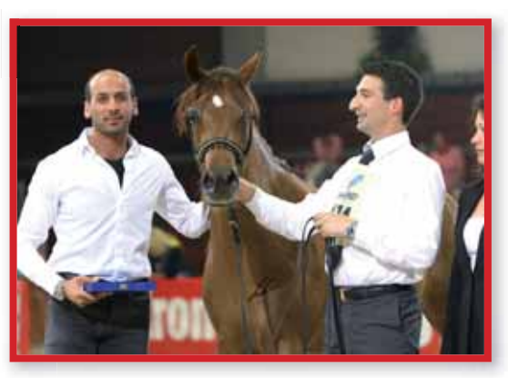
Psynata Top Five