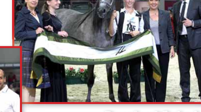
Psyche Victoria Reserve Champion Fillies