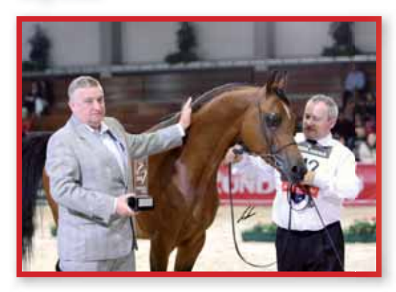
Drabant Top Five