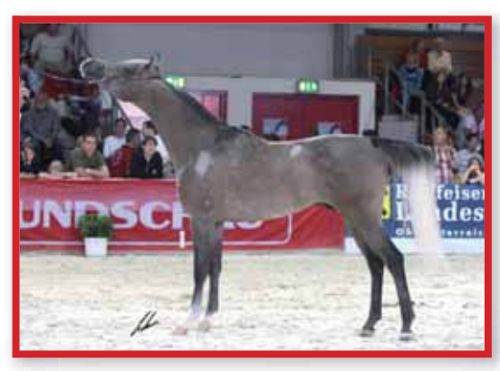
MM Samuel Top Five