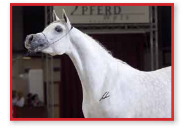
Mahala Top Five