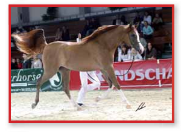
Kijara Top Five