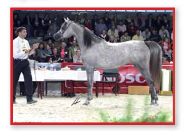
OM El Enigma Top Five